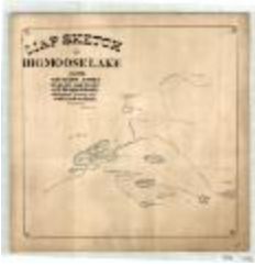
Map of Big Moose Lake and the Adjacent Lakes, Ponds, Streams and Trails (NYSA_B1405-96_14)