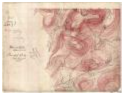
Map of Township Number 10 (Marked #3 of Series) (NYSA_B1405-96_107B2)