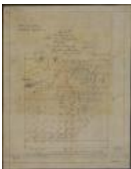
Map of Township No. 31, Totten and Crossfield's Purchase (NYSA_B1405-96_40)