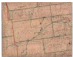
Map of the Towns of Plattsburgh, Beekmantown, Schuyler Falls, Peru and Au Sable, Ellenburg, Belmont, Franklin, Black Brook, Saranac and Dannemora (NYSA_B1405-96_150A05)