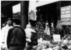
Government - Food Stamp Program in Rochester (NYSA_PPO_170)