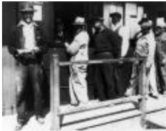
Construction - Black Construction workers (NYSA_PPO_113)