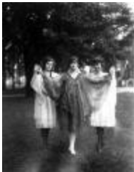
Recreation. The Queen of the Fairies. (NYSA_PPO_254)