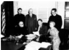
Education. Commissioner James E. Allen, Jr. (NYSA_PPO_150)