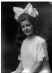
Children - Young Girl's Portait (NYSA_PPO_378)