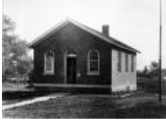
Education. One-Room School House. (NYSA_PPO_250)