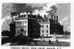
Franklin County Poorhouse (NYSA_PPO_175)