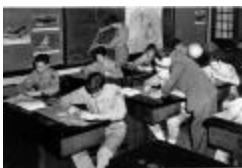
World War II - Navigation Class (NYSA_PPO_824)