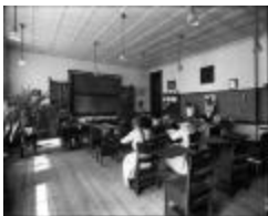
Education. Special Class of Girls. (NYSA_PPO_351)