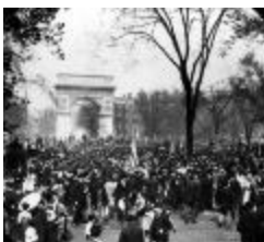
Culture. Italian Celebration. (NYSA_PPO_224)