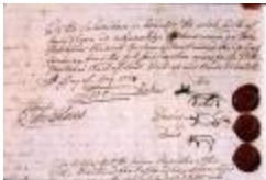
Native American - Portion of Indian Deed dated May 29, 1757 (NYSA_PPO_86)