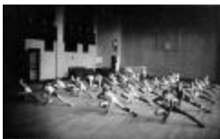
Education. Physical Education. (NYSA_PPO_257)