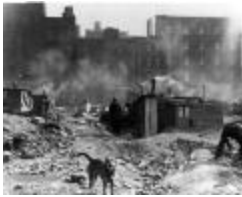
New York City. Hooverville in 1932. (NYSA_PPO_238)