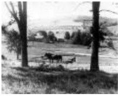
Agriculture. Farm Scene. (NYSA_PPO_69)