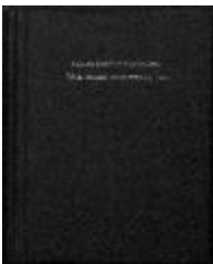
Public utilities annual report of Kings County Lighting Company, 1940 (NYSA_13345- 81_B231_F07_Kings_County_Lighting_Company_1940)