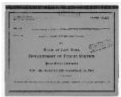
Public utilities annual report of Brooklyn Borough Gas Company, 1943 (NYSA_13345-81_B050_F07_Brooklyn_Borough_Gas_Company_1943)