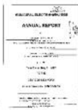
Municipal electric utilities annual report of the Village of Andover to the Public Service Commission, 2005 (NYSA_13345-13_Village_of_Andover_2005)