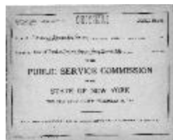
Public utilities annual report of Brooklyn Borough Gas Company, 1926 (NYSA_13345- 81_B049_F05_Brooklyn_Borough_Gas_Company_1926)