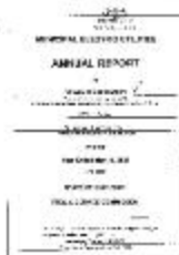
Municipal electric utilities annual report of the Village of Spencerport to the Public Service Commission, 2005 (NYSA_13345-13_Village_of_Spencerport_2005)