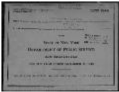
Public utilities annual report of Kings County Lighting Company, 1943 (NYSA_13345- 81_B232_F02_Kings_County_Lighting_Company_1943)