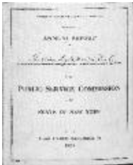
Public utilities annual report of The Astoria Light, Heat and Power Company, 1922 (NYSA_13345-81_B030_F06_Astoria_Light_Heat_Power_Company_1922)