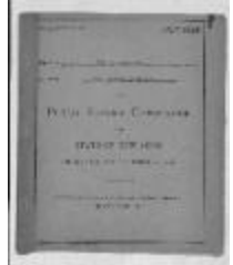
Public utilities annual report of Kings County Lighting Company, 1925 (NYSA_13345- 81_B230_F08_Kings_County_Lighting_Company_1925)