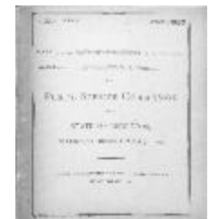
Public utilities annual report of The Astoria Light, Heat and Power Company, 1925 (NYSA_13345-81_B030_F03_Astoria_Light_Heat_Power_Company_1925)