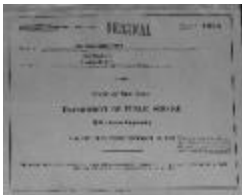
Public utilities annual report of Kings County Lighting Company, 1955 (NYSA_13345-81_B233_F02_Kings_County_Lighting_Company_1955)