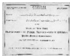
Public utilities annual report of Brooklyn Borough Gas Company, 1931 (NYSA_13345- 81_B049_F10_Brooklyn_Borough_Gas_Company_1931)