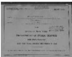
Public utilities annual report of Kings County Lighting Company, 1949 (NYSA_13345- 81_B232_F08_Kings_County_Lighting_Company_1949)