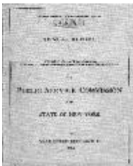
Public utilities annual report of Brooklyn Borough Gas Company, 1923 (NYSA_13345-81_B049_F02_Brooklyn_Borough_Gas_Company_1923)