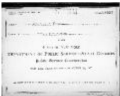
Public utilities annual report of The Astoria Light, Heat and Power Company, 1927 (NYSA_13345-81_B030_F01_Astoria_Light_Heat_Power_Company_1927)