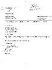
Municipal electric utilities annual report of the Village of Frankfort to the Public Service Commission, 2007 (NYSA_13345-13_Village_of_Frankfort_2007)