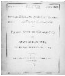
Public utilities annual report of The Astoria Light, Heat and Power Company, 1924 (NYSA_13345-81_B030_F04_Astoria_Light_Heat_Power_Company_1924)