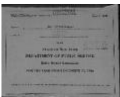
Public utilities annual report of Kings County Lighting Company, 1948 (NYSA_13345- 81_B232_F07_Kings_County_Lighting_Company_1948)