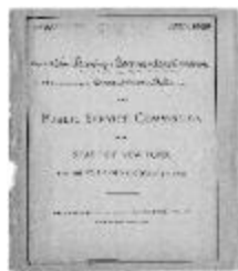
Public utilities annual report of Brooklyn Borough Gas Company, 1925 (NYSA_13345- 81_B049_F04_Brooklyn_Borough_Gas_Company_1925)