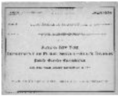
Public utilities annual report of Brooklyn Borough Gas Company, 1928 (NYSA_13345- 81_B049_F07_Brooklyn_Borough_Gas_Company_1928)