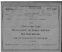
Public utilities annual report of Kings County Lighting Company, 1946 (NYSA_13345- 81_B232_F05_Kings_County_Lighting_Company_1946)