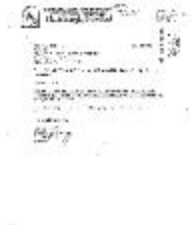
Municipal electric utilities annual report of the Plattsburgh Municipal Lighting Department to the Public Service Commission, 2007 (NYSA_13345-13_Plattsburgh_Municipal_2007)