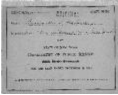
Public utilities annual report of Brooklyn Borough Gas Company, 1932 (NYSA_13345- 81_B049_F11_Brooklyn_Borough_Gas_Company_1932)