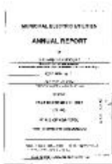
Municipal electric utilities annual report of the Village of Endicott to the Public Service Commission, 2007 (NYSA_13345-13_Village_of_Endicott_2007)