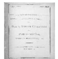
Public utilities annual report of The Astoria Light, Heat and Power Company, 1925 (NYSA_13345-81_B030_F03_Astoria_Light_Heat_Power_Company_1925)