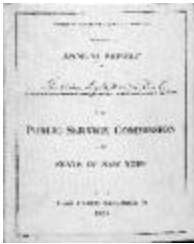
Public utilities annual report of The Astoria Light, Heat and Power Company, 1922 (NYSA_13345-81_B030_F06_Astoria_Light_Heat_Power_Company_1922)