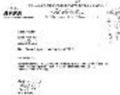
Municipal electric utilities annual report of the Village of Ilion to the Public Service Commission, 2005 (NYSA_13345-13_Village_of_Ilion_2005)