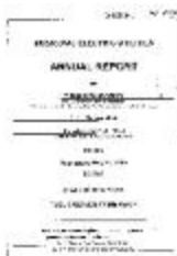
Municipal electric utilities annual report of the Village of Skaneateles to the Public Service Commission, 2005 (NYSA_13345-13_Village_of_Skaneateles_2005)