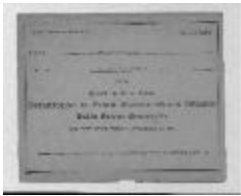
Public utilities annual report of Kings County Lighting Company, 1927 (NYSA_13345- 81_B230_F10_Kings_County_Lighting_Company_1927)