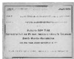
Public utilities annual report of Brooklyn Borough Gas Company, 1928 (NYSA_13345- 81_B049_F07_Brooklyn_Borough_Gas_Company_1928)