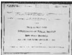
Public utilities annual report of New Amsterdam Gas Company, 1933 (NYSA_13345-81_B287_F07_New_Amsterdam_Gas_Company_1933)