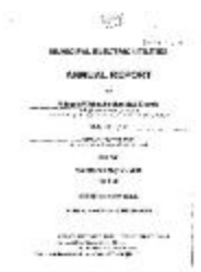
Municipal electric utilities annual report of the Village of Wellsville to the Public Service Commission, 2008 (NYSA_13345-15_Village_of_Wellsville_2008)