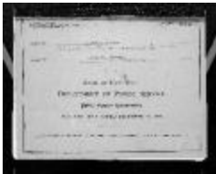
Public utilities annual report of New Amsterdam Gas Company, 1932 (NYSA_13345-81_B287_F06_New_Amsterdam_Gas_Company_1932)