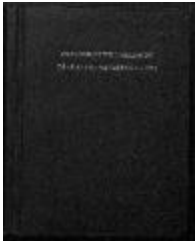
Public utilities annual report of Kings County Lighting Company, 1938 (NYSA_13345- 81_B231_F05_Kings_County_Lighting_Company_1938)