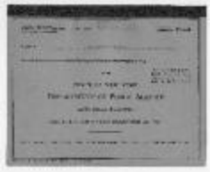
Public utilities annual report of Brooklyn Borough Gas Company, 1944 (NYSA_13345- 81_B050_F08_Brooklyn_Borough_Gas_Company_1944)