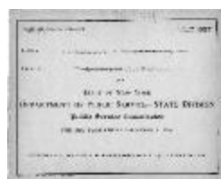
Public utilities annual report of Brooklyn Borough Gas Company, 1927 (NYSA_13345- 81_B049_F06_Brooklyn_Borough_Gas_Company_1927)