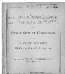
Public utilities annual report of Brooklyn Borough Gas Company, 1924 (NYSA_13345-81_B049_F03_Brooklyn_Borough_Gas_Company_1924)