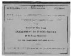
Public utilities annual report of Brooklyn Borough Gas Company, 1947 (NYSA_13345- 81_B050_F11_Brooklyn_Borough_Gas_Company_1947)