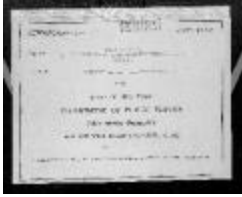
Public utilities annual report of Kings County Lighting Company, 1932 (NYSA_13345- 81_B230_F15_Kings_County_Lighting_Company_1932)