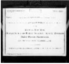
Public utilities annual report of New Amsterdam Gas Company, 1927 (NYSA_13345-81_B287_F01_New_Amsterdam_Gas_Company_1927)