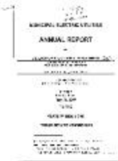
Municipal electric utilities annual report of the Village of Ilion to the Public Service Commission, 2007 (NYSA_13345-13_Village_of_Ilion_2007)