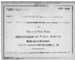
Public utilities annual report of Brooklyn Borough Gas Company, 1935 (NYSA_13345- 81_B049_F14_Brooklyn_Borough_Gas_Company_1935)