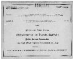
Public utilities annual report of Brooklyn Borough Gas Company, 1934 (NYSA_13345-81_B049_F13_Brooklyn_Borough_Gas_Company_1934)