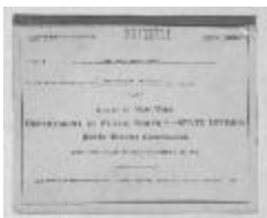
Public utilities annual report of Kings County Lighting Company, 1930 (NYSA_13345- 81_B230_F13_Kings_County_Lighting_Company_1930)