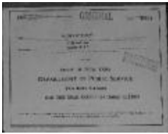
Public utilities annual report of Kings County Lighting Company, 1951 (NYSA_13345-81_B232_F10_Kings_County_Lighting_Company_1951)