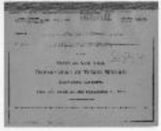
Public utilities annual report of Brooklyn Borough Gas Company, 1945 (NYSA_13345- 81_B050_F09_Brooklyn_Borough_Gas_Company_1945)