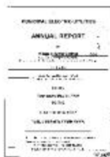
Municipal electric utilities annual report of the Village of Silver Springs to the Public Service Commission, 2006 (NYSA_13345-13_Village_of_Silver_Springs_2006)