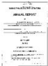
Municipal electric utilities annual report of the Village of Holley to the Public Service Commission, 2006 (NYSA_13345-13_Village_of_Holley_2006)