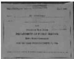
Public utilities annual report of Kings County Lighting Company, 1948 (NYSA_13345- 81_B232_F07_Kings_County_Lighting_Company_1948)