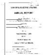
Municipal electric utilities annual report of the Village of Westfield to the Public Service Commission, 2008 (NYSA_13345-15_Village_of_Westfield_2008)