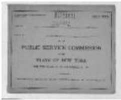
Public utilities annual report of Kings County Lighting Company, 1926 (NYSA_13345- 81_B230_F09_Kings_County_Lighting_Company_1926)