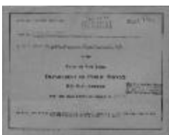
Public utilities annual report of Kings County Lighting Company, 1956 (NYSA_13345-81_B233_F03_Kings_County_Lighting_Company_1956)