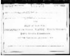
Public utilities annual report of The Astoria Light, Heat and Power Company, 1930 (NYSA_13345-81_B029_F07_Astoria_Light_Heat_Power_Company_1930)