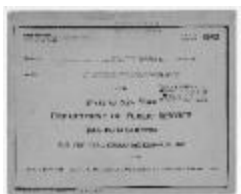
Public utilities annual report of Brooklyn Borough Gas Company, 1942 (NYSA_13345-81_B050_F06_Brooklyn_Borough_Gas_Company_1942)