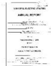
Municipal electric utilities annual report of the Village of Westfield to the Public Service Commission, 2008 (NYSA_13345-15_Village_of_Westfield_2008)