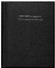
Public utilities annual report of Kings County Lighting Company, 1941 (NYSA_13345- 81_B231_F08_Kings_County_Lighting_Company_1941)