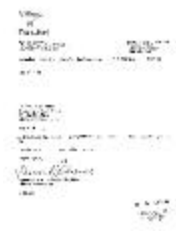
Municipal electric utilities annual report of the Village of Frankfort to the Public Service Commission, 2006 (NYSA_13345-13_Village_of_Frankfort_2006)