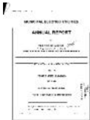
Municipal electric utilities annual report of the Village of Akron to the Public Service Commission, 2005 (NYSA_13345-13_Village_of_Akron_2005)