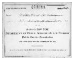
Public utilities annual report of Brooklyn Borough Gas Company, 1930 (NYSA_13345- 81_B049_F09_Brooklyn_Borough_Gas_Company_1930)