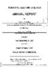
Municipal electric utilities annual report of the Village of Holley to the Public Service Commission, 2007 (NYSA_13345-13_Village_of_Holley_2007)