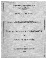
Public utilities annual report of Brooklyn Borough Gas Company, 1923 (NYSA_13345-81_B049_F02_Brooklyn_Borough_Gas_Company_1923)