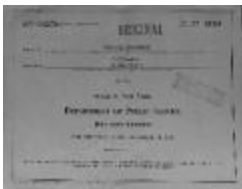
Public utilities annual report of Kings County Lighting Company, 1954 (NYSA_13345-81_B233_F01_Kings_County_Lighting_Company_1954)