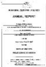
Municipal electric utilities annual report of the Village of Skaneateles to the Public Service Commission, 2007 (NYSA_13345-13_Village_of_Skaneateles_2007)