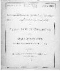
Public utilities annual report of The Astoria Light, Heat and Power Company, 1924 (NYSA_13345-81_B030_F04_Astoria_Light_Heat_Power_Company_1924)