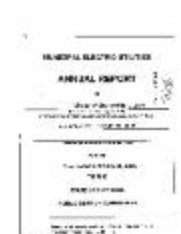
Municipal electric utilities annual report of the Village of Churchville to the Public Service Commission, 2006 (NYSA_13345-13_Village_of_Churchville_2006)