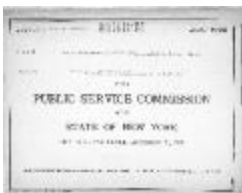
Public utilities annual report of The Astoria Light, Heat and Power Company, 1926 (NYSA_13345-81_B030_F02_Astoria_Light_Heat_Power_Company_1926)