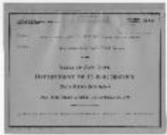
Public utilities annual report of Brooklyn Borough Gas Company, 1946 (NYSA_13345- 81_B050_F10_Brooklyn_Borough_Gas_Company_1946)