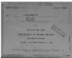
Public utilities annual report of Kings County Lighting Company, 1953 (NYSA_13345-81_B232_F12_Kings_County_Lighting_Company_1953)