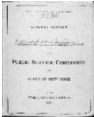
Public utilities annual report of The Astoria Light, Heat and Power Company, 1923 (NYSA_13345-81_B030_F05_Astoria_Light_Heat_Power_Company_1923)