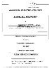
Municipal electric utilities annual report of the Village of Akron to the Public Service Commission, 2007 (NYSA_13345-13_Village_of_Akron_2007)