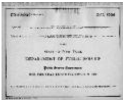
Public utilities annual report of Brooklyn Borough Gas Company, 1936 (NYSA_13345-81_B049_F15_Brooklyn_Borough_Gas_Company_1936)