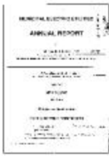
Municipal electric utilities annual report of the Village of Holley to the Public Service Commission, 2005 (NYSA_13345-13_Village_of_Holley_2005)