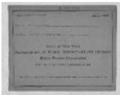
Public utilities annual report of Kings County Lighting Company, 1929 (NYSA_13345- 81_B230_F12_Kings_County_Lighting_Company_1929)