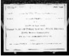
Public utilities annual report of New Amsterdam Gas Company, 1928 (NYSA_13345-81_B287_F02_New_Amsterdam_Gas_Company_1928)