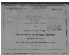
Public utilities annual report of Kings County Lighting Company, 1949 (NYSA_13345- 81_B232_F08_Kings_County_Lighting_Company_1949)