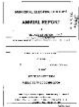
Municipal electric utilities annual report of the Village of Akron to the Public Service Commission, 2006 (NYSA_13345-13_Village_of_Akron_2006)