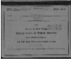
Public utilities annual report of Kings County Lighting Company, 1944 (NYSA_13345- 81_B232_F03_Kings_County_Lighting_Company_1944)