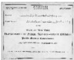
Public utilities annual report of Brooklyn Borough Gas Company, 1931