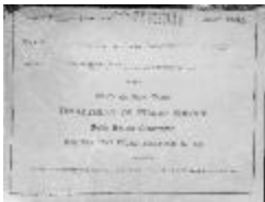
Report of the Long Island Lighting Company to the State of New York Department of Public Service Public Service Commission for the Year Ended December 31, 1932 (NYSA_13345-89_B41_F24_1932-12- 31)