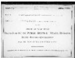
Public utilities annual report of The Astoria Light, Heat and Power Company, 1928 (NYSA_13345-81_B029_F09_Astoria_Light_Heat_Power_Company_1928)