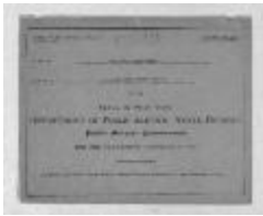
Public utilities annual report of Kings County Lighting Company, 1928 (NYSA_13345- 81_B230_F11_Kings_County_Lighting_Company_1928)