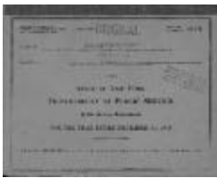
Public utilities annual report of Kings County Lighting Company, 1945 (NYSA_13345- 81_B232_F04_Kings_County_Lighting_Company_1945)