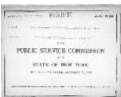
Public utilities annual report of The Astoria Light, Heat and Power Company, 1926 (NYSA_13345-81_B030_F02_Astoria_Light_Heat_Power_Company_1926)