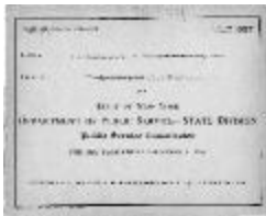
Public utilities annual report of Brooklyn Borough Gas Company, 1927 (NYSA_13345- 81_B049_F06_Brooklyn_Borough_Gas_Company_1927)