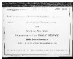
Public utilities annual report of The Astoria Light, Heat and Power Company, 1935 (NYSA_13345-81_B029_F02_Astoria_Light_Heat_Power_Company_1935)