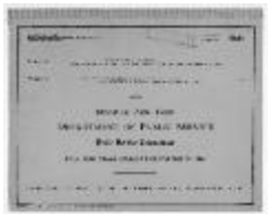
Public utilities annual report of Brooklyn Borough Gas Company, 1941 (NYSA_13345- 81_B050_F05_Brooklyn_Borough_Gas_Company_1941)