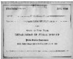
Public utilities annual report of Brooklyn Borough Gas Company, 1936 (NYSA_13345- 81_B049_F15_Brooklyn_Borough_Gas_Company_1936)