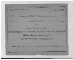
Public utilities annual report of Kings County Lighting Company, 1927 (NYSA_13345- 81_B230_F10_Kings_County_Lighting_Company_1927)