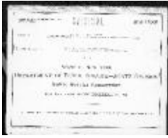
Public utilities annual report of Kings County Lighting Company, 1931 (NYSA_13345- 81_B230_F14_Kings_County_Lighting_Company_1931)