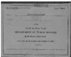
Public utilities annual report of Kings County Lighting Company, 1947 (NYSA_13345- 81_B232_F06_Kings_County_Lighting_Company_1947)