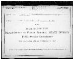
Public utilities annual report of The Astoria Light, Heat and Power Company, 1929 (NYSA_13345-81_B029_F08_Astoria_Light_Heat_Power_Company_1929)