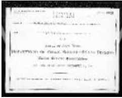
Public utilities annual report of The Astoria Light, Heat and Power Company, 1931 (NYSA_13345-81_B029_F06_Astoria_Light_Heat_Power_Company_1931)