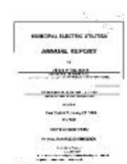
Municipal electric utilities annual report of the Village of Churchville to the Public Service Commission, 2005 (NYSA_13345-13_Village_of_Churchville_2005)