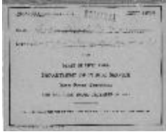
Public utilities annual report of Brooklyn Borough Gas Company, 1933 (NYSA_13345-81_B049_F12_Brooklyn_Borough_Gas_Company_1933)