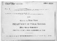
Public utilities annual report of New Amsterdam Gas Company, 1934 (NYSA_13345-81_B287_F08_New_Amsterdam_Gas_Company_1934)