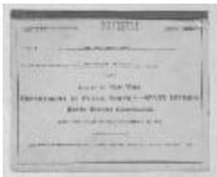
Public utilities annual report of Kings County Lighting Company, 1930 (NYSA_13345- 81_B230_F13_Kings_County_Lighting_Company_1930)