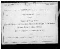
Public utilities annual report of New Amsterdam Gas Company, 1929 (NYSA_13345-81_B287_F03_New_Amsterdam_Gas_Company_1929)