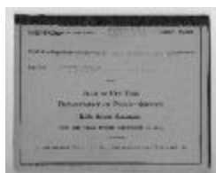
Public utilities annual report of The Astoria Light, Heat and Power Company, 1933 (NYSA_13345-81_B029_F04_Astoria_Light_Heat_Power_Company_1933)