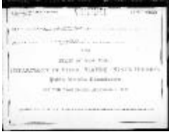
Public utilities annual report of The Astoria Light, Heat and Power Company, 1930 (NYSA_13345-81_B029_F07_Astoria_Light_Heat_Power_Company_1930)