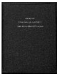
Public utilities annual report of Kings County Lighting Company, 1942 (NYSA_13345- 81_B232_F01_Kings_County_Lighting_Company_1942)