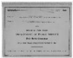
Public utilities annual report of Brooklyn Borough Gas Company, 1941 (NYSA_13345-81_B050_F05_Brooklyn_Borough_Gas_Company_1941)