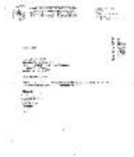
Municipal electric utilities annual report of the Plattsburgh Municipal Lighting Department to the Public Service Commission, 2006 (NYSA_13345-13_Plattsburgh_Municipal_2006)