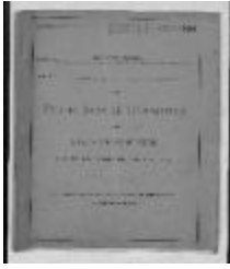
Public utilities annual report of Kings County Lighting Company, 1924 (NYSA_13345- 81_B230_F07_Kings_County_Lighting_Company_1924)