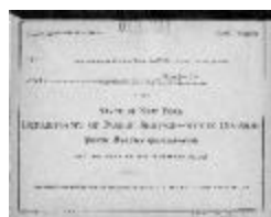
Public utilities annual report of Brooklyn Borough Gas Company, 1929 (NYSA_13345- 81_B049_F08_Brooklyn_Borough_Gas_Company_1929)