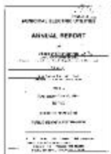
Municipal electric utilities annual report of the Village of Silver Springs to the Public Service Commission, 2007 (NYSA_13345-13_Village_of_Silver_Springs_2007)