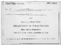
Public utilities annual report of New Amsterdam Gas Company, 1934 (NYSA_13345-81_B287_F08_New_Amsterdam_Gas_Company_1934)