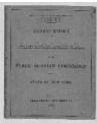
Public utilities annual report of Kings County Lighting Company, 1923 (NYSA_13345- 81_B230_F06_Kings_County_Lighting_Company_1923)