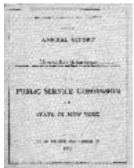
Public utilities annual report of Brooklyn Borough Gas Company, 1922 (NYSA_13345-81_B049_F01_Brooklyn_Borough_Gas_Company_1922)