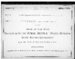
Public utilities annual report of The Astoria Light, Heat and Power Company, 1928 (NYSA_13345-81_B029_F09_Astoria_Light_Heat_Power_Company_1928)