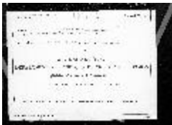
Public utilities annual report of New Amsterdam Gas Company, 1931 (NYSA_13345-81_B287_F05_New_Amsterdam_Gas_Company_1931)