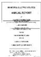
Municipal electric utilities annual report of the Village of Skaneateles to the Public Service Commission, 2006 (NYSA_13345-13_Village_of_Skaneateles_2006)