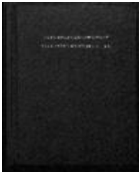
Public utilities annual report of Kings County Lighting Company, 1939 (NYSA_13345- 81_B231_F06_Kings_County_Lighting_Company_1939)