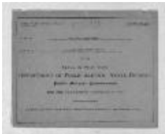
Public utilities annual report of Kings County Lighting Company, 1928 (NYSA_13345- 81_B230_F11_Kings_County_Lighting_Company_1928)