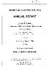
Municipal electric utilities annual report of the Village of Theresa to the Public Service Commission, 2008 (NYSA_13345-15_Village_of_Theresa_2008)