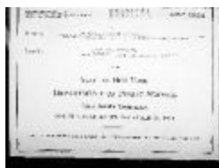
Public utilities annual report of The Astoria Light, Heat and Power Company, 1934 (NYSA_13345-81_B029_F03_Astoria_Light_Heat_Power_Company_1934)