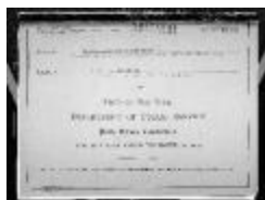
Public utilities annual report of The Astoria Light, Heat and Power Company, 1932 (NYSA_13345-81_B029_F05_Astoria_Light_Heat_Power_Company_1932)