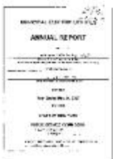
Municipal electric utilities annual report of the Village of Little Valley to the Public Service Commission, 2007 (NYSA_13345-13_Village_of_Little_Valley_2007)