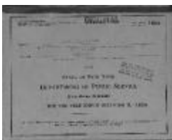
Public utilities annual report of Kings County Lighting Company, 1950 (NYSA_13345- 81_B232_F09_Kings_County_Lighting_Company_1950)