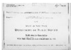
Public utilities annual report of The Astoria Light, Heat and Power Company, 1936 (NYSA_13345-81_B029_F01_Astoria_Light_Heat_Power_Company_1936)