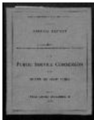
Public utilities annual report of Kings County Lighting Company, 1922 (NYSA_13345- 81_B230_F05_Kings_County_Lighting_Company_1922)