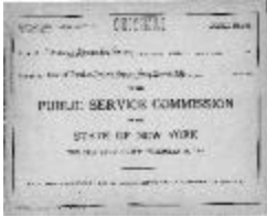
Public utilities annual report of Brooklyn Borough Gas Company, 1926 (NYSA_13345- 81_B049_F05_Brooklyn_Borough_Gas_Company_1926)