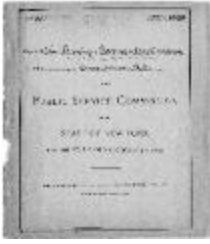
Public utilities annual report of Brooklyn Borough Gas Company, 1925 (NYSA_13345- 81_B049_F04_Brooklyn_Borough_Gas_Company_1925)