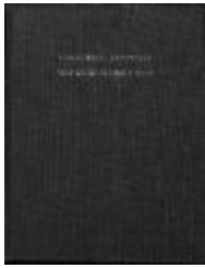
Public utilities annual report of Kings County Lighting Company, 1937 (NYSA_13345- 81_B231_F04_Kings_County_Lighting_Company_1937)