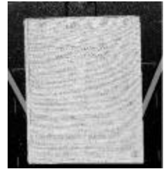
Public utilities annual report of Kings County Lighting Company, 1933 (NYSA_13345- 81_B230_F16_Kings_County_Lighting_Company_1933)