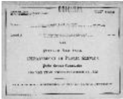
Public utilities annual report of Brooklyn Borough Gas Company, 1934 (NYSA_13345- 81_B049_F13_Brooklyn_Borough_Gas_Company_1934)