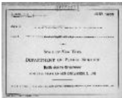
Public utilities annual report of Brooklyn Borough Gas Company, 1935 (NYSA_13345-81_B049_F14_Brooklyn_Borough_Gas_Company_1935)