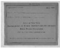
Public utilities annual report of Kings County Lighting Company, 1929 (NYSA_13345- 81_B230_F12_Kings_County_Lighting_Company_1929)