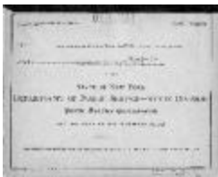
Public utilities annual report of Brooklyn Borough Gas Company, 1929 (NYSA_13345- 81_B049_F08_Brooklyn_Borough_Gas_Company_1929)