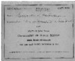
Public utilities annual report of Brooklyn Borough Gas Company, 1932 (NYSA_13345-81_B049_F11_Brooklyn_Borough_Gas_Company_1932)