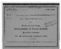
Public utilities annual report of Brooklyn Borough Gas Company, 1943 (NYSA_13345- 81_B050_F07_Brooklyn_Borough_Gas_Company_1943)