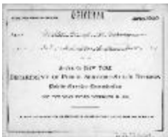
Public utilities annual report of Brooklyn Borough Gas Company, 1930 (NYSA_13345- 81_B049_F09_Brooklyn_Borough_Gas_Company_1930)