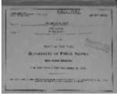
Public utilities annual report of Kings County Lighting Company, 1952 (NYSA_13345-81_B232_F11_Kings_County_Lighting_Company_1952)