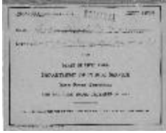
Public utilities annual report of Brooklyn Borough Gas Company, 1933 (NYSA_13345- 81_B049_F12_Brooklyn_Borough_Gas_Company_1933)