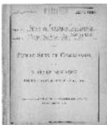
Public utilities annual report of Brooklyn Borough Gas Company, 1924 (NYSA_13345-81_B049_F03_Brooklyn_Borough_Gas_Company_1924)