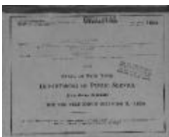
Public utilities annual report of Kings County Lighting Company, 1950 (NYSA_13345- 81_B232_F09_Kings_County_Lighting_Company_1950)