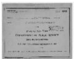
Public utilities annual report of Brooklyn Borough Gas Company, 1942 (NYSA_13345- 81_B050_F06_Brooklyn_Borough_Gas_Company_1942)