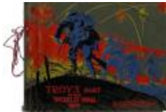
"Troy's Part in the World War 1918" (NYSA_A3167-78A_B1_F1_Troy)