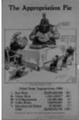
Appropriation Cartoon (NYS A3167-78A_B7_Appropriation_Pie)