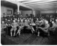
World War I soldiers stationed at Watervliet Arsenal, YMCA. Sunday Afternoon Tea