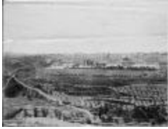
Jerusalem countryside (NYSA_A3167-78A_B2_F8_03)