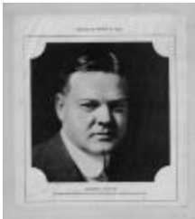
Herbert Hoover (NYSA_A3167-78A_B5_WWI_RedCrossPortraits_Hoover)