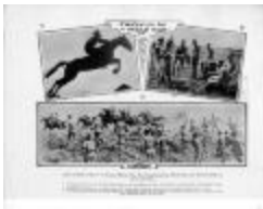
Troy Marines (NYSA_A3167-78A_B1_F1_TroyMarines)