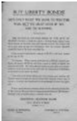
Buy Liberty Bonds (NYSA_A3167-78A_B7_WW1_Material_04)