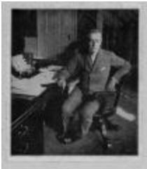
Woodrow Wilson (NYSA_A3167-78A_B5_WWI_RedCrossPortraits_Wilson)