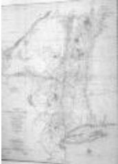
New York State. Sauthier's map. (NYSA_A3167-78A_B7_Sauthier)