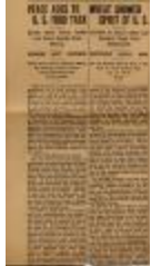
Food Rationing 7 (NYSA_A3167-78A_B7_WW1_Material_09_p7)