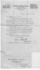
War Relief Letter (NYSA_A3167-78A_B7_Mrs_Ledyard_Cogswell)