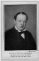
Winston Churchill (NYSA_A3167-78A_B5_WWI_RedCrossPortraits_Churchill)