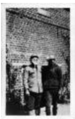
Gas Mask (NYSA_A3167-78A_B3_F9_04)