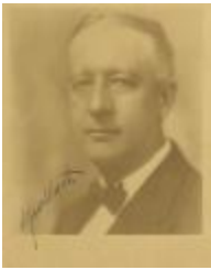
Portrait, Alfred E. Smith (NYSA_A3167-78A_B3_Alfred_E_Smith)