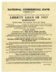
Liberty Loan of 1917 (NYSA_A3167-78A_B7_WW1_Material_05)