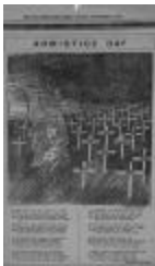
"Armistice Day" (NYSA_A3167-78A_B5_War_Memorial_02)