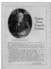
Thanks from France's Premier