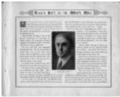
Troy's Part in the World War (NYSA_A3167-78A_B1_F1_TroyContributions)