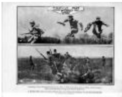
Troy Soldiers Charge (NYSA_A3167-78A_B1_F1_TroySoldiers)