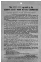
Home Card (NYSA_A3167-78A_B7_WW1_Material_01)