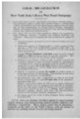
Local Organization for New York State Library War Fund Campaign (NYSA_A3167-78A_B7_WW1_Material_02)