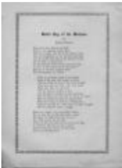
"Battle Cry of the Mothers" (NYS A3167-78A_B7_BattleCryoftheMothers)