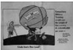
"Uncle Sam's New Load?" (NYS A3167-78A_B7_Compulsory_Service_Cartoon)