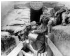
World War I - Salvation Army (NYSA_A3167-78A_B2_SalvationArmy)