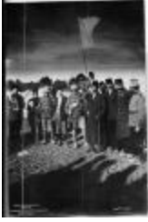
East Jerusalem (NYSA_A3167-78A_B2_F8_01)