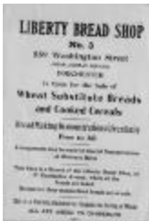
Liberty Bread Shop (NYSA_A3167-78A_B6_Reports_Patriotic_Soc_Liberty_Bread_Shop)