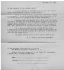
Anti-Militarism (NYS A3167-78A_B7_AUAM_Letter)