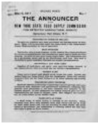
Food Supply Poster (NYSA_A3167-78A_B5_WWICommittee_PatriotismThroughEducation)