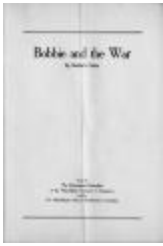
"Bobbie and the War" (NYSA_A3167-78A_B5_Bobbie)