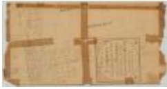
Map of land given to the Canadian and Nova Scotia Refugee's. Clinton county. Map #826A (NYS A0273-78_826A)