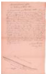
Survey of lands under water for Jacobus Moll (NYSA_B2321- 11_18091106_Moll)