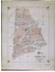
Map of Township No. 8, John Brown's Tract