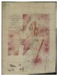
A Map exhibiting the relative position of the Veins of Iron Ore in and adjoining the Village of McIntyre, Essex County, New York, belonging to the Adirondack Iron and Steel Co. (NYSA_B1405-96_311)