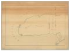
Bluff Point, in Raquette Lake, Hamilton County. Map #500 (NYSA_A0273-78_500)