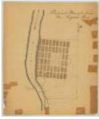
Proposed Town on Niagara river. Map #791 (NYSA_A0273-78_791)