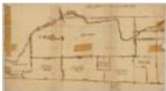
Coxe's Patent, also Hamden Tract, on Susquehanna river. Map #820 (NYSA_A0273-78_820)