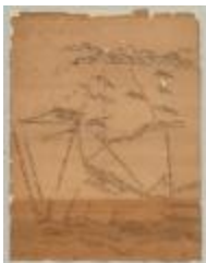
Map of the Town of Kinderhook. Map #411 (NYSA_A0273-78_411)