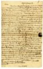
Statement of discovery of forfeited lands in Bedlington, 1809 (NYS A4016-77_V9_F70g)