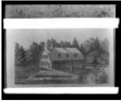
NYS hatching house at Caledonia (copy of print) (NYSA_14297-87_1690)