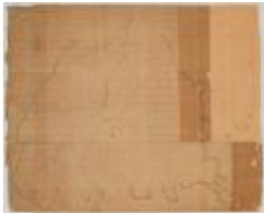
Map of Westchester. Map #400 (NYSA_A0273-78_400)