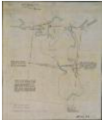
Map of Lot No. 220, T[ownship] No. 10, O.M.T. [Old Military Tract] Showing Property Adjoining [and Southern Portion of Loon Lake] (NYS B1405-96_2)