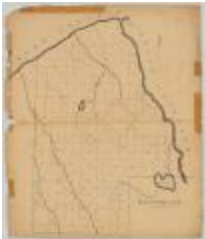
Hannibal, No. 2, Oswego county. Map #832 (NYS A0273-78_832)