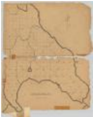
Lysander, No. 1, Oswego and Onondaga counties. Map #831 (NYS A0273-78_831)