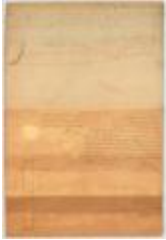
Map of Lot No. 2 in Sadaquada Patent and Lot No. 13 in Sacondaga Patent. Map #297 (NYSA_A0273-78_297)