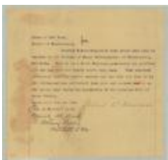
Document with Profile of the Walkkill river at Walden, Orange County. Map #472C (NYSA_A0273-78_472C)