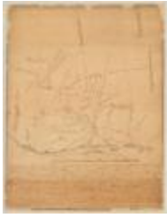
Map of the Town of Coxsackie, Green County. Map #420 (NYSA_A0273-78_420)