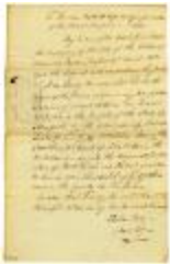
Statement describing land forfeited in Rensselaer County, 1809 (NYSA_A4016-77_V9_F30)