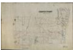
Map of Crown Point (NYS B1405-96_170)