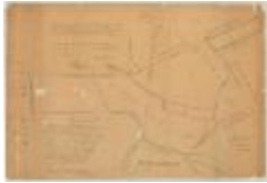
Map of several pieces of land situated in the Town of Bushwick, Kings County. Map #464 (NYSA_A0273-78_464)