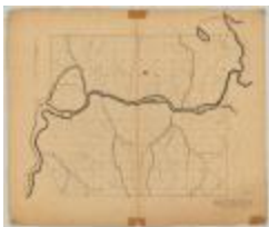
Brutus, No. 4, Cayuga county. Map #834 (NYS A0273-78_834)