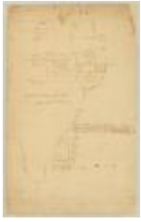
Survey of land for Alex Turner, 25,000 acres, on the Batten kill, and various others adjoining. Map #717 (NYSA_A0273-78_717)