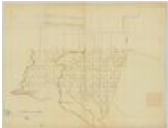
Map of subdivison of Fonda's Patent, Oneida county. Map #723 (NYSA_A0273-78_723)