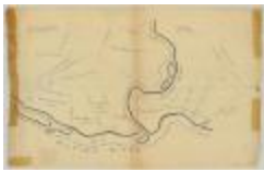
Lands and various grants at Fort Hunter, Montgomery county. Map #829 (NYS A0273-78_829)