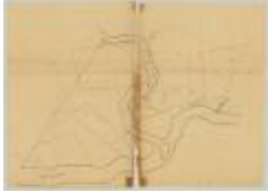
Maps of Corporation Lands at Fort Hunter, Montgomery county. Map #828 (NYS A0273-78_828)