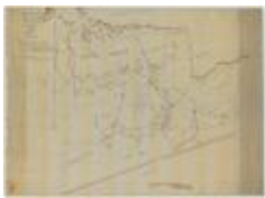
Map of the Town of Brookhaven in the County of Suffolk. Map #352B (NYSA_A0273-78_352B)