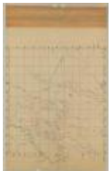
Totten and Crossfield's Purchase, Township 40 showing Raquette Lake. Map #503A (NYSA_A0273-78_503A)