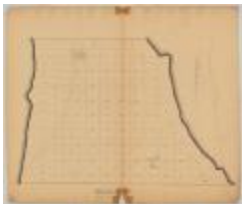
Ovid, No. 16, Seneca county. Map #846 (NYSA_A0273-78_846)