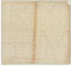
Lands near Schroon Lake; Platt's Road Patent; Hoffman, etc. Map #793 (NYSA_A0273-78_793)