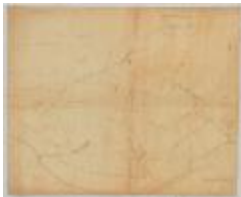
Map of Stone Arabia Patent, Alexander's Patent, Depeyster's and Van Slyck's patent. Map #879 (NYSA_A0273-78_879)