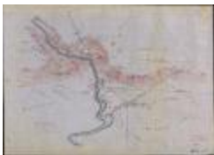
Survey of Hudson River, Sheet 1 (NYS B1405-96_62)