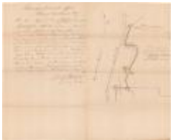
Survey of lands under water for Jeffrey Champlain (NYSA_B2321- 11_18090517_Champlain)