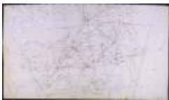
Central Adirondack Triangulation Network Diagram with Primary Triangulation Station Names (NYS B1405-96_46)