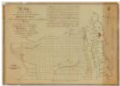
Map of the Gore and the several pieces of land in the division of Pittstown. Map #45 (NYSA_A0273-78_45)