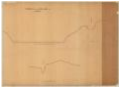
Profile of the Walkkill river at Walden, Orange County. Map #472A (NYSA_A0273-78_472A)