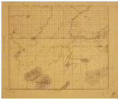
Map of Township No. 12, Old Military Tract and Town of North Elba (NYS B1405-96_11)