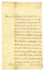
Deposition by Robert Watts, 1809 (NYSA_A4016-77_V9_F70a)