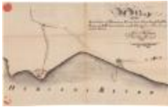
Survey of lands under water for William Schepmoes (NYSA_B2321- 11_18090320_Schepmoes)