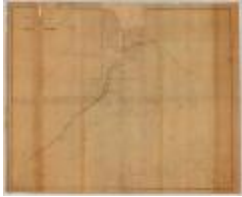
Map of the Township of West Chester. Map #424 (NYSA_A0273-78_424)