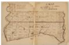
Map of Lott's Patent, also of Magin's Patent. Map #803 (NYSA_A0273-78_803)