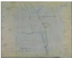
Topographical map of the Salmon River, Clinton County, N.Y. (NYS B1405-96_18)