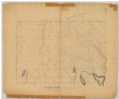
Cato, No. 3, Cayuga county. Map #833 (NYS A0273-78_833)