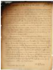
Letter from Thomas Jefferson to the NYS Legislature (NYSA_A1818-78_Jefferson)