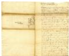
Statement of discovery of forfeited lands in Bedlington, 1809 (NYSA_A4016-77_V9_F70b)