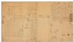
Map of New Stockbridge, Oneida county, and subdivisions. Map #801 (NYSA_A0273-78_801)