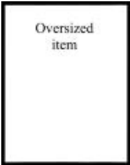
Map of Township of Lake Pleasant, Hamilton County. Map #587 (NYSA_A0273-78_587)