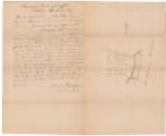
Survey of lands under water for Asa Bigelow & Samuel Isham (NYSA_B2321-11_18090315_Bigelow-Isham)