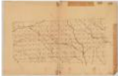
Old Military Tract, Township 6, Clinton county and Township 7, Franklin county. Map #798 (NYSA_A0273-78_798)