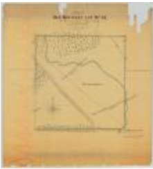
Sempronius, Lot No. 61. Cayuga County. Map #521 (NYSA_A0273-78_521)