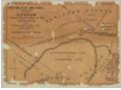
Corner Location of Benson Township, Jerseyfield Patent and Lawrence Patent. Map #512 (NYSA_A0273-78_512)