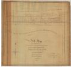
Map of the different lines run for the third tract of the Vanbergen Patent. Map #213 (NYSA_A0273-78_213)