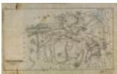
Map of Ticonderoga (NYS B1405-96_157)