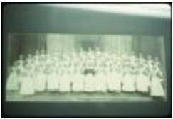
Utica Psychiatric Hospital (NYSA_B1560-97_B08_08)