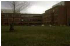
Utica Psychiatric Hospital (NYSA_B1560-97_B08_F)