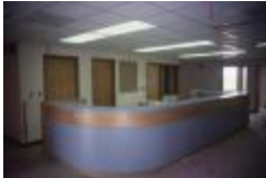
Utica Psychiatric Hospital (NYSA_B1560-97_B08_H)