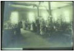
Utica Psychiatric Hospital (NYSA_B1560-97_B08_11)