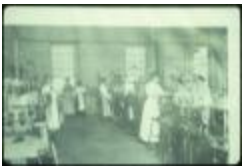
Utica Psychiatric Hospital (NYSA_B1560-97_B08_10)