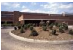
Utica Psychiatric Hospital (NYSA_B1560-97_B08_E)