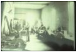
Utica Psychiatric Hospital (NYSA_B1560-97_B08_13)