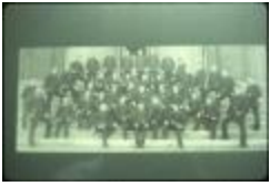
Utica Psychiatric Hospital (NYSA_B1560-97_B08_12)