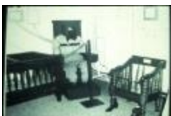
Utica Psychiatric Hospital (NYSA_B1560-97_B08_27)