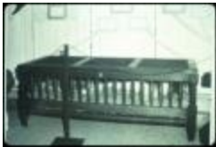
Utica Psychiatric Hospital (NYSA_B1560-97_B08_33)