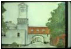
Utica Psychiatric Hospital (NYSA_B1560-97_B08_35)