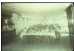
Utica Psychiatric Hospital (NYS B1560-97 B08_21)