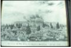
Utica Psychiatric Hospital (NYSA_B1560-97_B08_05)