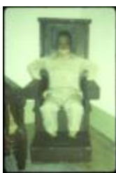
Utica Psychiatric Hospital (NYSA_B1560-97_B08_28)