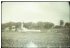
Utica Psychiatric Hospital (NYS B1560-97 B08_17)