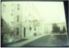
Utica Psychiatric Hospital (NYSA_B1560-97_B08_06)