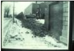
Utica Psychiatric Hospital (NYSA_B1560-97_B08_34)