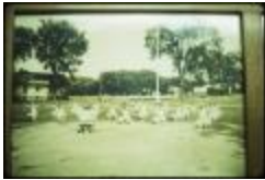
Utica Psychiatric Hospital (NYSA_B1560-97_B08_23)