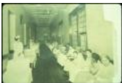
Utica Psychiatric Hospital (NYSA_B1560-97_B08_26)