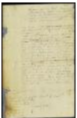
Commission for militia officers for Newcastle, Cranehook, Verdriete kook, Upland, Passayunck, Apoquemini and Whorekill, in Delaware (NYS A1879-78_V20_0053)