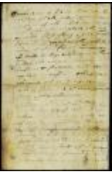
Order in regard to grist mills and recording of patents and deeds (NYS A1879-78_V20_0050b)