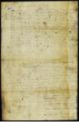
Commission of Edmund Cantwell to be surveyor in Delaware (NYS A1879-78_V20_0050a)