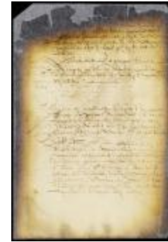
Petition of Peter Terragon and five or six Frenchmen (of Bushwick) for leave to reside on their farms (NYSA_A1809-78_V09_0562)