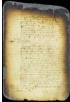
Letter from director Stuyvesant to the magistrates of Jamaica (NYSA_A1809-78_V09_0486b)