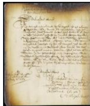
Letter from director Stuyvesant to gov. Endecott (NYSA_A1809-78_V09_0631)