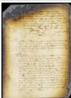
Sentence of Gerrit Pelser (NYSA_A1809-78_V09_0780)