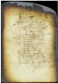
Nomination of burgomasters and schepens of New Amsterdam for the ensuing year (NYSA_A1809-78_V09_0518)