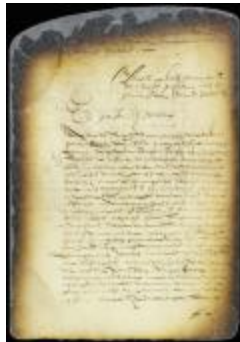
Petition of the schout, burgomasters and schepens of New Amsterdam for an enlargement of the burgher right