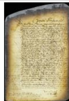
Sentence of Henry Townsend (NYS_A1809-78_V09_0505)