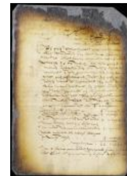
Petition of magistrates of Bushwyck for the grant of certain salt meadows (NYSA_A1809-78_V09_0635)