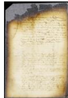
Suit of Frans Jansen against Govert Loockermans about a lot of land at Flattlands (NYSA_A1809-78_V09_0740)