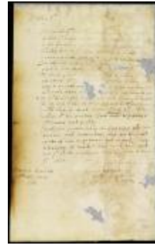
Letter from col. Francis Moryson to director Stuyvesant (NYSA_A1810-78_V14_0019)