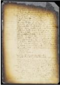
Letters patent establishing independent courts of justice at Midwout and Amersfoort, L. I. (NYSA_A1809-78_V09_0573)