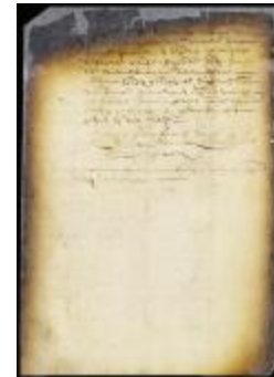
Appointment of magistrates for Fort Orange (NYSA_A1809-78_V09_0580)