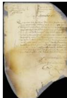
Extract from the minutes of the court at New Amstel (NYSA_A1878-78_V19_0017)