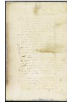
Proposals made by the Mohawk chiefs at Fort Orange and the answer thereto (NYSA_A1810-78_V14_0008)