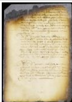
Suit to recover a year's wages for a son of Hugh Barent Cleyn who had been bound to a farmer named Langestraet (NYSA_A1809-