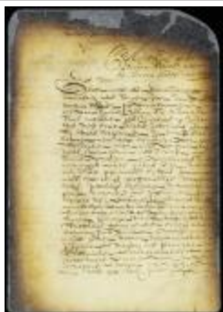
Petition of several residents of Rustdorp to be relieved of soldiers quartered on them because they will not inform against