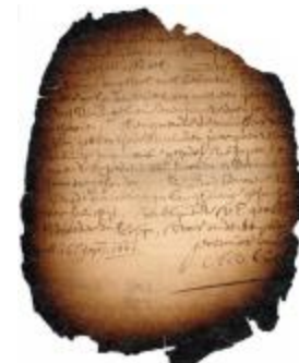
Letter of Arent van Curler to [Petrus Stuyvesant] (NYSL_sc7079-b04-f22_p6_ncn)