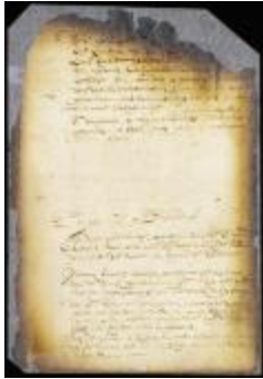
Sundry suits brought by the farmer of the excise (NYSA_A1809-78_V09_0723b)