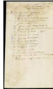
Payments made on account of various persons in New Netherland (NYSA_A1810- 78_V14_0007)