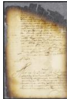
Ordinance for the more speedy collection of the arrears due for the house and salary of the minister at the Esopus (NYSA_A1809-