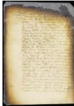
Petition of Thomas Wandel for a grant of a salt meadow at Mespeth Kill (NYSA_A1809-78_V09_0575)