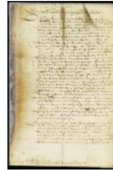
Letter from the directors to Stuyvesant (NYSA_A1810-78_V14_0020)