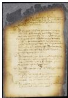
Conditions of sale of a lot of slaves in New Amsterdam (NYSA_A1809-78_V09_0882)