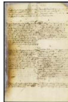
Proposals of the commissioners at the Delaware and resolutions of the chamber at Amsterdam (NYSA_A1810-78_V14_0037a)