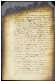
Appointment of magistrates for Wiltwyck and their oath; minister's house ordered built (NYSA_A1809-78_V09_0598)