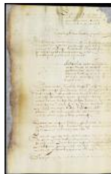
Articles and conditions granted to Dirck Wolff & Co., empowering them to erect salt pans in New Netherland (NYSA_A1810-