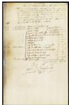
Invoice of goods sent to New Netherland in the ship The Church of Purmerland (NYSA_A1810-78_V14_0037b)