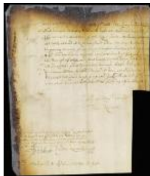
Royal order to the governor of Massachusetts for the arrest of colonels Whalley and Goffe (NYSA_A1809-