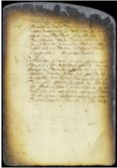
Order for keeping account of the quantity of flour delivered to the public baker and of the return of bread (NYSA_A1809-