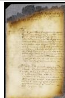
Petition of Bartholomew van Schel, mason, for an increase of wages (NYSA_A1809-78_V09_0778)