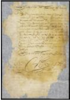
Letter from the director and council to ----- in answer to a remonstrance from Beverwyck (Albany) (NYSA_A1810- 78_V14_0030)