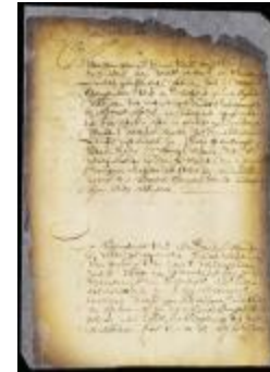
Order that no person be assessed for the city rattle watch except such as are subject to serve in the burgher watch