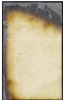
Propositions of a company in New England presented to the director-general with Dutch translation (NYSA_A1809-78_V09_0899)