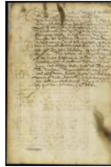
Patent of Jan van Aecken for a lot at Beverwyck (Albany) (NYSA_A1880-78_VHHpt2_0119)