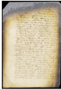
Approval of ordinance forbidding trade in the woods with Indians (NYSA_A1809-78_V09_0593)