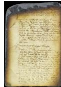
Order on a petition from Gemoenepa for the palisading of that village (NYSA_A1809-78_V09_0521)