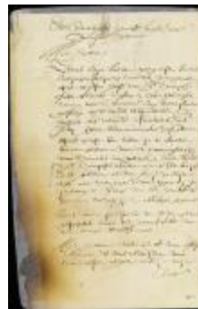
Letter from William Beeckman to director Stuyvesant