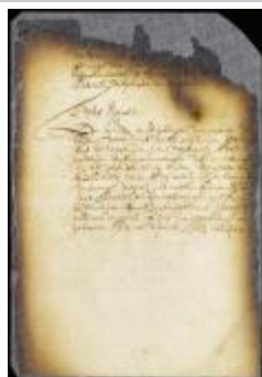
Order for the better entering of goods (NYSA_A1809-78_V09_0669)