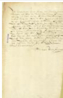
BOND of Dirck Jansen van Oldenborgh securing payment of 150 pieces of eight to Petrus Stuyvesant (NYSA_A1883-