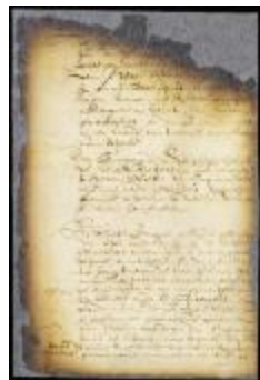
Judgment confiscating furs shipped by Jeronimus Ebbing without being entered (NYSA_A1809-78_V09_0853)