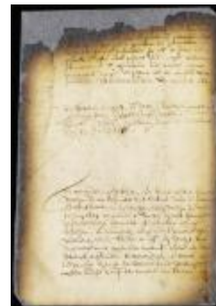
Oath of office taken by Roelof Swartwout (NYSA_A1809-78_V09_0622a)