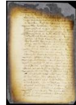
Petition of the magistrates of Breuckelen for a grant to that town of certain valleys (NYSA_A1809-78_V09_0647)