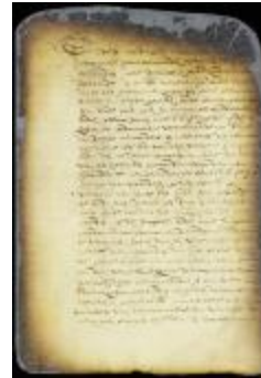
Petition of inhabitants of the Waelebocht (Brooklyn) for leave to erect a block house (NYSA_A1809-78_V09_0547)