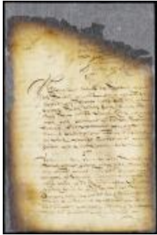
Ordinance for the better observance of the Sabbath, etc., at Esopus (NYSA_A1809-78_V09_0887)