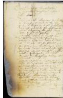
Letter from William Beeckman to director Stuyvesant (NYSA_A1878-78_V19_0007)