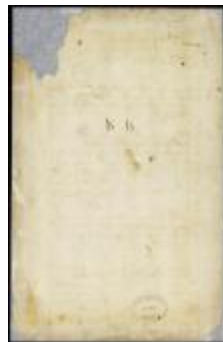
List of emigrants from Holland to New Netherland from 1654 to 1664, with their accounts, debit and credit (NYSA_A1810-