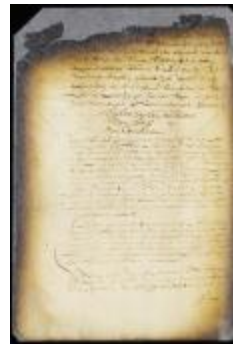
Letters patent establishing a court of justice at Bushwick (NYSA_A1809-78_V09_0570)