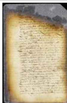
Proposals to fortify the city of New Amsterdam and to strengthen the fort, submitted to the council by the director-