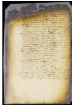
Commission of Dirck Looten to be commissary of provisions (NYSA_A1809-78_V09_0564)