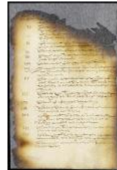
Registers of the minutes of council for 1661 (NYSA_A1809-78_V09_0951)