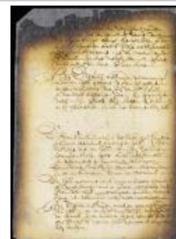
Order to fiscal and his deputy to be acknowledged and respected in their respective offices by the city tavernkeepers