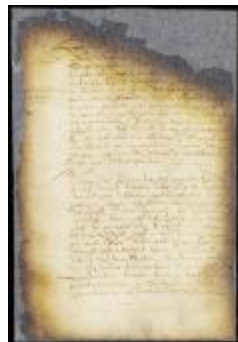
Answer of the director and council to proposals from a company in New England, with translation in English (NYSA_A1809-