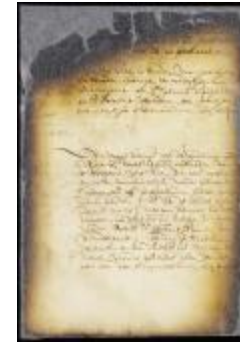
Order for the proper execution of personal arrests (NYSA_A1809-78_V09_0868)