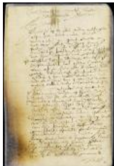
Letter from William Beeckman to director Stuyvesant (NYSA_A1878-78_V19_0014)