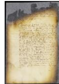
Order allowing Nicholas Verlett compensation for supplies used on board the revenue cutter (NYSA_A1809-78_V09_0860)