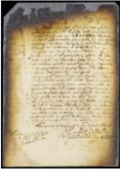
Letter from director and council of New Netherland to Alexander d'Hinoyossa (NYSA_A1809-78_V09_0654)