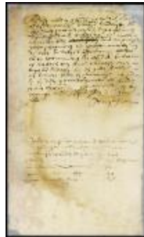
Ordinance for palisading the village of Wiltwyck and names of persons who supplied wheat (NYSA_A1810-