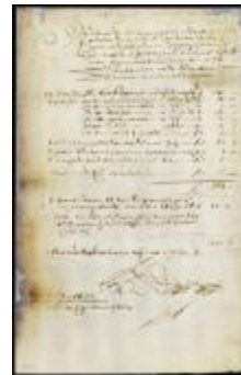
Invoice of munitions of war sent to New Netherland and bill of lading (NYSA_A1810-78_V14_0001)