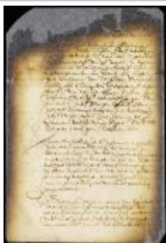
Petition of Dirck Looten for an increase of pay (NYSA_A1809-78_V09_0668)