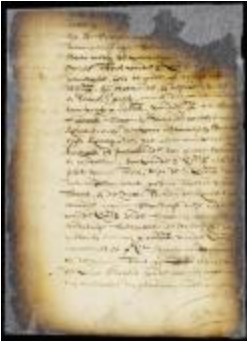
Ordinance prohibiting offsetting of goods delivered to persons in public employment against the payment of duties