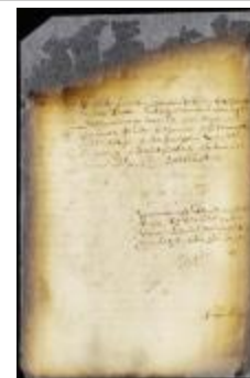
Advice of councillor de Sille on proposals of the director-general (NYSA_A1809-78_V09_0794)