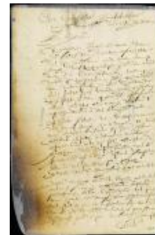
Letter from William Beeckman to director Stuyvesant (NYSA_A1878-78_V19_0013)