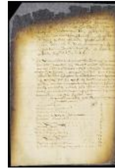
Allotment and distribution of lots in the Esopus (NYSA_A1809-78_V09_0596)