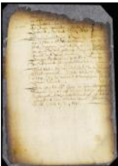
List of papers relating to Staten Island delivered up by Cornelis Melyn (NYSA_A1809-78_V09_0625)