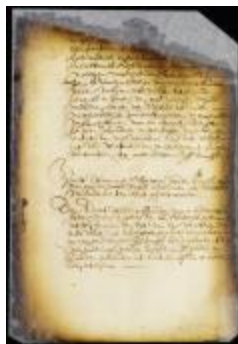
Order banishing sundry lewd women from the province (NYSA_A1809-78_V09_0681)