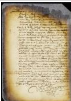
Proceedings against Cornelis Melyn for smuggling (NYSA_A1809-78_V09_0775)