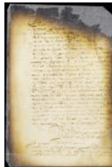
Petition of Gysbert op Dyck for leave to sell Gysberts island to the town of Gravesend (NYSA_A1809-78_V09_0739)