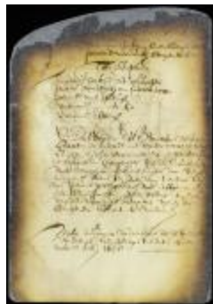
Appointment of the burgomasters and schepens of New Amsterdam for the ensuing year (NYSA_A1809-78_V09_0519)