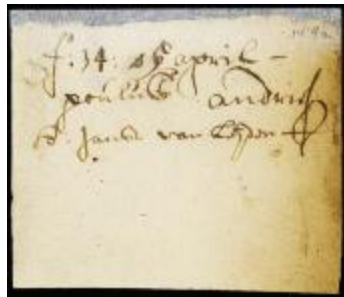
Letter from the directors to Stuyvesant (NYSA_A1810-78_V14_0009)