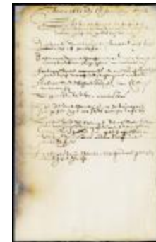
List of letters and papers sent to New Netherland in the ship Golden Arent (NYSA_A1810-78_V14_0002)