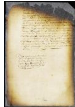
Judgment confiscating goods from Storm Albertsen (NYSA_A1809-78_V09_0713)