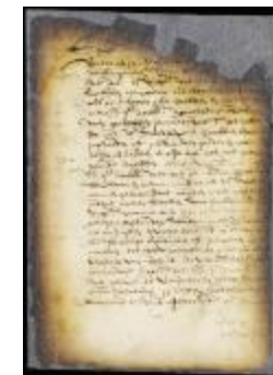
Petition of the burgomasters of New Amsterdam that ships owned in the province bring cargoes of stone in lieu of paying