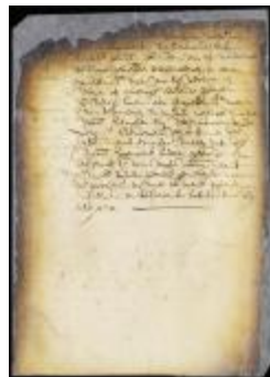
Resolution to grant Andries Herperts a small island in Hudson's river (NYSA_A1809-78_V09_0552)