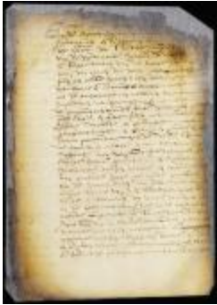
Instruction for the court of justice at Wiltwyck (NYSA_A1809-78_V09_0607)