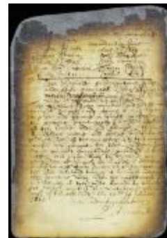
Order to Francis Doughty to deliver up the minister's house to the schoolmaster (NYSA_A1809-78_V09_0499)