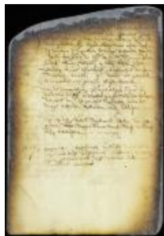
Order on an application of the magistrates of Rustdorp (Jamaica) to be relieved of the soldiers quartered there (NYSA_A1809-