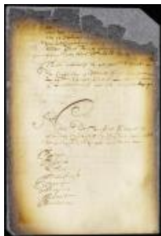
Notice to the inhabitants of Harlem, Bergen, Breukelen and the Dutch villages on Long Island to have their lands surveyed and to