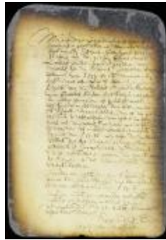
Petition of Warnae Wessels to be credited with certain items (NYSA_A1809-78_V09_0545)