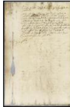
Report of the state of feeling among the Cattskill and Esopus Indians (NYSA_A1810- 78_V14_0031)