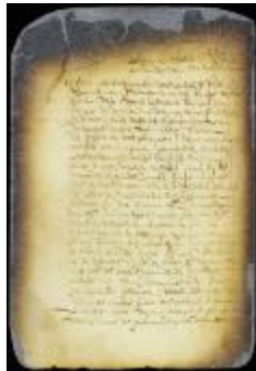
Petition of the town of Midwout (Flatbush) for a grant of a valley adjoining their village (NYSA_A1809-78_V09_0489)