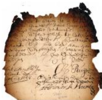
Letter from Cornelis van Ruyven to Jeremias van Rensselaer (NYSL_sc7079-b02-f49_ncn)