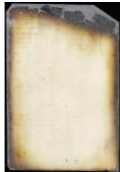
Bond of Coenraet Ten Eyck to prove that the duties have been paid in Holland (NYSA_A1809-78_V09_0720)