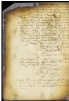
Proceedings of the fiscal for confiscation of smuggled goods (NYSA_A1809-78_V09_0604)