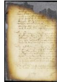
Proceedings against and confiscation of furs shipped by mistake (NYSA_A1809-78_V09_0849)