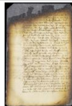
Petition of magistrates of Breuckelen for aid to pay their court messenger, who acts also as chorister, schoolmaster, sexton and bell