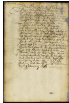
Patent of Roelof Martensen for land on Long Island (NYSA_A1880-78_VHHpt2_0118)