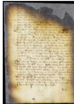
Papers in support of payment of Thomas Willett's claim (NYSA_A1809-78_V09_0939)