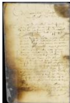
Letter from William Beeckman to director Stuyvesant (NYSA_A1878-78_V19_0001)