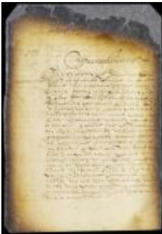
Notice to proprietors of lots in Wiltwyck to have them surveyed before taking out patents (NYSA_A1809-78_V09_0597)