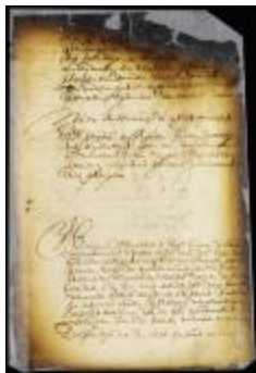
Order obliging Cornelis de Potter's widow to deliver two stones to William Wilkins (NYSA_A1809-78_V09_0679)