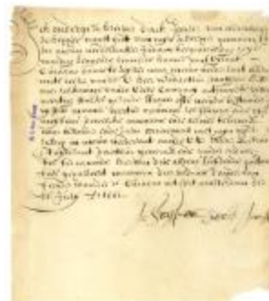
BILL OF LADING for forty enslaved individuals loaded at Curaçao for New Netherland (NYSA_A1883-78_V17_073)