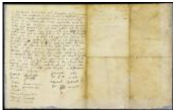
Petition of the inhabitants of Newtown (NYSA_A1810-78_V14_0025)