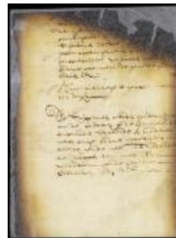
Order to sell property in Bushwick belonging to two runaway Frenchmen (NYSA_A1809-78_V09_0871)