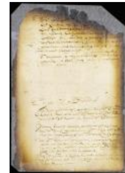
Proceedings against Fytje Gommers for robbing Indians (NYSA_A1809-78_V09_0723a)