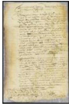
Letter from the director and council to the vice-director at Curaçao (NYSA_A1810-78_V14_0018)