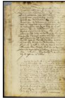
Patent of Elbert Elbertsen for land on Long Island (NYSA_A1880-78_VHHpt2_0127b)