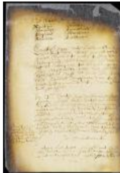
Proposals of some Mohawk chiefs on their return from the South river (NYSA_A1809-78_V09_0579)