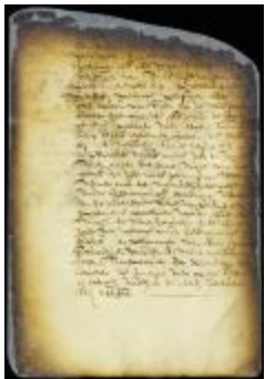
Order to several people to remove from their farms to the village on the river opposite the Manhatans (Brooklyn) (NYSA_A1809-