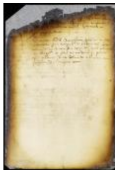
Order taxing a bill of costs (NYSA_A1809-78_V09_0682)