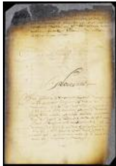
Ordinance establishing the fees to be paid at the public weigh scales (NYSA_A1809-78_V09_0582)