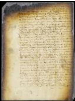
Commission of Abraham van Nas to be notary public (NYSA_A1809-78_V09_0602)