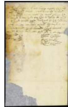
Letter from the magistrates to director Stuyvesant (NYSA_A1810-78_V14_0023)