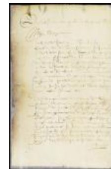
Letter from vice-director La Montagne to Stuyvesant (NYSA_A1810-78_V14_0016)