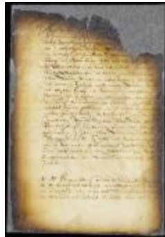
Ordinance making provision for the poor in the several towns of the province (NYSA_A1809-78_V09_0863)