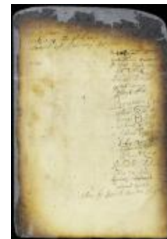
Pledge signed by the magistrates and part of the inhabitants of Rustdorp to denounce Quakers and their meetings (NYSA_A1809-