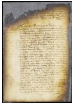
Ordinance for the construction of a new road at the Esopus (NYSA_A1809-78_V09_0892)