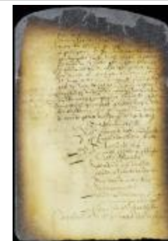
Nominations for churchwarden, orphan master, and firewarden of the city of New Amsterdam (NYSA_A1809-78_V09_0543)