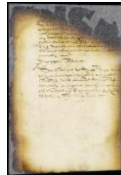
Petition of inhabitants of Bergen for additional land (NYSA_A1809-78_V09_0923)