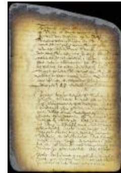
Petition of shipwrecked seamen for their wages (NYSA_A1809-78_V09_0494)