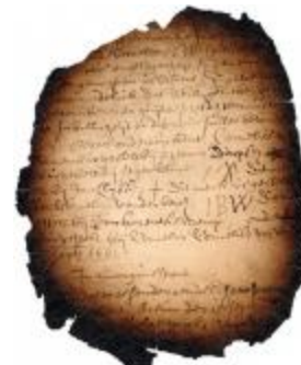
Letter of Arent van Curler to [Petrus Stuyvesant] (NYSL_sc7079-b04-f22_p5_ncn)