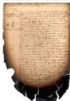
Letter of Jeremias van Rensselaer to Oloff Stevensen van Cortlandt (NYSL_sc7079-b04-f43_p1_ncn)