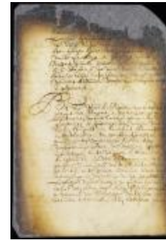
Order to survey a valley at Canarisse, L. I., and others in dispute between Midwout and Amesfoort (NYSA_A1809-78_V09_0667)