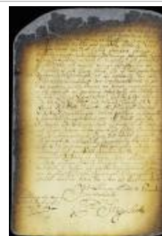
Letter from director Stuyvesant to the town of Jamaica, L. I. (NYS_A1809-78_V09_0513)