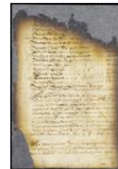
Ordinance imposing an excise duty for one year at Esopus (NYSA_A1809-78_V09_0885)