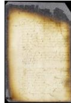
Petition of several recently arrived immigrants for land on Staten Island (NYSA_A1809-78_V09_0735)