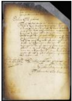
Order to magistrates of Bushwick not to dispose of the salt meadow claimed by Thomas Wandel until further authorized