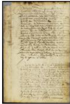
Patent of Jacob Kip for a lot in New Amsterdam (NYSA_A1880-78_VHHpt2_0127a)