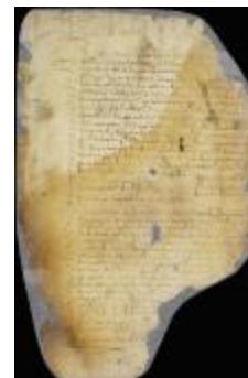
Order of the court of New Amstel to the curators of the estate of Elmerhuysen Kleyn (NYSA_A1878-78_V19_0019b)