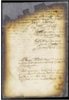
Order empowering burgomasters to agree with the captains of ships either to bring stone or pay wharfage to New Amsterdam