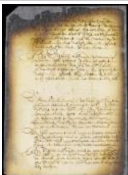
Order fining Hendrick Assueros for having sold liquor to sundry persons and permitted them to play at ninepins during divine