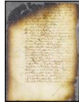
Ordinance erecting a court of justice at New Utrecht (NYSA_A1809-78_V09_0930)