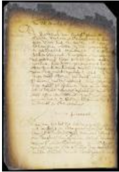
Ordinance of director and council of Rensselaerswyck forbidding trade in the woods with Indians (NYSA_A1809-78_V09_0593)