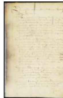
Letter from the vice-director and magistrates to director Stuyvesant (NYSA_A1810- 78_V14_0011)