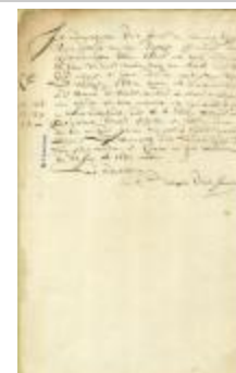
Copy of Document 72 (NYSA_A1883-78_V17_078)