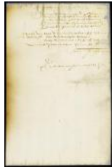
Invoice of ammunition (NYSA_A1810-78_V14_0022)