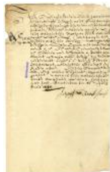
BILL OF LADING for seven cases of goods loaded at Curaçao for New Netherland (NYSA_A1883-78_V17_072)