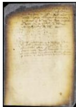
Visit of rev. Samuel Drisius to Hempstead; baptizes 41 children and one aged woman (NYSA_A1809-78_V09_0556)