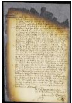
Answer of Jeronimus Ebbing to the complaint of the fiscal for an attempt to export furs without entering them