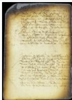
Order summoning those who neglect to repair their fences at Corlaer's Hook (NYSA_A1809-78_V09_0528a)