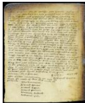
Letter from magistrates of Rustdorp to director Stuyvesant (NYSA_A1809-78_V09_0524b)