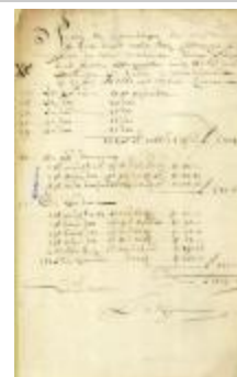
MANIFEST of cloth loaded at Curaçao for New Netherland (NYSA_A1883-78_V17_077)