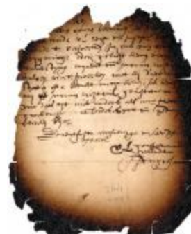
Letter from Petrus (Peter) Stuyvesant to Jeremias van Rensselaer (NYSL_sc7079-b02-f50_ncn)