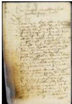
Letter from William Beeckman to director Stuyvesant (NYSA_A1878-78_V19_0009)