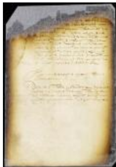
Suit of the curators of the estate of Cornelis Herperts Jaeger to recover a pipe of brandy from the custom house (NYSA_A1809-