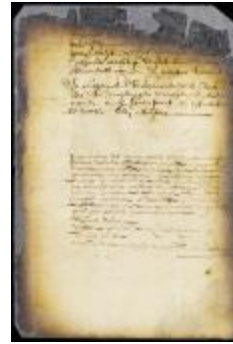
Appointment of magistrates for Breuckelen (NYSA_A1809-78_V09_0561b)