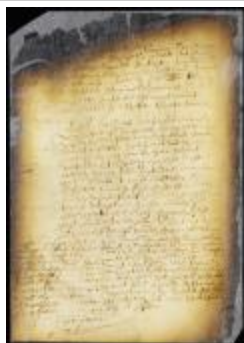
Judgment in the case of Timotheus Gabry vs. Cornelis van Gezel (NYSA_A1809-78_V09_0818)