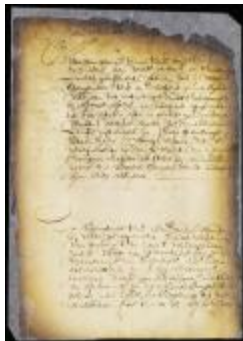
Order of burgomasters of New Amsterdam to render an annual account of the city's receipts and income (NYSA_A1809-