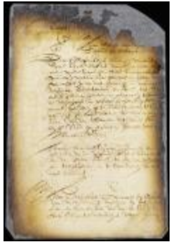
Ordinance against false entries at the custom house (NYSA_A1809-78_V09_0661b)