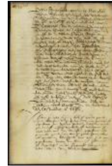
Patent of Jan Tomassen for 2 lots at Beverwyck (Albany) (NYSA_A1880-78_VHHpt2_0120)