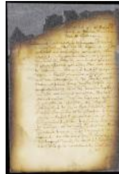
Petition of Walewyn van der Veen for admission as notary public (NYSA_A1809-78_V09_0866)