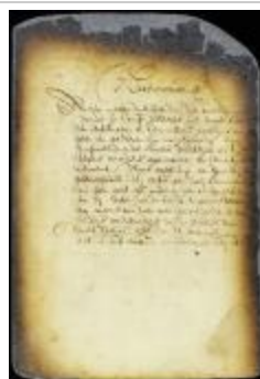
Notice to public officers not to trouble the receiver-general for money unless they have just claims (NYS_A1809-