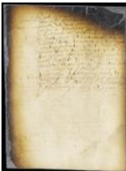
Order authorizing burgomasters of New Amsterdam to adopt measures to prevent monopolies of Indian corn, fish and venison