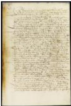
Form of clearance or permit for a ship going to New Netherland (NYSA_A1810-78_V14_0048)