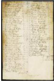
Account of the excise and list of those who paid it in Wiltwyck (NYSA_A1810-78_V14_0041a)