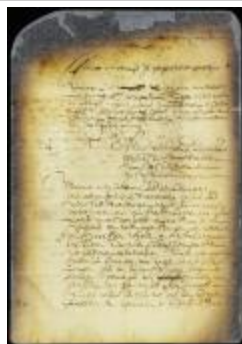
Petition of the miller to use the water of the Kolck to drive his mill (NYSA_A1809-78_V09_0538a)