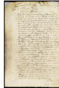
Letter from Stuyvesant to the directors at Amsterdam (NYSA_A1810-78_V14_0032)