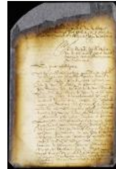
Petition of burgomasters, etc. of New Amsterdam for a modification of the tax on chimneys (NYSA_A1809-78_V09_0688)