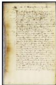
Letter from the directors to Stuyvesant (NYSA_A1810-78_V14_0014)