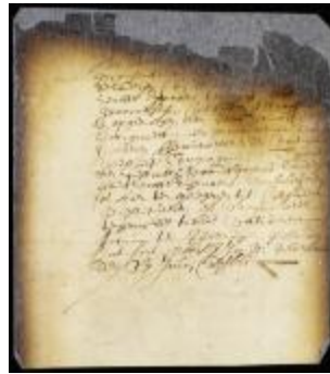
Minute granting permission to Arent van Curler purchase the flatt behind Fort Orange (NYSA_A1809-78_V09_0665)