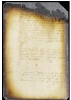
Seizure of furs on board one Humphreys' sloop, near Tallman's island (NYSA_A1809-78_V09_0695b)