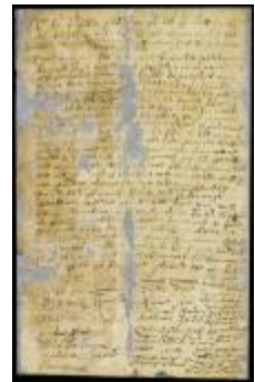
Petition of the inhabitants of Flushing for the release of their sheriff, William Hallet (NYSA_A1810-78_V14_0026)