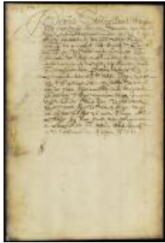
Patent of Adriaen van Laer for a lot in New Amsterdam (NYSA_A1880-78_VHHpt2_0126)