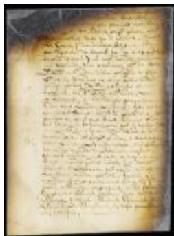
Order empowering burgomasters of the city of New Amsterdam to make regulations for the assize of bread (NYSA_A1809-