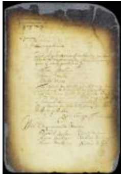
Appointment of magistrates for Oostdorp (Westchester) (NYSA_A1809-78_V09_0488)