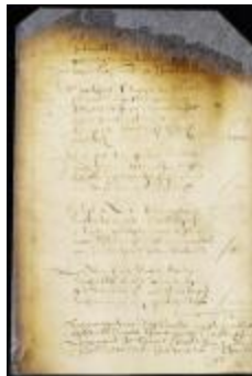
Specification of Cornelis van Gezel's mortgaged property (NYSA_A1809-78_V09_0699a)