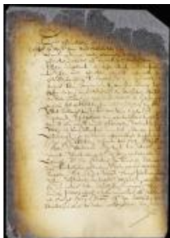
Answer of councillor de Decker to proposals of the director-general (NYSA_A1809-78_V09_0795)