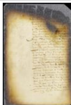
Petition of deacons of the church at New Amsterdam that each village make collections for their poor (NYSA_A1809-