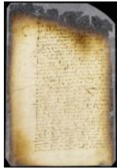
Letter from Arent van Curler to director Stuyvesant (NYSA_A1809-78_V09_0663)