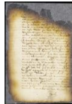
Petition of the burgomasters of New Amsterdam for a gift of slaves for the city (NYSA_A1809-78_V09_0915)