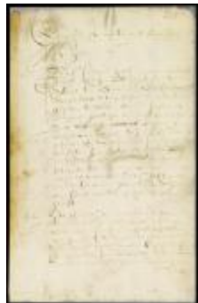
Letter from vice-director La Montagne to director Stuyvesant (NYSA_A1810- 78_V14_0033)