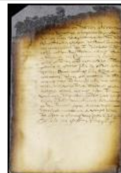
Oath to be taken by the magistrates of Bergen (N.J.) (NYSA_A1809-78_V09_0772)