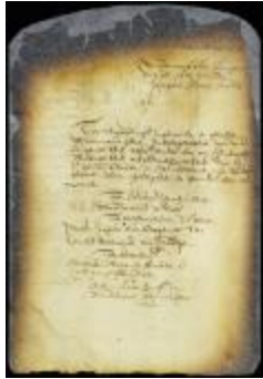
Appointments to the offices of churchwarden, orphan master, and firewarden (NYSA_A1809-78_V09_0544)