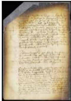
Caveat to the town of Midwout against taking any action on the survey of its valley until the town be heard (NYSA_A1809-