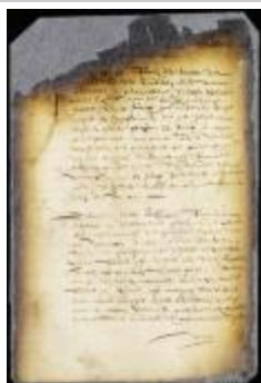
Resolution to offer at public sale on public account forty slaves recently received from Curaçao (NYSA_A1809-78_V09_0760)