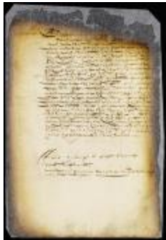
Petition of Elias Rants for an increase of pay (NYSA_A1809-78_V09_0563)