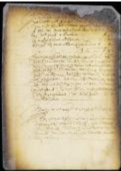
Petition of minister and elder of the church at Midwout for aid to pay off a debt (NYSA_A1809-78_V09_0577)