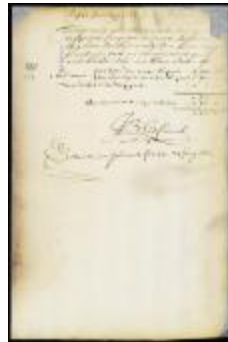
Invoices of powder, wine and sundries (NYSA_A1810-78_V14_0004)