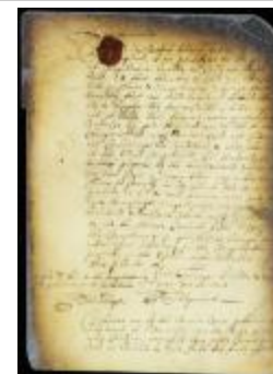
Letter from director Stuyvesant to the town of Hempstead (NYSA_A1809-78_V09_0535)