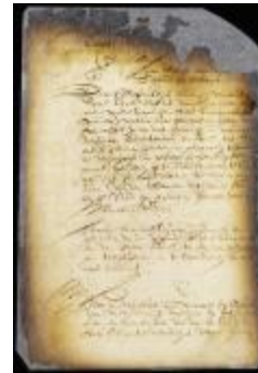
Complaint of the fiscal that the merchants make false entries of their goods (NYSA_A1809-78_V09_0661a)