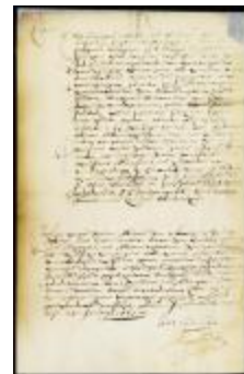
Discharge of a bond entered into in 1659 by the owners of the ship Gilded Mill (NYSA_A1810-78_V14_0010)