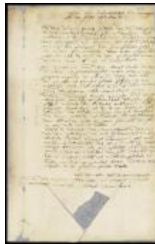
Letter from Roelof Swartwout (NYSA_A1810-78_V14_0027)