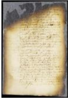
Minute confirming the farming of the revenue on slaughtered animals (NYSA_A1809-78_V09_0924)