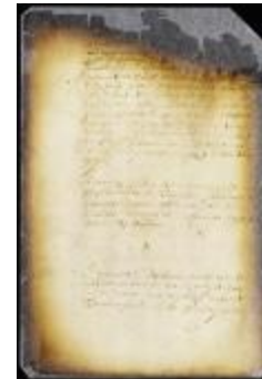
Petition of Nicholas Verlett, collector of export duties for aid in defraying the expense of a revenue cutter (NYSA_A1809-