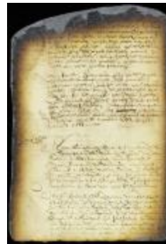
Order that persons absent from the city, and not keeping fire and light during four months forfeit privilege of freemen (NYSA_A1809-