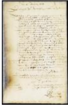
Letter from the directors to Stuyvesant (NYSA_A1810-78_V14_0003)