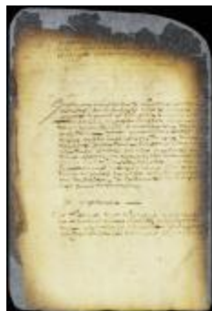
Order in a suit between Mettje Wessels and Govert Lookermans (NYSA_A1809-78_V09_0531)