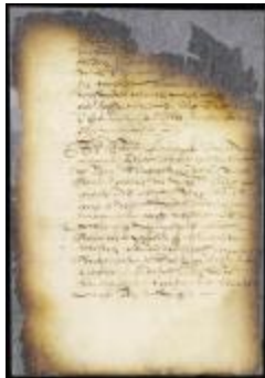
Order to burgomasters to pay the salary of the sheriff of New Amsterdam (NYSA_A1809-78_V09_0925)