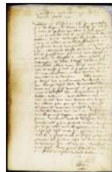
Letter from the council to the directors at Amsterdam (NYSA_A1810-78_V14_0039)