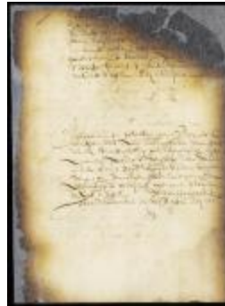
Orders for appeals (NYSA_A1809-78_V09_0929)