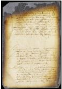
Order to survey valleys at the Red Hook, the Waalebocht, and beyond the third kill (NYSA_A1809-78_V09_0648a)