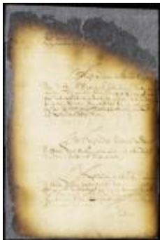
Advice and resolution of the members of the council on the petition of the burgomasters of New Amsterdam for slaves