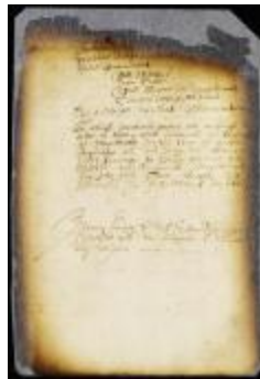
Appointment of magistrates for the town of Gravesend (NYSA_A1809-78_V09_0569)