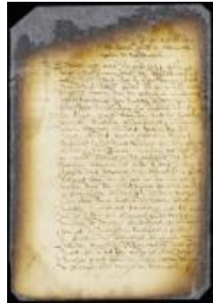
Petition of town of Amesfoort for a survey of the valleys claimed by Midwout (NYSA_A1809-78_V09_0644)