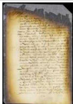
Motion of councillor de Decker that the burgomasters of New Amsterdam show cause why they assume the right to issue