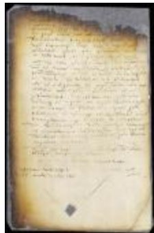
Petition of Roelof Swartwout to be appointed sheriff of Wiltwyck (NYSA_A1809-78_V09_0619)