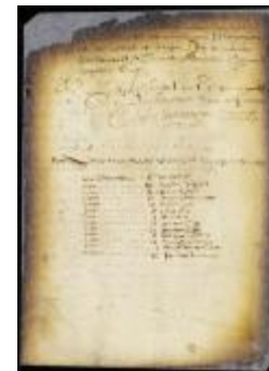
List of articles given in payment for Long Island (NYSA_A1809-78_V09_0554)