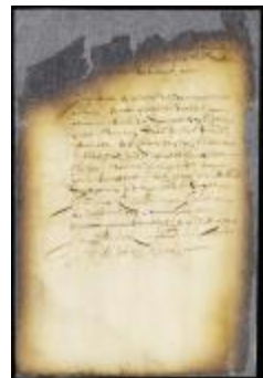
Appointment of magistrates for Harlem for the ensuing year (NYSA_A1809-78_V09_0870)