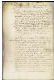
Letter from Stuyvesant to the directors at Amsterdam (NYSA_A1810-78_V14_0034)