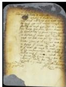
Letter from squire Hickes to director Stuyvesant (NYSA_A1809-78_V09_0533)