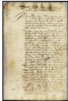
Letter from Stuyvesant to the directors at Amsterdam (NYSA_A1810-78_V14_0030)