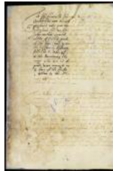
Address of the magistrates of Westchester to the director and council (NYSA_A1810-78_V14_0024)