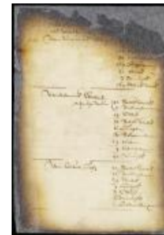
List of peltries confiscated by the government (NYSA_A1809-78_V09_0873)