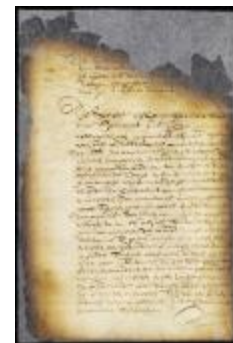
Ordinance imposing a land tax at Esopus to defray the cost of building a minister's house there (NYSA_A1809-78_V09_0883)