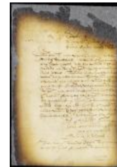
Petition of Paulus Schreck praying a deed for a house and lot on the Fresh water, Manhattan Island, sold to him by Caspar