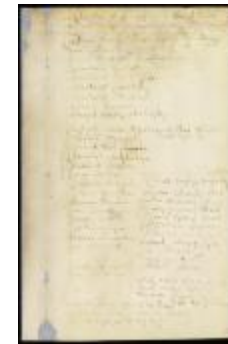
Muster roll of the garrison at the Esopus, now called Wiltwyck (NYSA_A1810-78_V14_0028)