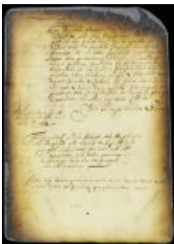
Letter from director Stuyvesant to the magistrates of Rustdorp (NYSA_A1809-78_V09_0527)