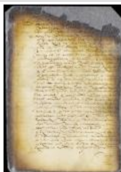
Ordinance erecting a court of justice in Bergen (N. J.) (NYSA_A1809-78_V09_0765)