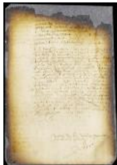
Commission of Roelof Swartwout to be sheriff of Wiltwyck (NYSA_A1809-78_V09_0621)