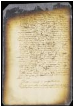
Petition of Volckert Jansen and others for a grant of Aepjes island, near Fort Orange (NYSA_A1809-78_V09_0568)