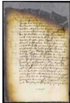
Petition of Joannes Withart for the release of a quantity of furs shipped in a mistake on board the Beaver (NYSA_A1809-78_V09_0845)