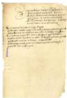
INVENTORY of papers sent from Curaçao to Petrus Stuyvesant (NYSA_A1883-78_V17_071)