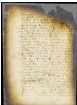
Order for the examination of the cargoes of the outward bound ships St. John Baptist and Beaver (NYSA_A1809-78_V09_0829)