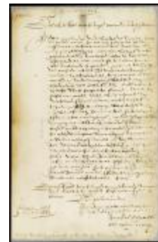
Letter from the directors to Stuyvesant (NYSA_A1810-78_V14_0036)