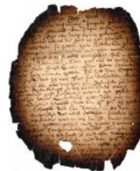
Letter from Arent van Curler to Jeremias van Rensselaer (NYSL_sc7079-b02-f43_ncn)