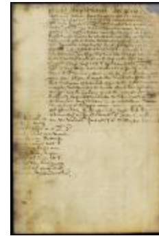
Patent of John West for land on Long Island (NYSA_A1880-78_VHHpt2_0128)