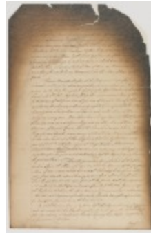
Council minutes, April 12, 1745 (NYS_A1895-78_V021_017-018)