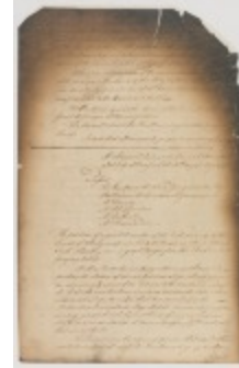
Council minutes, May 9, 1745 (NYS_A1895-78_V021_019)