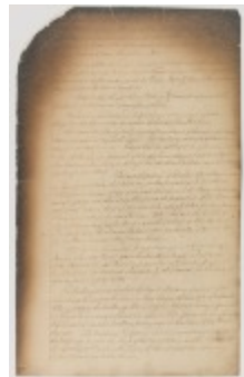
Council minutes, October 28, 1749 (NYS_A1895-78_V021_367)