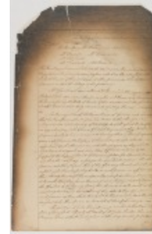
Council minutes, May 10, 1745 (NYS_A1895-78_V021_020)