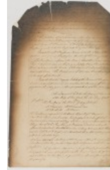
Council minutes, May 27, 1745 (NYS_A1895-78_V021_024)