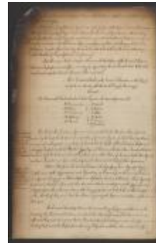
Council minutes, March 13, 1775 (NYSA_A1895-78_V026_04)