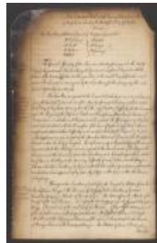
Council minutes, July 31, 1775 (NYS_A1895-78_V026_19)