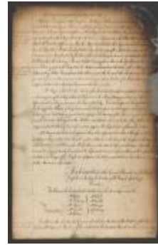
Council minutes, April 28, 1775 (NYS_A1895-78_V026_12)