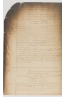
Council minutes, July 3, 1752 (NYS_A1895-78_V023_033-034-035-036)