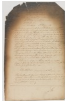
Council minutes, May 16 and May 21, 1745 (NYS_A1895-78_V021_022)