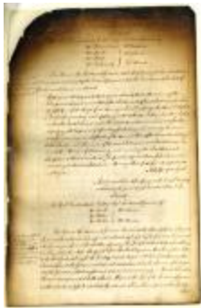
Council minutes, November 2, 1765 (NYSA_A1895-78_V026_025)