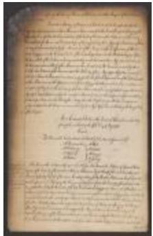
Council minutes, May 5, 1775 (NYS_A1895-78_V026_14)