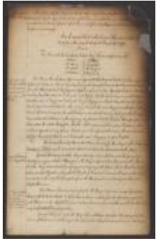
Council minutes, April 13, 1775 (NYS_A1895-78_V026_10)