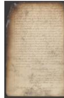
Council minutes, March 11, 1776 (NYSA_A1895-78_V026_29)