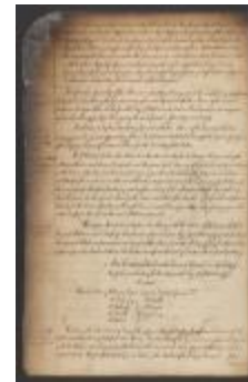
Council minutes, September 29, 1775 (NYS_A1895-78_V026_21)