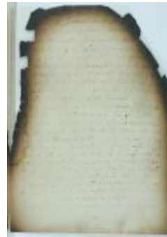
Council minutes, November 16, 1683 (NYSA_A1895-78_V005_022)