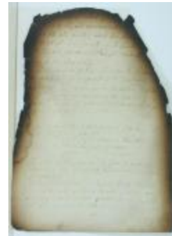
Council minutes, November 12, 1683 (NYSA_A1895-78_V005_020-021)