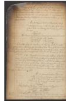
Council minutes, December 23, 1775 (NYSA_A1895-78_V026_25)