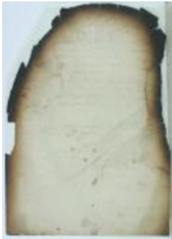
Council minutes, September 26, 1683 - October 1, 1683 (NYSA_A1895- 78_V005_006)