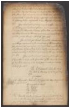
Council minutes, May 26, 1783 (NYS_A1895-78_V026_38)