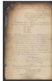
Council minutes, December 20, 1781 (NYSA_A1895-78_V026_32)