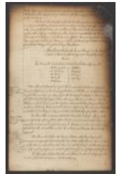
Council minutes, March 22, 1775 (NYSA_A1895-78_V026_07)