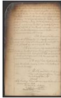
Council minutes, April 10, 1783 (NYS_A1895-78_V026_36)