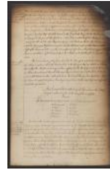
Council minutes, February 9 and 28, 1775 (NYSA_A1895-78_V026_02)