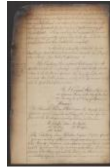
Council minutes, April 17, 1783 (NYS_A1895-78_V026_37)