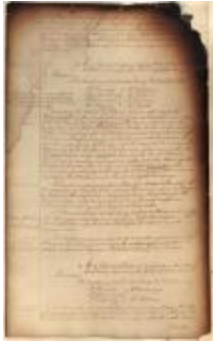
Colonial Council meeting minutes, September 24, 1756 (NYSA_A1895-78_V025_144)