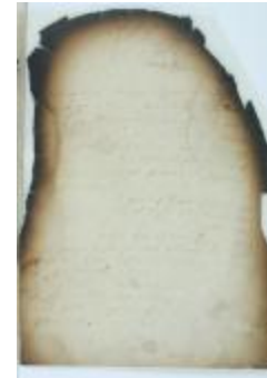
Council minutes, September 24, 1683 (NYSA_A1895-78_V005_005)