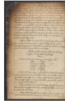
Council minutes, May 1, 1775 (NYS_A1895-78_V026_13)