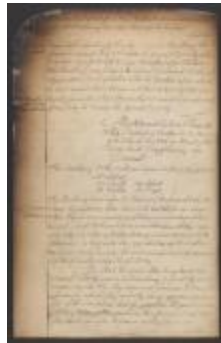
Council minutes, January 29, 1776 (NYSA_A1895-78_V026_27)