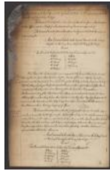
Council minutes, April 24, 1775 (NYS_A1895-78_V026_11)