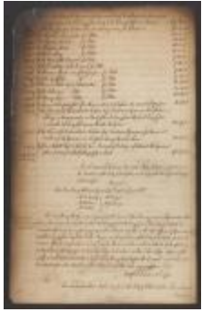
Council minutes, October 31, 1775 (NYSA_A1895-78_V026_22)