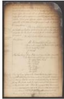
Council minutes, May 4, 1782 (NYS_A1895-78_V026_35)