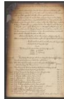
Council minutes, April 11, 1775 (NYSA_A1895-78_V026_09)