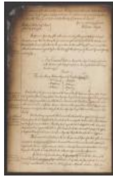
Council minutes, November 13, 1775 (NYSA_A1895-78_V026_23)