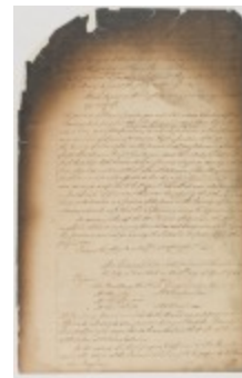
Council minutes, April 4, 1745 (NYSA_A1895-78_V021_013)