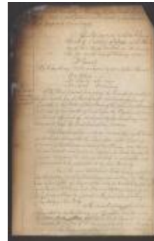
Council minutes, February 14, 1776 (NYSA_A1895-78_V026_28)