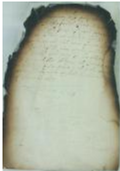
Council minutes, September 15, 1683 (NYSA_A1895-78_V005_002-003)