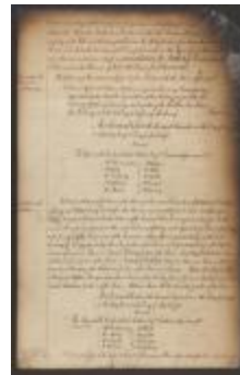
Council minutes, April 1 and 7, 1775 (NYSA_A1895-78_V026_08)