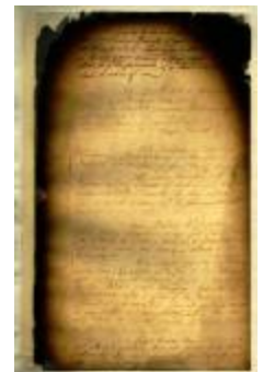
Council Minutes, May 15, 1710 (NYSA_A1895-78_V010_497)