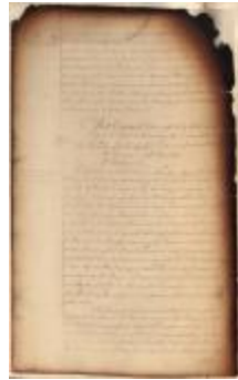
Colonial Council meeting minutes, March 18, 1758 (NYSA_A1895-78_V025_227)