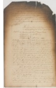
Council minutes, May 23, 1745 (NYS_A1895-78_V021_023)