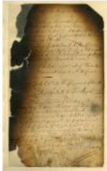
Council minutes, May 20, 1670 (NYSA_A1895-78_V003_pt1_029)