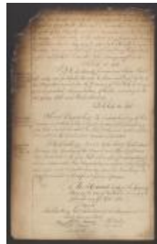
Council minutes, April 15, 1780 and May 23, 1781 (NYSA_A1895-78_V026_31)