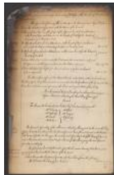
Council minutes, June 3, 1775 (NYS_A1895-78_V026_15)