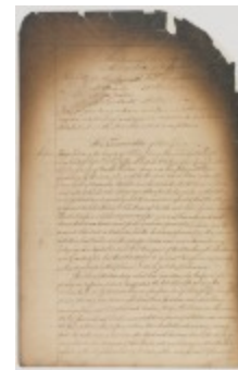
Council minutes, April 6, 1745 (NYSA_A1895-78_V021_014-015)