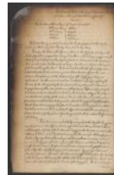
Council minutes, June 30, 1775 (NYS_A1895-78_V026_17)