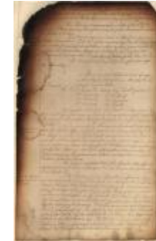
Colonial Council meeting minutes, August 25, 1755 (NYS_A1895-78_V025_61a)