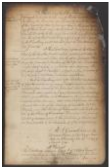
Council minutes, March 23, 1780 (NYSA_A1895-78_V026_30)