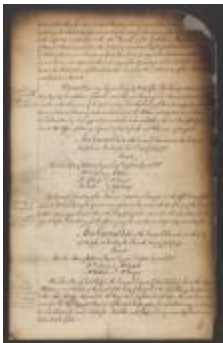
Council minutes, July 3 and 11, 1775 (NYS_A1895-78_V026_18)