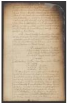
Council minutes, December 26, 1775 (NYSA_A1895-78_V026_26)