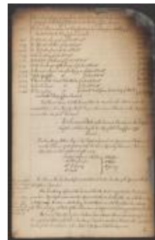
Council minutes, June 28, 1775 (NYS_A1895-78_V026_16)