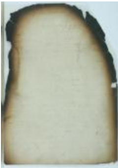
Council minutes, October 4, 1683 (NYSA_A1895-78_V005_007-008)