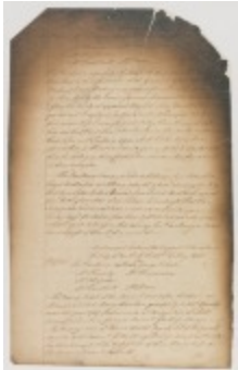
Council minutes, May 14, 1745 (NYS_A1895-78_V021_021)