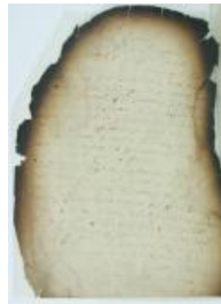
Council minutes, September 22, 1683 (NYSA_A1895-78_V005_004)