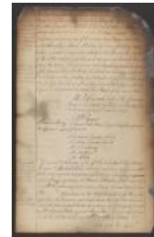
Council minutes, December 22, 1781 (NYSA_A1895-78_V026_33)