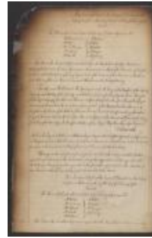
Council minutes, February 2 and 8, 1775 (NYSA_A1895-78_V026_01)