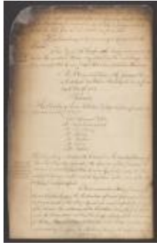
Council minutes, March 21, 1782 (NYS_A1895-78_V026_34)