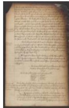
Council minutes, September 4, 1775 (NYS_A1895-78_V026_20)