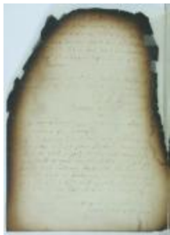
Council minutes, November 22, 1683 (NYSA_A1895-78_V005_023-024-025)