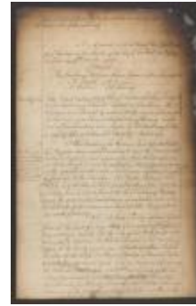
Council minutes, December 1 and 4, 1775 (NYSA_A1895-78_V026_24)