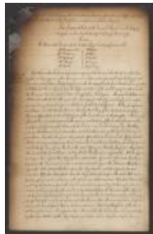
Council minutes, March 21, 1775 (NYSA_A1895-78_V026_06)