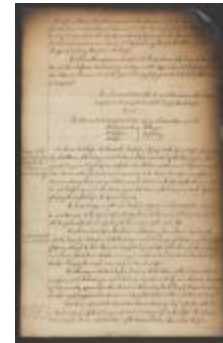
Council minutes, March 20, 1775 (NYSA_A1895-78_V026_05)