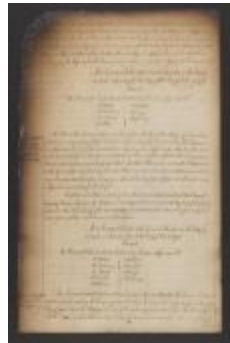
Council minutes, March 9, 1775 (NYSA_A1895-78_V026_03)