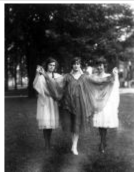
Recreation. The Queen of the Fairies. (NYSA_PPO_254)