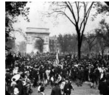
Culture. Italian Celebration. (NYSA_PPO_224)