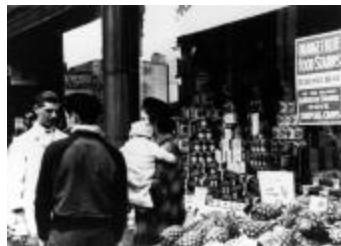
Government - Food Stamp Program in Rochester (NYSA_PPO_170)