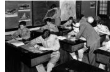
World War II - Navigation Class (NYSА_PPO_824)