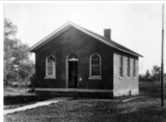
Education. One-Room School House. (NYSA_PPO_250)