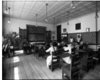
Education. Special Class of Girls. (NYSА_PPO_351)