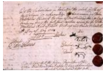
Native American - Portion of Indian Deed dated May 29, 1757 (NYSA_PPO_86)