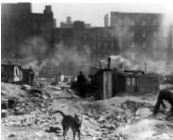
New York City. Hooverville in 1932. (NYSA_PPO_238)