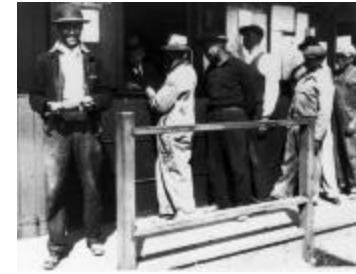
Construction - Black Construction workers (NYSA_PPO_113)