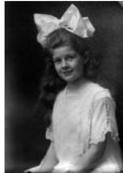
Children - Young Girl's Portrait (NYSА_PPO_378)