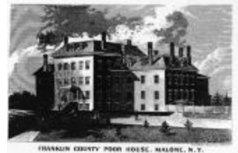
Franklin County Poorhouse (NYSA_PPO_175)