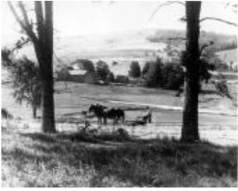
Agriculture. Farm Scene. (NYSA_PPO_69)