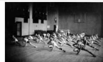
Education. Physical Education. (NYSA_PPO_257)