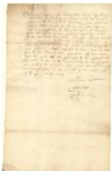
Petition from the town of Flushing (NYSA_A1810-78_V12_52)