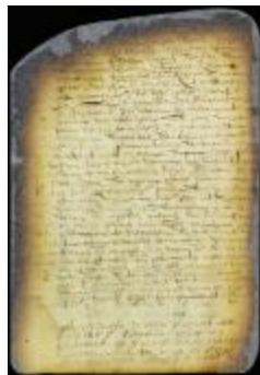
Dutch translation of commission of Take Jans, master of the ship St. Catarina (NYSA_A1809-78_V09_0327a)