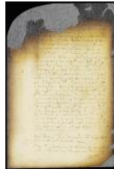
Petition of burgomasters and schepens for the privilege of appointing city officers, with answer refusing (NYSA_A1809-78_V08_0449)