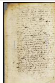
Ordinance for the surer prevention of smuggling (NYSA_A1875-78_V16_pt1_0117)