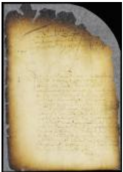
Ordinance against unlicensed taverns (NYSA_A1809-78_V08_0425b)