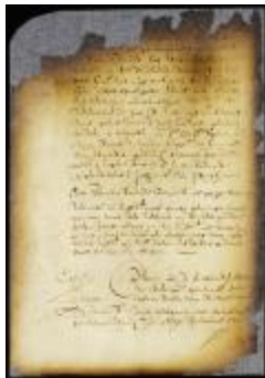
Petition of Isaac Tym for a house and lot on the South river; declined (NYSA_A1809- 78_V08_0516b)