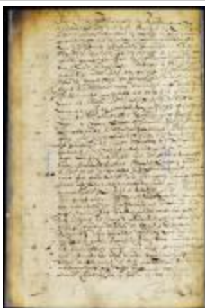
Ordinance further regulating the currency (NYSA_A1875-78_V16_pt1_0119)