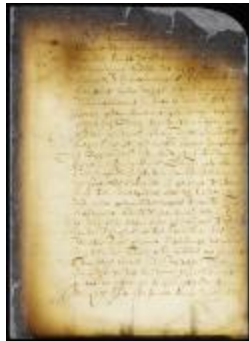
Deed of Fort Casimir to the burgomasters of the city of Amsterdam according to the Indian deed dated 19 July 1651