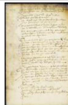
Actions of debt; attachment issued against the ship of Harmen Jacobsen Bambus (NYSA_A1876-78_V16_pt2_0086)