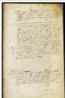
Ordinance for the better inspection of tobacco (NYSA_A1875-78_V16_pt1_0108)