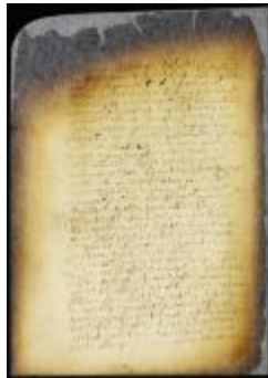
Ordinance establishing great and small citizenship in New Amsterdam (NYSA_A1809-78_V08_0436)