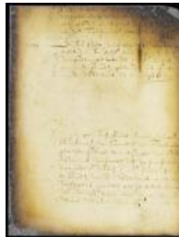
Form of certificate of the small burgher right (NYSA_A1809-78_V08_0453a)