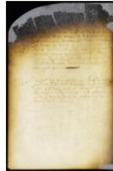
Order in regard to persons at Fort Orange accused by Pietersen (NYSA_A1809-78_V08_0582)