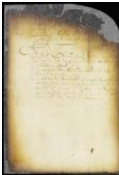
Appointment of grain and lime measurers for city of New Amsterdam (NYSA_A1809-78_V08_0451)