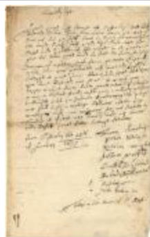
Petition from Oysterbay (NYSA_A1810-78_V12_53a)