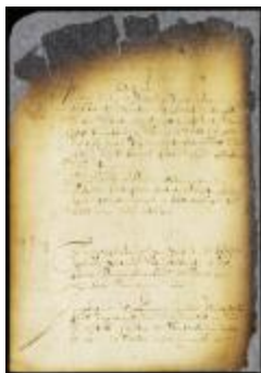
Order confiscating flints found in Gysbert Jansen's possession (NYSA_A1809-78_V08_0608a)