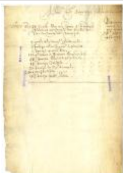
ACCOUNT (debit/credit) of Augustyn Beaulieu (NYSA_A1883-78_V17_038)