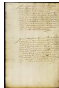
Patent of Peter Ebel for land near Fort Casimir (NYSA_A1880-78_VHHpt2_0078b)