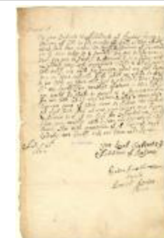
Letter from Daniel Denton to Petrus Stuyvesant (NYSA_A1810-78_V12_62)