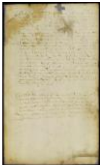
Patent of Nicasius de Sille for a lot in New Amsterdam (NYSA_A1880- 78_VHHpt2_0008)