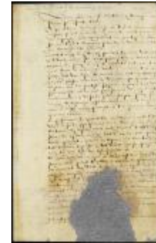
Copy of letter from Jacob Alrichs to director Stuyvesant (NYSA_A1878-78_V18_0037)