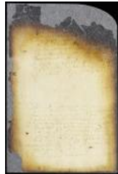
Order rejecting Hendrick Wagerman's petition for additional compensation for guns sold (NYSA_A1809-78_V08_0387)