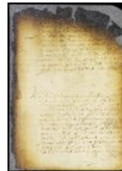
Notice not to remove the crops from the field until last year's tenths have been paid (NYSA_A1809-78_V08_0607a)