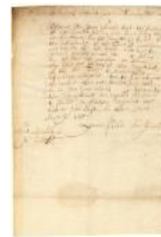
Summons for Middelburgh magistrates to appear before Council (NYSA_A1810-78_V12_51)