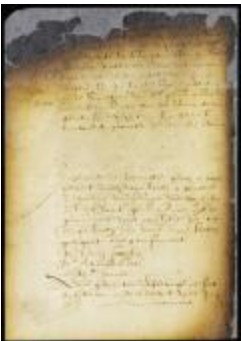
Appointment of magistrates for the town of Middelburgh, L. I. (NYSA_A1809-78_V08_0598)