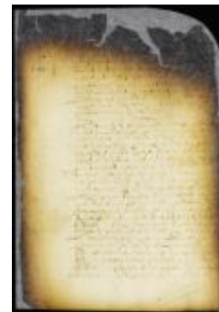
Ordinance for the fencing of lands and permitting firewood and other timber to be cut gratis on unclosed lots (NYSA_A1809-