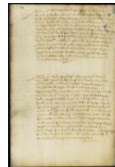
Patent of Peter Hermens (NYSA_A1880- 78_VHHpt2_0076b)