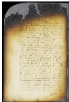
Petition of magistrates of Breuckelen complaining that an assessment of 300 guilders for the minister is too heavy for so