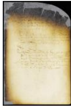
Order to Paulus van der Beeck to deliver good stringed wampum to the burgomasters in payment of the excise rent (NYSA_A1809-