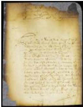
Nomination of magistrates for Fort Orange (NYSA_A1809-78_V08_0511)