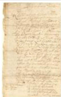
Indian deed for land at Heemstede (NYSA_A1810-78_V12_60b)