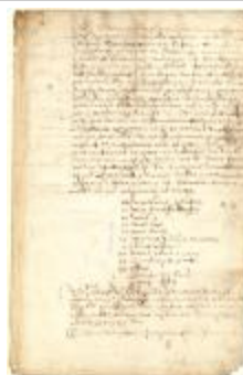
Indian deed for Staten Island (NYSA_A1810-78_V12_61)