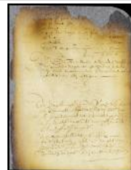
Order appointing Thursday in each week a market day in Breuckelen (NYSA_A1809- 78_V08_0523b)