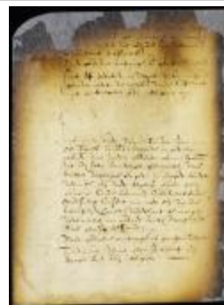
Permission to Jan Oosthoff to return to Holland (NYSA_A1809-78_V08_0520b)