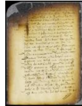
Proclamation appointing the first Wednesday in March a day of general thanksgiving and prayer (NYSA_A1809-