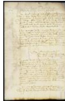
Minute of swearing in of the newly appointed magistrates and their oath; resolution concerning retiring magistrates