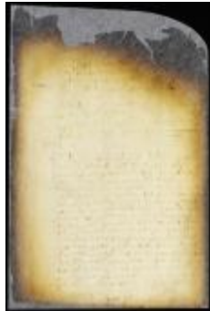
Ordinance regulating the currency (NYSA_A1809-78_V08_0383)