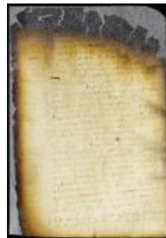
Ordinance against the profanation of the Sabbath and smuggling; designating the anchorage ground; against furious driving,