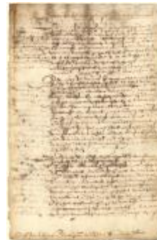
Letter from the Directors at Amsterdam to the Director General and Council (NYSA_A1810-78_V12_69)