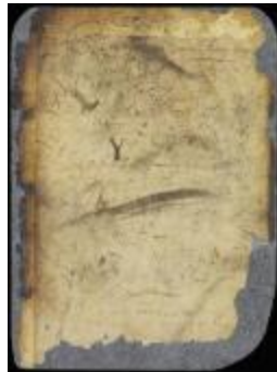
Endpaper of Volume 16 (NYSA_A1877-78_V16_pt4_i)