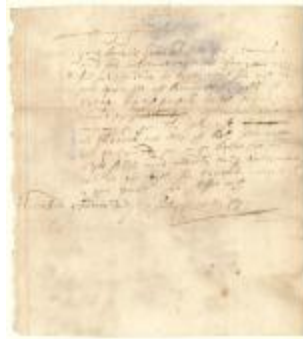
Letter from Petrus Stuyvesant to the magistrates of Heemstede (NYSA_A1810-78_V12_65)