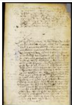
Ordinance against exporting goods without a permit (NYSA_A1875-78_V16_pt1_0118)