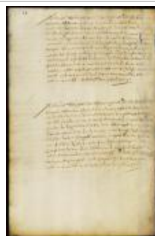
Patent of Reynier Dominicus for a lot by Fort Casimir (NYSA_A1880-78_VHHpt2_0078a)