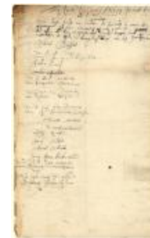
Oath written and signed by the inhabitants of Oostdorp (NYSA_A1810-78_V12_47)