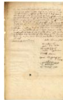
Petition of the inhabitants of Middelburgh (NYSA_A1810-78_V12_50)