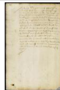
Patent of Jan Deckhoff for a lot at Fort Casimir (NYSA_A1880-78_VHHpt2_0084)