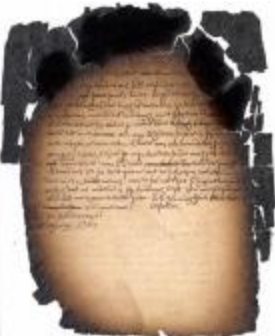
Letter of Jeremias van Rensselaer to David Becker (NYSL_sc7079-b04-f05_p1_ncn)