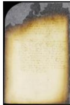
Order approving and authorizing the collection of an assessment for the payment of the minister in Amersfoort (NYSA_A1809-