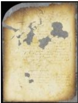
Nomination of measurers of grain and lime (NYSA_A1809-78_V08_0450)