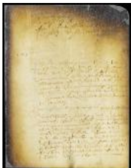
Appointment of searcher and inspector of imports and exports promised to Waraer Wessels (NYSA_A1809-78_V08_0473)