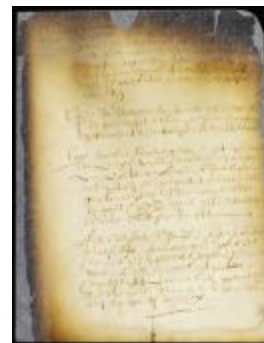
Proceedings in the case of widow Morris vs. Egbert van Borsum's slave (NYSA_A1809-78_V08_0539)