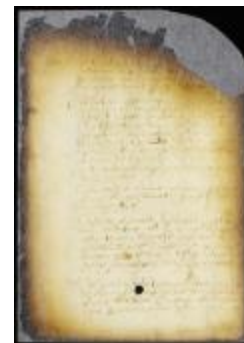
Opinion of the director-general on the petition to establish burgher right (NYSA_A1809-78_V08_0429)