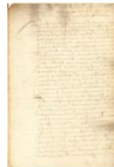
Petition of merchants trading to New Netherland (NYSA_A1810-78_V12_54)