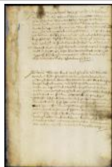
Patent of Peter Louwerense for a plantation near Fort Casimir (NYSA_A1880-78_VHHpt2_0077b)