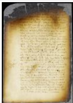
Notice that duties on peltries, etc., exported to places other than Holland shall be paid to Warnaer Wessels (NYSA_A1809-