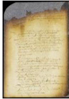
Memorandum of the names of those nominated for magistrates of Breuckelen (NYSA_A1809-78_V08_0484a)