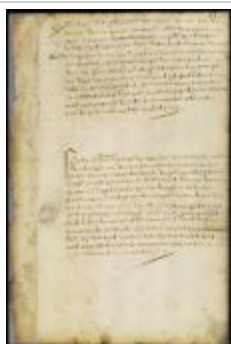
Patent of William Tailler for a lot at Fort Casimir (NYSA_A1880-78_VHHpt2_0081b)