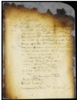
Nominations for the vacant offices of orphan master, city surveyor and fire warden in New Amsterdam (NYSA_A1809-