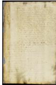
Partial copy of patent of Jans Gaggen (NYSA_A1880-78_VHHpt2_0087)