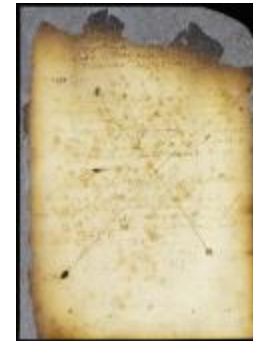
Petition of Capt. Augustin Bailjow to enter port of New Amsterdam (NYSA_A1809-78_V08_0587)