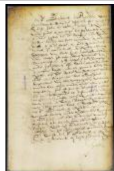
Ordinance declaring who may be admitted to great and small citizenship in New Amsterdam (NYSA_A1875-