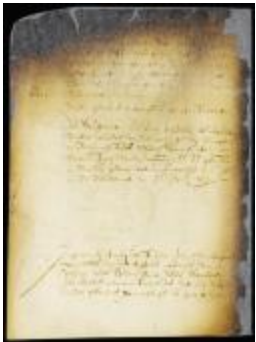
Order denying the request of Jan la Montagne for certain allowances (NYSA_A1809-78_V08_0562b)