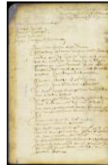
Actions of debt (NYSA_A1876-78_V16_pt2_0045)