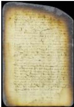
Commission of burgomasters and regents of the city of Amsterdam to Take Jans, master of the ship St. Catarina (NYSA_A1809-78_V09_0327a)