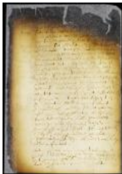
Permit to the Swedes on the South river to form a village where they think proper (NYSA_A1809-78_V08_0599)