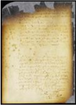
Order declaring West India sugar free of import duty (NYSA_A1809-78_V08_0580b)