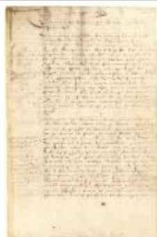
Letter from the Directors at Amsterdam to the Director General and Council (NYSA_A1810-78_V12_56)