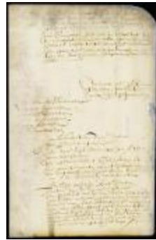
Actions of debt; Baefje Pietersen vs. Meuwes Hoogenboom and others (NYSA_A1876-78_V16_pt2_0058)