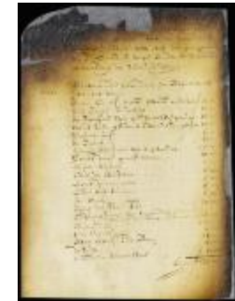
Names of the inhabitants of Breuckelen, The Ferry, Walebocht and Gouwanes, and the amounts they are respectively assessed