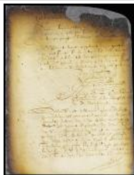
Order on petition of Cornelis van Ruyven (NYSA_A1809-78_V08_0505a)