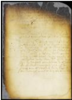
Order for the release of Jochem Wessels on bail (NYSA_A1809-78_V08_0573)