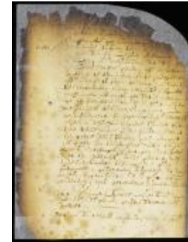
Petition of Jochem Backer for leave to return to Fort Orange (NYSA_A1809-78_V08_0583)