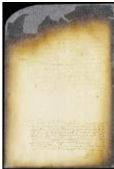
Resolution concerning the tappers' excise on Long Island (NYSA_A1809- 78_V08_0394)