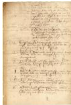
List of surviving settlers sent to Staten Island by Hendrick van der Capellen Toe Rijssel (NYSA_A1810-78_V12_68)