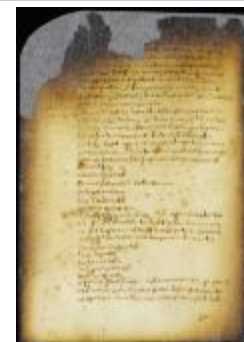
Nomination of persons recommended by the burgomasters and schepens to be public laborers (NYSA_A1809-78_V08_0482)