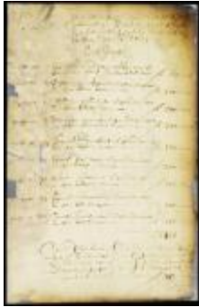
Account of the fines received and expenses incurred at Fort Orange from 4th October, 1656, to 28th March, 1658 (NYSA_A1876-78_V16_pt4_i)