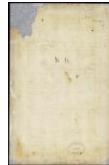
List of emigrants from Holland to New Netherland from 1654 to 1664, with their accounts, debit and credit (NYSA_A1810-78_V13_0009)