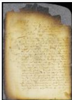
Petition of Cornelis van Ruyven requesting to know what percentage is to be allowed him as receiver (NYSA_A1809-