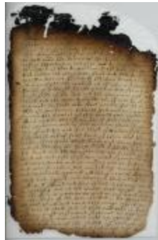
Flushing Remonstrance (NYSA_A1809-78_V08_0625)