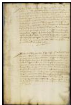
Patent of Cornelis Steenwyck for a lot near Fort Casimir (NYSA_A1880-78_VHHpt2_0079a)