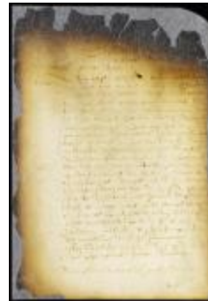
Petition of Jochem (Wesselse) Backer for leave to return to Fort Orange (NYSA_A1809-78_V08_0575)