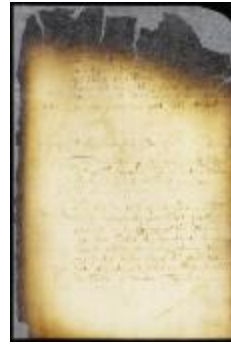
Minute of the discovery of unmarked cases of gun barrels and of linen (NYSA_A1809-78_V08_0611)