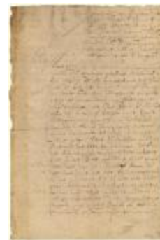
Journal of mission to Oostdorp (NYSA_A1810-78_V12_46)