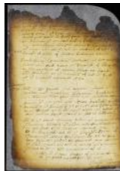
Confessions of Abigail Balden and Enam Benoni to adultery (NYSA_A1809-78_V08_0419a)