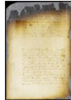
Proceedings against Jochem de Backer (NYSA_A1809-78_V08_0576)