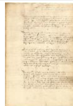
Instructions for the management of finances (NYSA_A1810-78_V12_59)