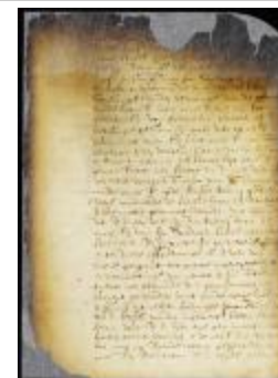
Protest of Isaac Allerton, Sr., against Jan Paul Jacquet, commander on the South river (NYSA_A1809-78_V08_0527)