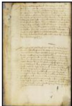
Patent of Ryer Lammersen Mol for a lot near Fort Casimir (NYSA_A1880- 78_VHHpt2_0075a)