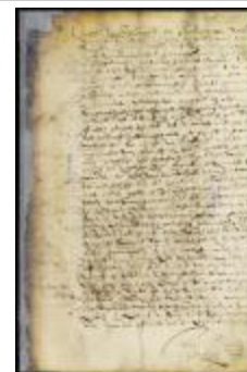
Ordinance concerning thatched roofs, wooden chimneys, hay stacks, fire buckets, hooks and ladders in New Amsterdam