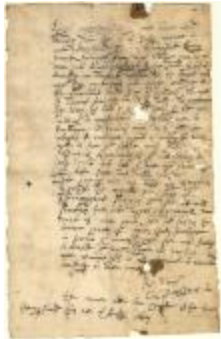
Letter from the town of Hempstead to Petrus Stuyvesant (NYSA_A1810-78_V12_64)