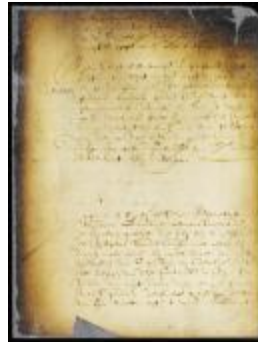
Order increasing the salary of Resolved Waldron (NYSA_A1809-78_V08_0595b)