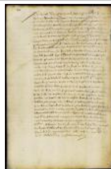
Patent of Jacob Crabbe for land near Fort Casimir (NYSA_A1880-78_VHHpt2_0080)