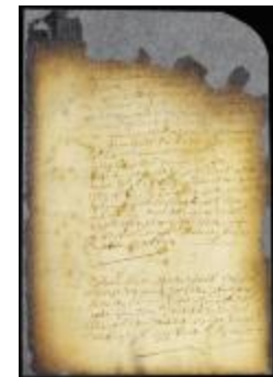
Appointment of the magistrates and sheriff of Gravesend (NYSA_A1809-78_V08_0487a)