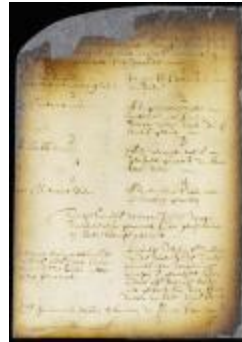
Examination of Tryntje Cornelis and Ariaentje Walings (NYSA_A1809-78_V08_0532)