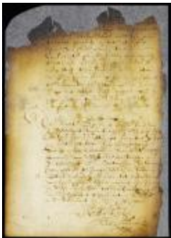
Resolution to permit a French privateer to come into the port of New Amsterdam (NYSA_A1809-78_V08_0589a)