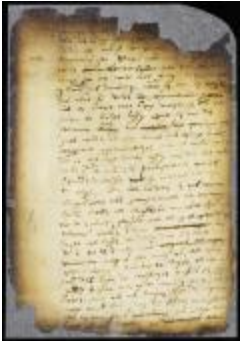
Orders to the fiscal in regard to the seizure and unloading of a ship (NYSA_A1809-78_V08_0591)