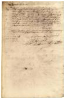
Letter from the Directors in Amsterdam to the Director General and Council (NYSA_A1810-78_V12_67b)