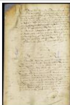
Ordinance for the fencing of private lands and authorizing the cutting of firewood and timber on unfenced lands (NYSA_A1875-