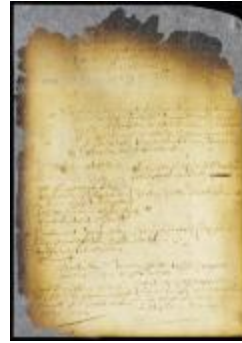
Examination of a slave and Jochem Wessels Backer on a charge of stealing powder (NYSA_A1809-78_V08_0571b)