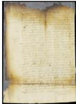
Letter from the magistrates to the director and council (NYSA_A1809-78_V08_0456)