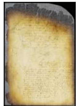
Petition of burgomasters and schepens of New Amsterdam for the establishment of burgher right (NYSA_A1809-78_V08_0427)