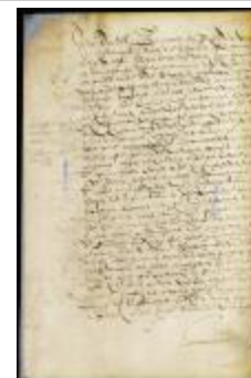
Ordinance obliging tavern keepers to take out a license and pay excise (NYSA_A1875-78_V16_pt1_0103)