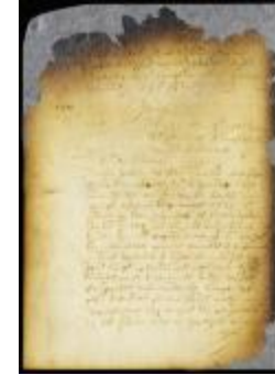
Petition of Jochem Wessels to be discharged on bail (NYSA_A1809-78_V08_0572)