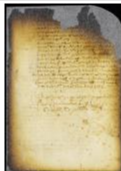
Order that a writ of appeal issue for Solomon Lachaire (NYSA_A1809-78_V08_0481)