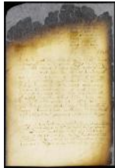
Certificate of Hendrick Huyghen (NYSA_A1809-78_V08_0614a)