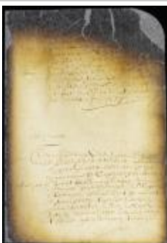
Opinions of merchants of New Amsterdam on the ordinance to prevent fraud in the inspection of tobacco (NYSA_A1809-