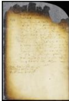
Order releasing a portion of goods seized from Goose Gerritsen (NYSA_A1809-78_V08_0619)