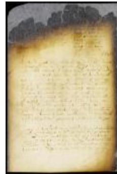
Order for payment of Abbe Claesen's claim (NYSA_A1809-78_V08_0614b)