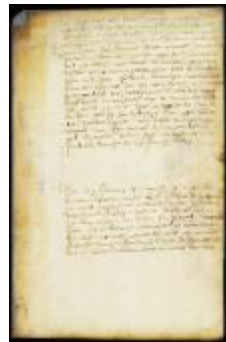
Minute of a proclamation for a day of prayer (NYSA_A1876-78_V16_pt2_0047)