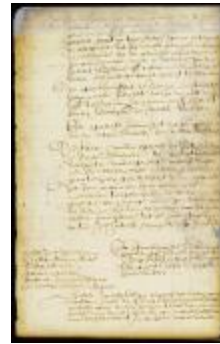
Resolution permitting the inhabitants to employ indigenous brokers in the trade with indigenous peoples this year (NYSA_A1876-78_V16_pt2_0071b)