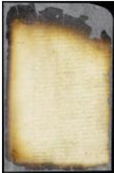
Petition of Goose Gerritsen for the release of goods belonging to him (NYSA_A1809-78_V08_0617)