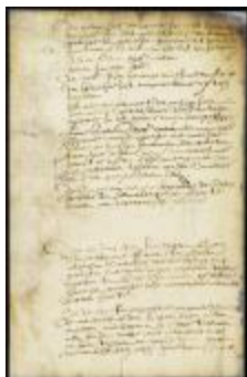
Answer of the court to the proposals from the three Mohawk Castles (NYSA_A1876-78_V16_pt2_0080)