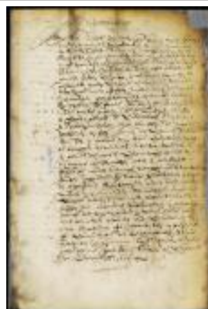
Ordinance annulling all fraudulent sales of mortgaged lands on South river (NYSA_A1875-78_V16_pt1_0122)