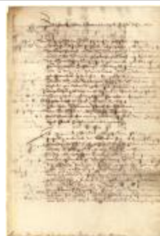
Letter from the Directors at Amsterdam to the Director General and Council (NYSA_A1810-78_V12_58)