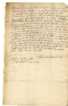
Commission from Flushing (NYSA_A1810-78_V12_53b)