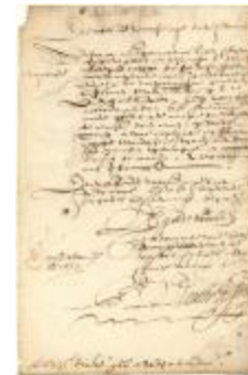
Letter from the Directors in Amsterdam to the Director General and Council (NYSA_A1810-78_V12_70)