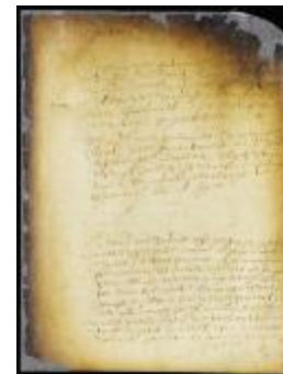
Order to increase the number of laborers at the public store and weighhouse to nine (NYSA_A1809-78_V08_0471b)