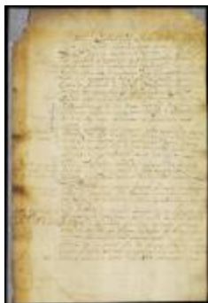
Ordinance renewing sundry ordinances which have fallen into disuse (NYSA_A1875-78_V16_pt1_0001)