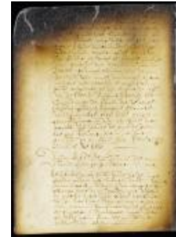
Order denying motion of the fiscal to confiscate articles from lieut. Alexander d'Hinoyossa (NYSA_A1809-78_V08_0510b)