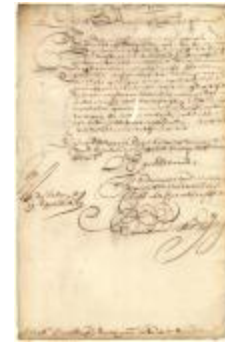
Letter from the Directors in Amsterdam to the Director General and Council (NYSA_A1810-78_V12_67a)