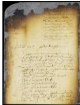
Appointment of orphan master, city surveyor and fire warden of New Amsterdam (NYSA_A1809-78_V08_0462)