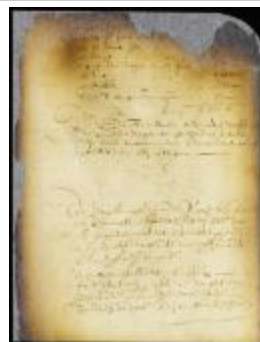
Warrant for the arrest of the slave charged with theft from Widow Morris (NYSA_A1809- 78_V08_0523a)