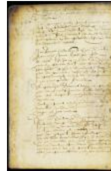
Resolution that all public work shall be done in future by contract (NYSA_A1876-78_V16_pt2_0039)