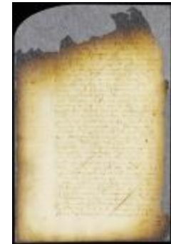
Resolution to furnish Oostdorp with arms and ammunition (NYSA_A1809- 78_V08_0390)