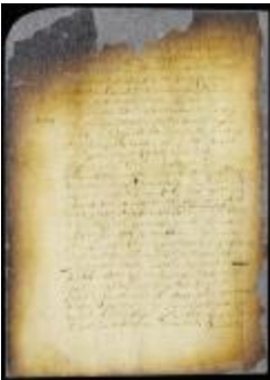
Ordinance declaring who are entitled to great and small citizenship (NYSA_A1809-78_V08_0442)