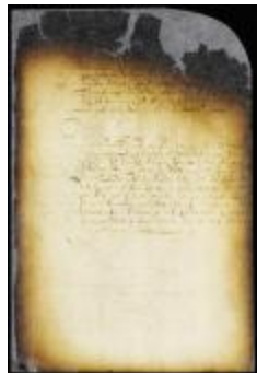
Order granting the petition of the magistrates of Midwout (NYSA_A1809-78_V08_0405)