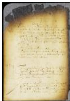
Proceedings in the appeal of Isaacq Mesa (NYSA_A1809-78_V08_0608b)