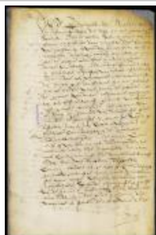
Ordinance regulating the currency (NYSA_A1875-78_V16_pt1_0098)