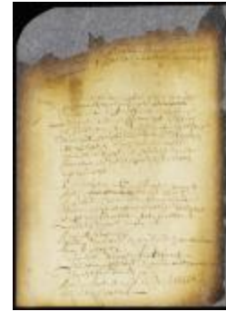
Appointment of magistrates for Midwout and Amesfoort (NYSA_A1809-78_V08_0484b)