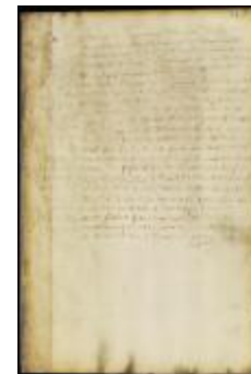
Patent of Peter Lourensen for a lot near Fort Casimir (NYSA_A1880-78_VHHpt2_0091)