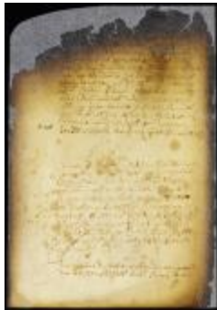
Oath of office of Warnaer Wessels as inspector and searcher of customs (NYSA_A1809-78_V08_0508)