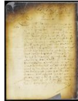
Resignation of the office of clerk of New Amsterdam by Jacob Kip (NYSA_A1809-78_V08_0596)