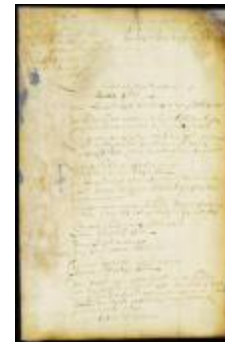
Sundry actions for debt (NYSA_A1876-78_V16_pt2_0116)