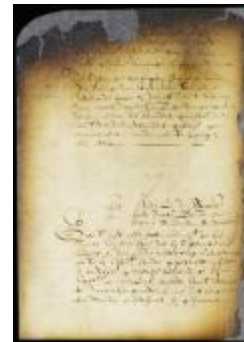
Petition of Tryntie Cornelis, accused of adultery, for examination and to be confronted with her accusers (NYSA_A1809-