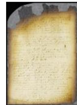
Opinion of councillor De Sille on the petition of burgomasters and schepens of New Amsterdam (NYSA_A1809-78_V08_0434)