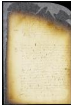
Ordinance regulating the currency suspended (NYSA_A1809-78_V08_0395)