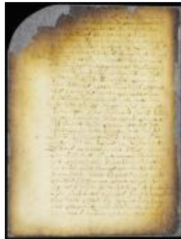
Petition of magistrates of Amersfoort for confirmation of an assessment for the payment of the minister (NYSA_A1809-