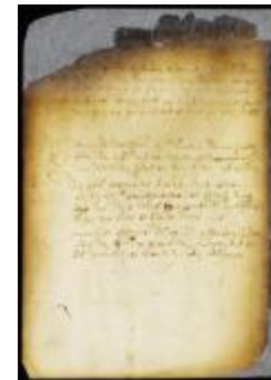
Order to expedite proceedings (NYSA_A1809-78_V08_0570a)