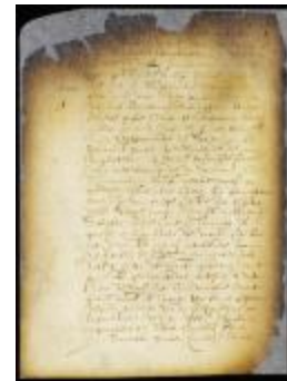
Petition of some of the crew of the ship Prince Maurice that freight belonging to them may be free from an attachment