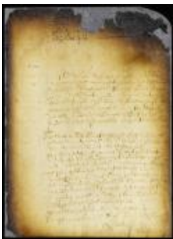
Order that the retiring burgomaster shall in future act as treasurer of the city New Amsterdam (NYSA_A1809-78_V08_0469b)