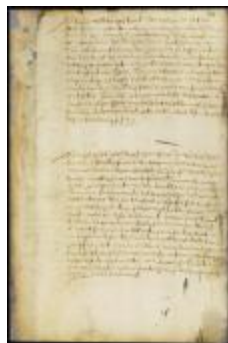
Patent of Claes Pietersen for a lot near Fort Casimir (NYSA_A1880-78_VHHpt2_0075b)