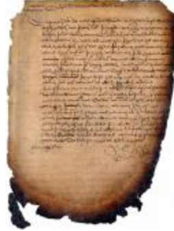
Letter of Jeremias van Rensselaer to Oloff Stevensen van Cortlandt (NYSL_sc7079- b04-f24_p2_ncn)