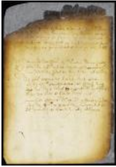
Action of Warnae Wessels vs. Simon Joosten (NYSA_A1809-78_V08_0570b)