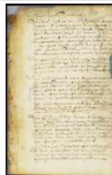
Propositions of the three Mohawk castles (NYSA_A1876-78_V16_pt2_0077b)