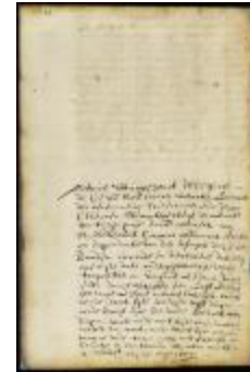
Patent of Christiaan Barentsen for a lot in New Amsterdam (NYSA_A1880-78_VHHpt2_0088a)