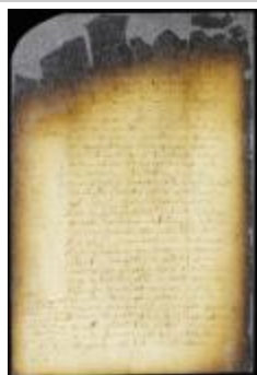
Ordinance to prevent frauds in the inspection of tobacco (NYSA_A1809-78_V08_0494)