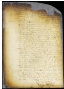
Petition of Salvador d'Andrada and other Jews that the burgomasters of New Amsterdam had refused to admit them to