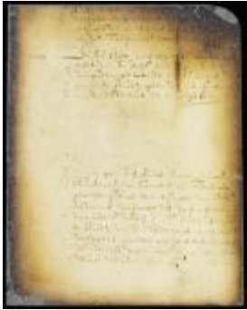
Order to examine the papers of Cornelis van Tienhoven (NYSA_A1809-78_V08_0453b)