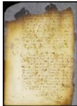
Permit to capt. Augustin Beaulieu to come into port, with a copy in French (NYSA_A1809-78_V08_0589b)