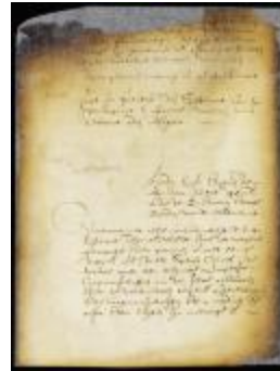
Permit to Serjeant Gysbert Bry to return to Holland (NYSA_A1809-78_V08_0544a)