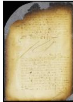
Petition of Jacques Corteljou to be surveyor-general (NYSA_A1809-78_V08_0422a)