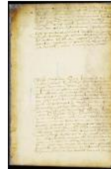
Actions of debt; Reyndert Hoorn vs. Adriaen Symonsen (NYSA_A1876-78_V16_pt2_0103a)