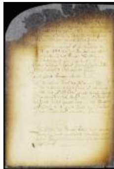
Form of certificate of great citizenship (NYSA_A1809-78_V08_0452)