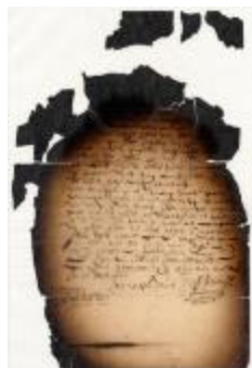
Letter from Oloff Stevensen van Cortlandt to Jeremias van Rensselaer (NYSL_sc7079- b01-f18_ncn)