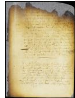
Order to confiscate the wages of Adriaen Van Tienhoven (NYSA_A1809-78_V08_0565a)