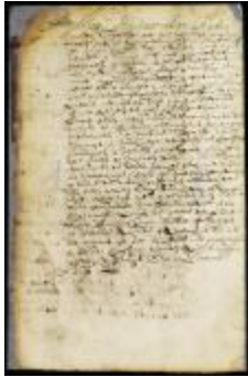
Ordinance for the more effectual prevention of quarrels and broils in the public streets of New Amsterdam (NYSA_A1875-