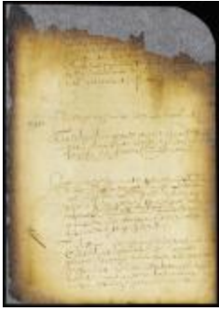
Permit to Peter Meyer to use the pleasure boat of the late gov. Printz as a dispatch boat (NYSA_A1809-78_V08_0483a)