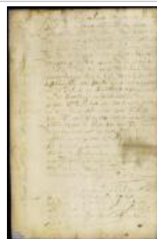
Patent of Cornelis Theunissen for land on Long Island (NYSA_A1880-78_VHHpt2_0083)