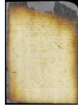
Appointment of magistrates for the city of New Amsterdam (NYSA_A1809-78_V08_0441)