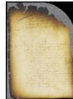
Grant of the petition of the heirs of Cornelis van Werckhoven to found a village on Long Island (NYSA_A1809-78_V08_0425a)