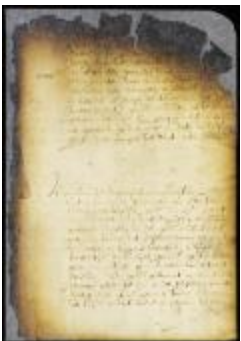
Order to Hendrick Ysbrants to pay duty on sundry articles in his possession (NYSA_A1809-78_V08_0607b)