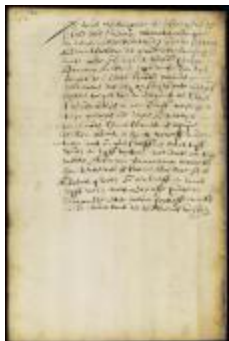
Patent of Claes Hendricksen for a lot in Beverwyck (Albany) (NYSA_A1880-78_VHHpt2_0092)