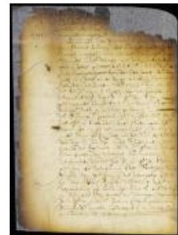
Petition of Nicholas Varlett for permission to receive merchants' goods on storage in the public store (NYSA_A1809-78_V08_0535)