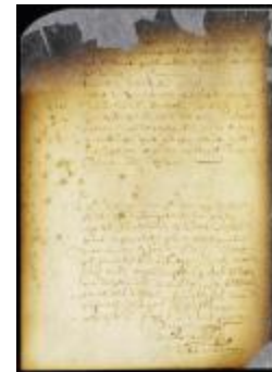
Order to receive certain duties on tobacco in Wampum at 10 guilders for one beaver (NYSA_A1809-78_V08_0580a)