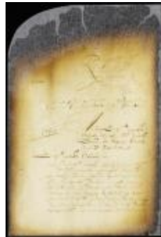
Petition of burgomasters and schepens of New Amsterdam on which the ordinance on citizenship was issued (NYSA_A1809-78_V08_0449)