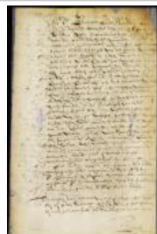
Ordinance concerning observance of the Sabbath; selling liquors to indigenous peoples; smuggling; the port of New