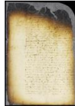
Petition of magistrates of Midwout for power to make an assessment for the payment of the minister to farm the citizens' and