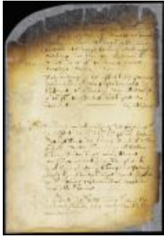
Minute of proceedings in the case of Augustin Beaulieu (NYSA_A1809-78_V08_0622b)