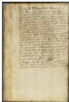
Patent of Nicasius de Sille for a lot in New Amsterdam (NYSA_A1880-78_VHHpt2_0093)