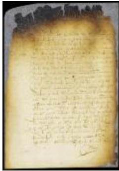
Amnesty granted to deserters who will return within two months (NYSA_A1809-78_V08_0560)