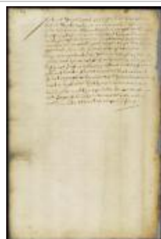
Patent to Margrietje Provoost (NYSA_A1880-78_VHHpt2_0082)