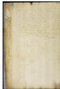
Patent of Luycas Dirksen for a lot near Fort Casimir (NYSA_A1880-78_VHHpt2_0073)