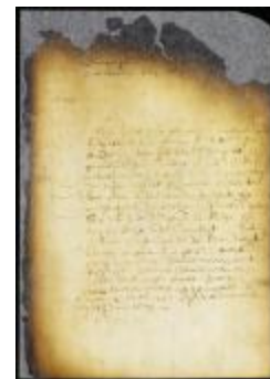
Appointment of Tymotheus Gabry to be clerk of the common council, New Amsterdam (NYSA_A1809-78_V08_0609)