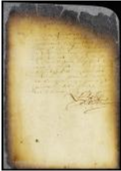
Resolution to issue an ordinance on the subject of citizenship (NYSA_A1809-78_V08_0435)