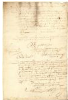
Letter from the Directors in Amsterdam to Petrus Stuyvesant (NYSA_A1810-78_V12_55)