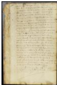
Patent to Jacques Corteljou (NYSA_A1880-78_VHHpt2_0089)