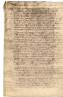
Letter from the Directors at Amsterdam to Petrus Stuyvesant (NYSA_A1810-78_V12_66)