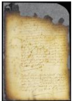
Minute that the sheriff of Gravesend has taken the oath of office (NYSA_A1809-78_V08_0487b)