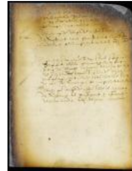
Order referring the case of Tryntje Cornelis to the fiscal and magistrates of Midwout (NYSA_A1809-78_V08_0533a)