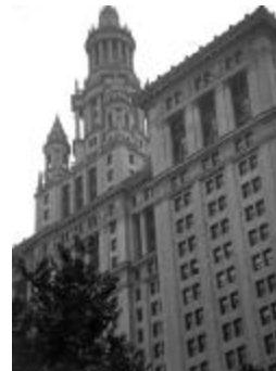
Manhattan Municipal Building in New York City, June 26, 1938 (NYS A_0245-77_NewYork_B09_76)