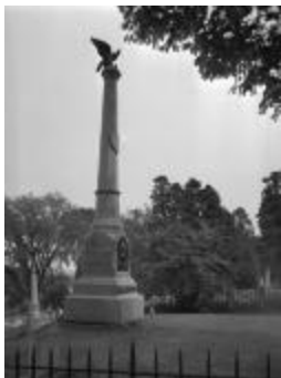
Monument marking the resting place of Colonel Elmer Ephraim Ellsworth in Saratoga Springs. July 29, 1941