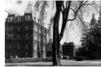
Main Building of Vassar College in Poughkeepsie, New York (NYSA_A0245-77_Dutchess_B03_20)