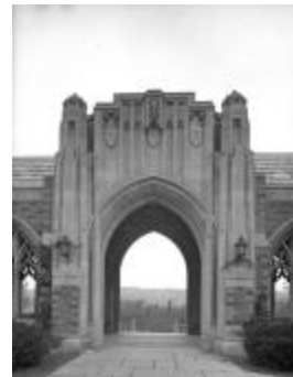
War Memorial in Ithaca, New York (NYSA_A0245-77_Tompkins_B21_3)