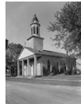
Christ Episcopal Church in Sackets Harbor, New York. May 15, 1938 (NYSA_A0245-77_Jefferson_B05_9)