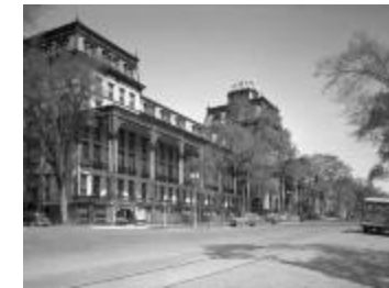
Grand Union Hotel in Saratoga Springs, New York. May 15, 1939 (NYSA_A0245-77_Saratoga_B12_57)