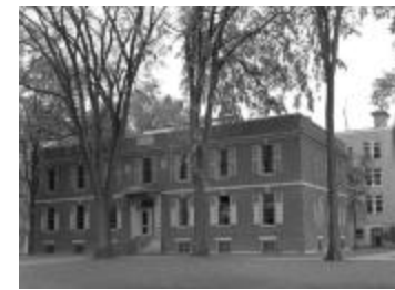
Crandall Public Library in Glens Falls, New York. September 28, 1938