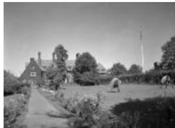
Sarah Lawrence College in Yonkers, New York