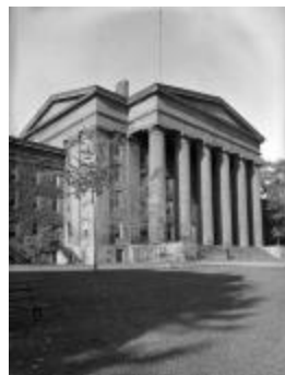
Utica Psychiatric Center located in Utica, October 7, 1937