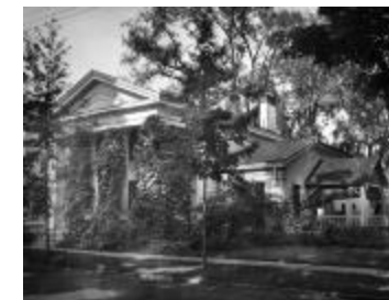
Madame Jumel Mansion in Saratoga Springs, New York. August 7, 1941 (NYSA_A0245-77_Saratoga_B14_28)