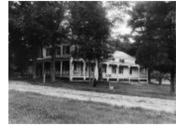
Dowling House in Lake George, New York (NYSA_A0245-77_Warren_B21_44)