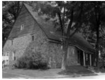
Jean Hasbrouck House in New Paltz, New York