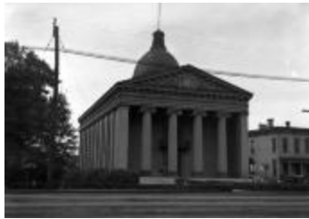
Montgomery County Courthouse located in Fonda, New York. September 30, 1936 (NYS A_0245-77_Montgomery_B09_31)