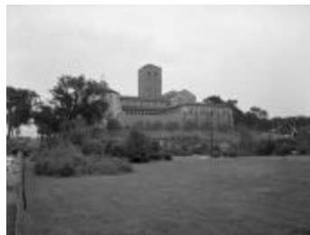
The Cloisters in Fort Tryon Park in New York. August 7, 1938