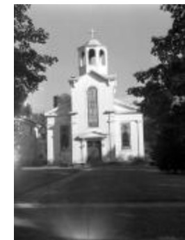
Roman Catholic Church in Leicester, New York (NYSA_A0245-77_Livingston_B05_47)