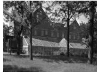
Home of Charles Steinmetz in Schenectady, New York. June 21, 1941 (NYSA_A0245-77_Schenectady_B19_24)