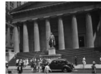
United States Treasury Building in New York City, August 6, 1938 (NYS A_0245-77_NewYork_B09_78)