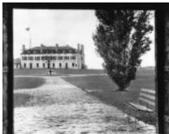
The "French Castle" at Fort Niagara in Youngstown, New York (NYS A_0245-77_Niagara_B10_13)