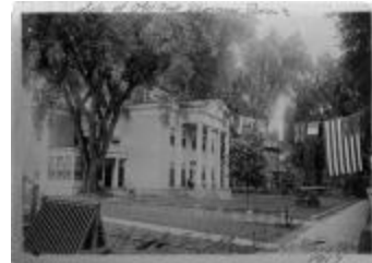
Site of old Fort Stanwix in Rome, New York, 1926 (NYS A_0245-77_Oneida_B10_34)