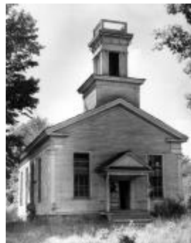
Old Johnsonburg Congregational Church in Sheldon, New York (NYS_A0245-77_Wyoming_B23_7)