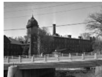
Bischoff Chocolate Factory in Ballston Spa, New York. April 26, 1941