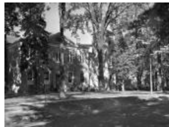
Cazenovia Seminary in Cazenovia, New York. September 21, 1941 (NYS_A0245- 77_Madison_B08_62)