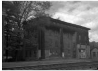
Old American House in Delaware County, New York. May 24, 1937 (NYSA_A0245-77_Delaware_B02_75)