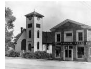
Pike Grange Hotel in Pike, New York (NYS_A0245-77_Wyoming_B23_41)