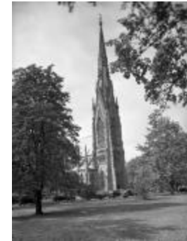
Cathedral of the Incarnation in Garden City, New York. October 9, 1938 (NYS A_0245-77_Nassau_B09_56)