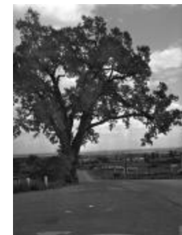
Lafayette Tree in Geneva, New York. September 23, 1941 (NYS A_0245-77_Ontario_B11_12)