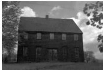
Quaker Meeting House, Quaker Hill, New York. May 17, 1937