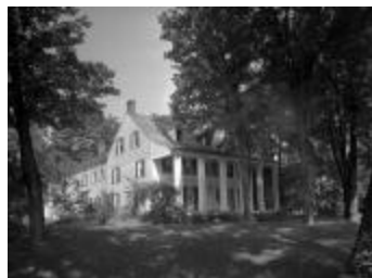
Brookside Tavern in Ballston Spa, New York. August 8, 1942