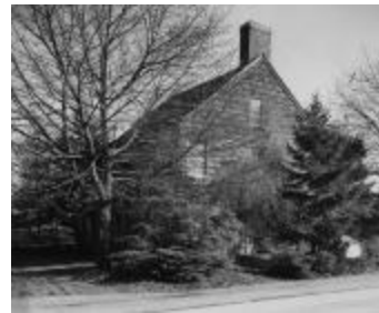
Walt Whitman Home located in Huntington, New York (NYS A_0245-77_Nassau_B09_53)