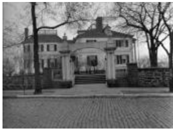
Morris-Jumel Mansion located in New York City. October, 1948 (NYS A_0245-77_NewYork_B09_69)