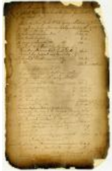
Copies of accounts audited by the New York State Auditor General, Book A (NYSA_A0870-77_BookA)