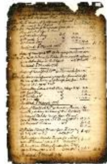
Copies of accounts audited by the New York State Auditor General, Book A, pages 321-326 (NYSA_A0870-77_BookA_Page321-