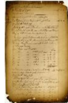
Copies of accounts audited by the New York State Auditor General, Book B, pages 81-100 (NYSA_A0870-77_BookB_Page081-