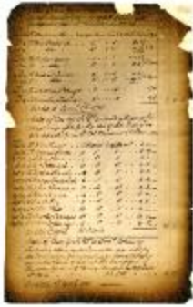
Copies of accounts audited by the New York State Auditor General, Book A, pages 221-240 (NYSA_A0870-77_BookA_Page221-