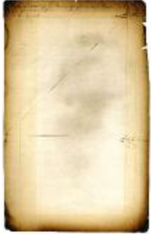
Copies of accounts audited by the New York State Auditor General, Book B, pages 341-360 (NYSA_A0870-77_BookB_Page341-