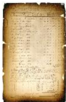
Copies of accounts audited by the New York State Auditor General, Book A, pages 161-180 (NYSA_A0870-77_BookA_Page161-180)