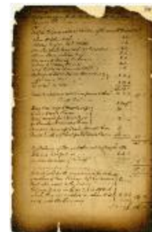
Copies of accounts audited by the New York State Auditor General, Book A, pages 201-220 (NYSA_A0870-77_BookA_Page201-220)