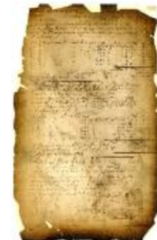
Copies of accounts audited by the New York State Auditor General, Book A, pages 121-140 (NYSA_A0870-77_BookA_Page121-140)