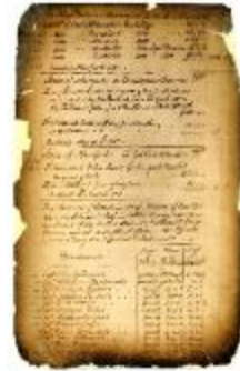
Copies of accounts audited by the New York State Auditor General, Book A, pages 21-40 (NYSA_A0870-77_BookA_Page021-40)