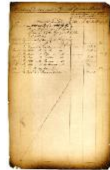
Copies of accounts audited by the New York State Auditor General, Book B, pages 301-320 (NYSA_A0870-77_BookB_Page301-