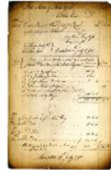
Copies of accounts audited by the New York State Auditor General, Book B, pages 241-260 (NYSA_A0870-77_BookB_Page241-