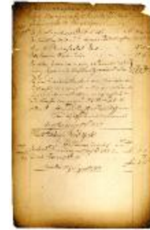
Copies of accounts audited by the New York State Auditor General, Book B, pages 161-180 (NYSA_A0870-77_BookB_Page161-