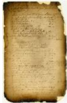
Copies of accounts audited by the New York State Auditor General, Book A, pages 1-20 (NYSA_A0870-77_BookA_Page001-20)