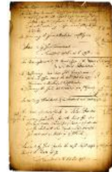
Copies of accounts audited by the New York State Auditor General, Book B, pages 321-340 (NYSA_A0870-77_BookB_Page321-