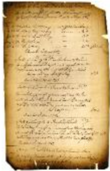
Copies of accounts audited by the New York State Auditor General, Book B, pages 101-120 (NYSA_A0870-77_BookB_Page101-