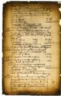
Copies of accounts audited by the New York State Auditor General, Book A, pages 301-320 (NYSA_A0870-77_BookA_Page301-