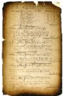
Copies of accounts audited by the New York State Auditor General, Book A, pages 141-160 (NYSA_A0870-77_BookA_Page141-160)