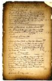
Copies of accounts audited by the New York State Auditor General, Book A, pages 241-260 (NYSA_A0870-77_BookA_Page241-