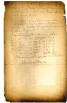
Copies of accounts audited by the New York State Auditor General, Book B, pages 201-220 (NYSA_A0870-77_BookB_Page201-