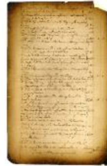
Copies of accounts audited by the New York State Auditor General, Book B, pages 141-160 (NYSA_A0870-77_BookB_Page141-