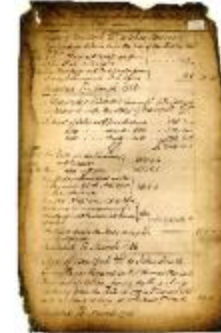
Copies of accounts audited by the New York State Auditor General, Book B, pages 1-20 (NYSA_A0870-77_BookB_Page001-20)