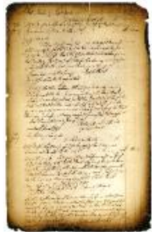
Copies of accounts audited by the New York State Auditor General, Book B, pages 261-280 (NYSA_A0870-77_BookB_Page261-