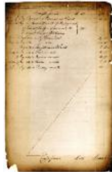
Copies of accounts audited by the New York State Auditor General, Book B, pages 281-300 (NYSA_A0870-77_BookB_Page281-