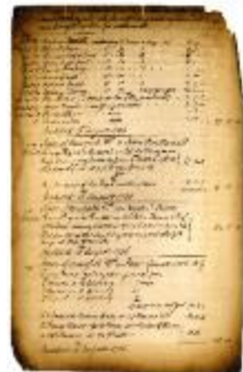
Copies of accounts audited by the New York State Auditor General, Book B, pages 41-60 (NYSA_A0870-77_BookB_Page041-60)