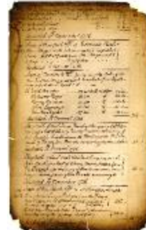
Copies of accounts audited by the New York State Auditor General, Book B, pages 61-80 (NYSA_A0870-77_BookB_Page061-80)