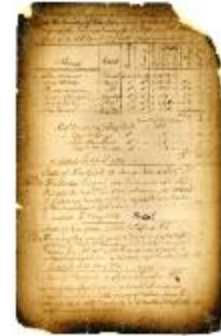
Copies of accounts audited by the New York State Auditor General, Book A, pages 41-60 (NYSA_A0870-77_BookA_Page041-60)