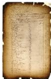
Copies of accounts audited by the New York State Auditor General, Book A, pages 181-200 (NYSA_A0870-77_BookA_Page181-200)