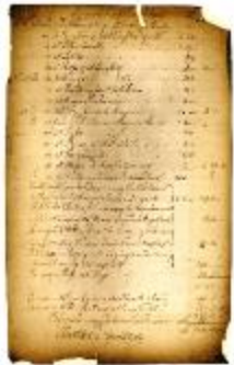
Copies of accounts audited by the New York State Auditor General, Book B, pages 181-200 (NYSA_A0870-77_BookB_Page181-