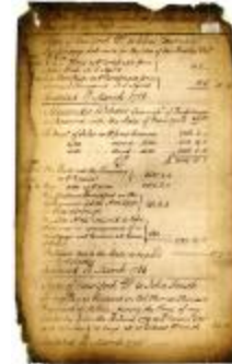
Copies of accounts audited by the New York State Auditor General, Book B (NYSA_A0870-77_BookB)