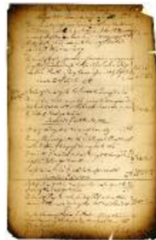
Copies of accounts audited by the New York State Auditor General, Book B, pages 121-140 (NYSA_A0870-77_BookB_Page121-