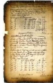
Copies of accounts audited by the New York State Auditor General, Book A, pages 261-280 (NYSA_A0870-77_BookA_Page261-