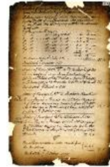
Copies of accounts audited by the New York State Auditor General, Book A, pages 281-300 (NYSA_A0870-77_BookA_Page281-