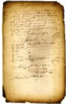
Copies of accounts audited by the New York State Auditor General, Book B, pages 361-366 (NYSA_A0870-77_BookB_Page361-