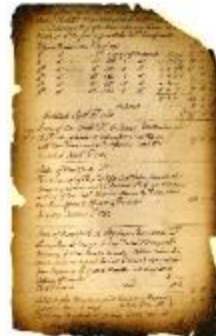
Copies of accounts audited by the New York State Auditor General, Book A, pages 101-120 (NYSA_A0870-77_BookA_Page101-120)