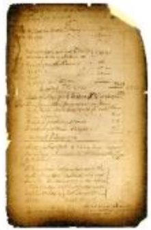
Copies of accounts audited by the New York State Auditor General, Book A, pages 61-80 (NYSA_A0870-77_BookA_Page061-80)