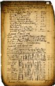
Copies of accounts audited by the New York State Auditor General, Book B, pages 21-40 (NYSA_A0870-77_BookB_Page021-40)