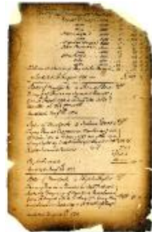
Copies of accounts audited by the New York State Auditor General, Book A, pages 81-100 (NYSA_A0870-77_BookA_Page081-100)