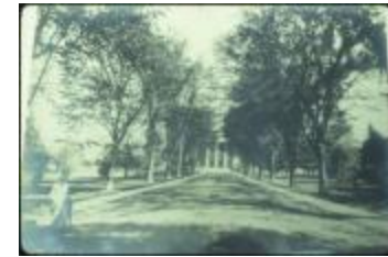
Utica Psychiatric Hospital (NYSA_B1560-97_B08_03)