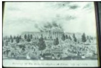
Utica Psychiatric Hospital (NYSA_B1560-97_B08_05)