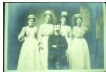
Utica Psychiatric Hospital (NYSA_B1560-97_B08_19)