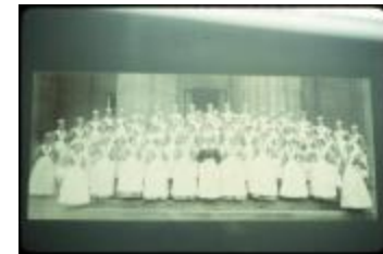
Utica Psychiatric Hospital (NYSA_B1560-97_B08_08)