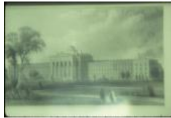
Utica Psychiatric Hospital (NYSA_B1560-97_B08_02)