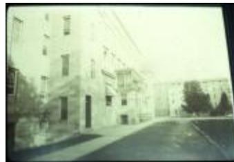
Utica Psychiatric Hospital (NYSA_B1560-97_B08_06)