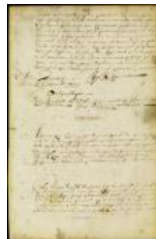
Permit to Madame Corlear to trade with the Indigenous Peoples at Schenectady and order respecting an black person enslaved