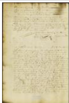
Letter from the magistrates to gov. Colve (NYSA_A1881-78_V23_0130)