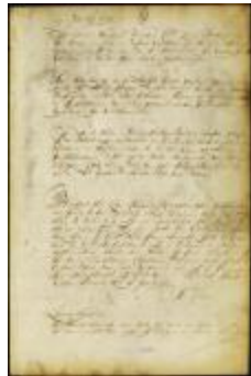
Permit to Lewis Morris; order to the magistrates at Nevesings; order for a new election at Shrewsbury (NYSA_A1881-