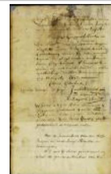
Order to the village of Bergen to send delegates to surrender to the Dutch (NYSA_A1881-78_V23_0002)