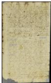
Commission of Nicholas Bayard to be receiver-general (NYSA_A1881-78_V23_0078)