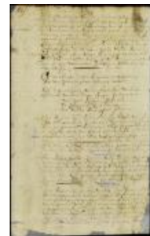
Appointment of militia officers for the town of Bergen (NYSA_A1881-78_V23_0054)