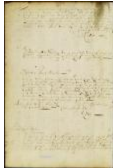
Letter from gov. Colve to schout Ogden (NYSA_A1881-78_V23_0118b)