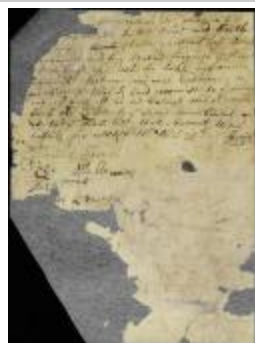
Declaration of allegiance signed by Quakers living at Westchester (NYSA_A1881- 78_V23_0277c)