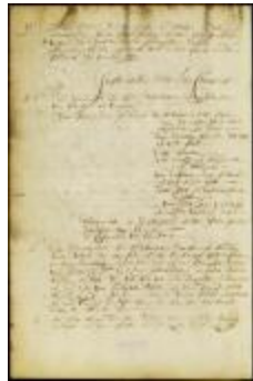
Instructions for the commissary (NYSA_A1881-78_V23_0102)