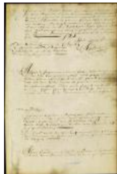
Order forbidding the export of provisions and other articles (NYSA_A1881-78_V23_0181b)