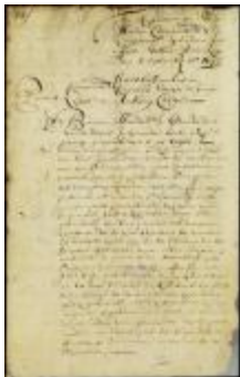
Order on a petition from Esopus for the government of that district (NYSA_A1881-78_V23_0046)