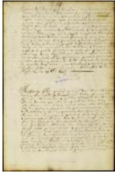
Commission of William Knyff to be fiscal of New Netherland (NYSA_A1881-78_V23_0177)