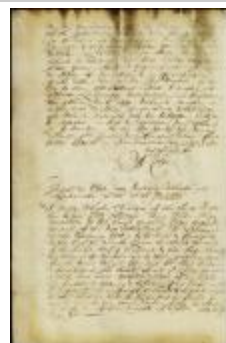
Oath of office taken by Walton Wharton (NYSA_A1881-78_V23_0084)