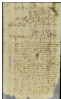
Appointment of magistrates for Schanegtade (NYSA_A1881- 78_V23_0072a)