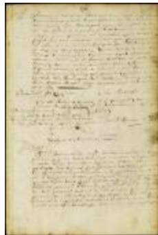
Letter from the gov. and council of Massachusetts to gov. Colve (NYSA_A1881-78_V23_0175a)