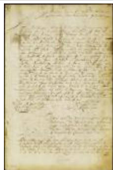
Order for delinquents at Hempstead to take the oath of allegiance (NYSA_A1881-78_V23_0085b)