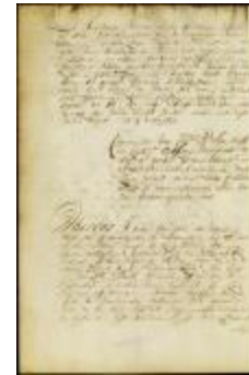
Order to the inhabitants of Fordham to send a nomination for magistrates (NYSA_A1881-78_V23_0104)