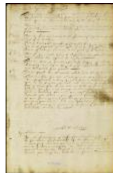
Letter from the court of Easthampton to the Dutch commissioners (NYSA_A1881-78_V23_0127b)