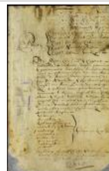
Summons to the English towns on Long Island and Westchester to send delegates to New Orange (NYSA_A1881-