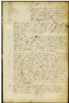
Instructions for the schout and magistrates of Brooklyn and adjoining towns on the west end of Long Island (NYSA_A1881-