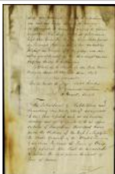
Order to the villages of Middletowne and Shrewsbury to send delegates to surrender to the Dutch (NYSA_A1881-78_V23_0003)