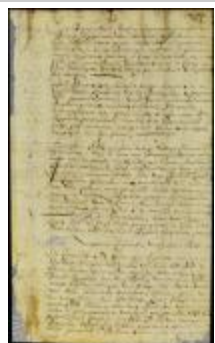
Confiscation of a ship lying sunk in Westchester creek (NYSA_A1881-78_V23_0061)