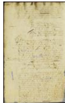
Commission for schout and secretary of Achter Col (NYSA_A1881-78_V23_0050)