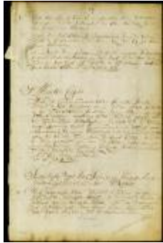
Instructions for the schout and commandant of the South river (NYSA_A1881-78_V23_0089b)