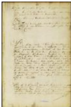
Appointment of assessors to value houses ordered to be pulled down near the fort (NYSA_A1881-78_V23_0115)