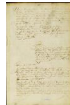
Minute of arrangements for removal of houses near the fort (NYSA_A1881-78_V23_0113)