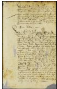
Oath of office of the municipal authorities (NYSA_A1881-78_V23_0009)