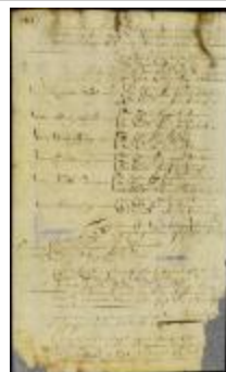
Names of the militia officers of said towns (NYSA_A1881-78_V23_0070)