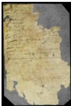
Names of the male inhabitants of West and Eastchester (NYSA_A1881-78_V23_0277b)