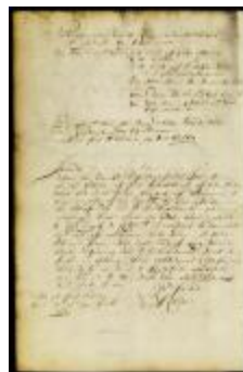
Letter from gov. Colve to Hempstead (NYSA_A1881-78_V23_0108)