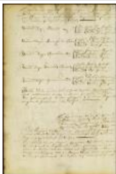
Appointment of militia officers for the towns of Midwout, Amesfoort, Breuckelen, Utrecht, Bushwyck and Gravesend (NYSA_A1881-