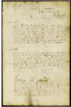
Report of the submission of Huntington and Seatacott and of the appointment of magistrates there (NYSA_A1881-