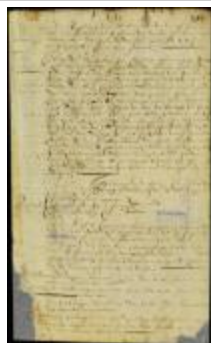
Census of the several towns at Achter Col (NYSA_A1881-78_V23_0069b)