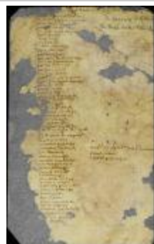
Names of persons residing between the Fresh water and Harlem and of negroes (NYSA_A1881-78_V23_0275)