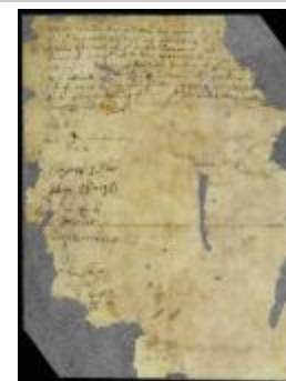
Oath of allegiance subscribed at Oysterbay, with names of the signers (NYSA_A1881- 78_V23_0277e)