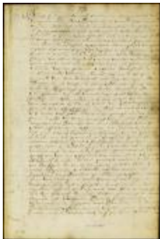
Proclamation ordering all strangers to depart the province and forbidding all correspondence with New England