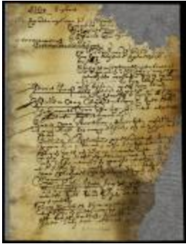
Minute of the commissioners appointed to arrange for the removal of the buildings adjoining the fort (NYSA_A1881-