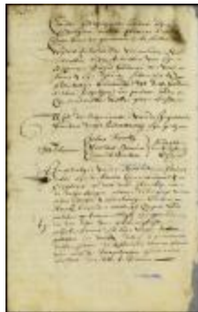
Appointment of magistrates for Piscataway (N. J.) (NYSA_A1881-78_V23_0034)