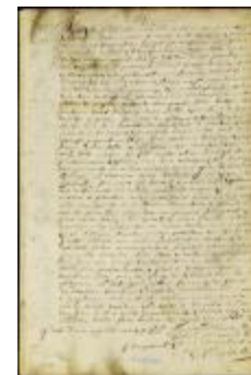
Order for the preservation and security of New Orange (NYSA_A1881-78_V23_0187)