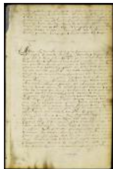
Order furloughing one-third of each of the militia companies that came to New Orange (NYSA_A1881-78_V23_0185)