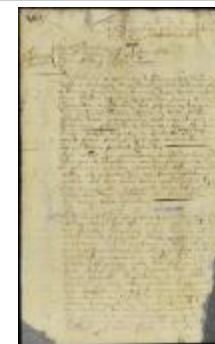
Fine imposed on John Singletary of New Jersey (NYSA_A1881-78_V23_0068b)