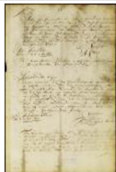
Minute of the attendance of the burgomasters of New Orange on the gov. council (NYSA_A1881-78_V23_0111b)