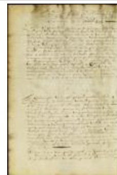
Minute of the appearance before the council of magistrates of towns on Long Island (NYSA_A1881-78_V23_0132b)