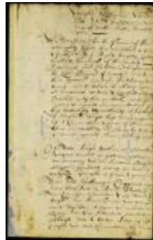
Patent to Nathaniel Silvester for Shelter Island (NYSA_A1881-78_V23_0041)