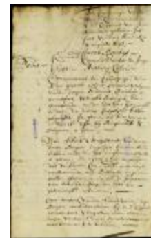
Minute of the qualifying of the magistrates of several towns (NYSA_A1881-78_V23_0020)