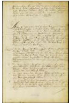
Orders extracted from the articles of war (NYSA_A1881-78_V23_0099)