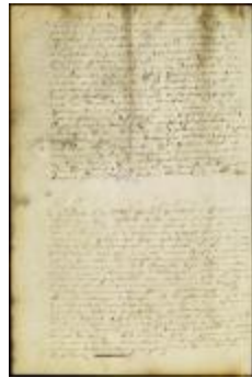
Various orders in view of a threatened attack from New England (NYSA_A1881-78_V23_0178)