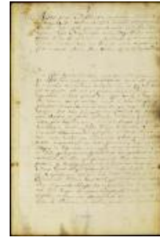
Order to capt. Ewoutsen to proceed to Nantucket and endeavor to save a small Dutch craft there (NYSA_A1881-