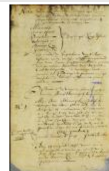
Minute of the submission of the Dutch towns on Long Island and of Staten Island (NYSA_A1881-78_V23_0006a)