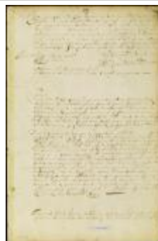
Order on a petition from Oysterbay explaining and confirming their privileges (NYSA_A1881-78_V23_0117a)