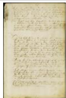
Grant of the free exercise of their religious worship to the Lutherans at Willemstadt (Albany) (NYSA_A1881-78_V23_0087)