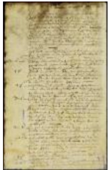
Answer of the Dutch authorities to the petition of delegates from the five English towns on Long Island (NYSA_A1881-