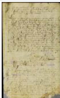
Proclamation confiscating all property in New Netherland belonging to the kings of France and England or their subjects