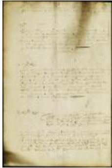
Examination of the captains of the New England ships brought in by captain Ewoutsen (NYSA_A1881-78_V23_0166)