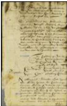
Minute of the submission of the proprietors of Shelter and Gardiner's Islands (NYSA_A1881-78_V23_0033)