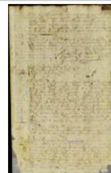
Order for the departure of ex-governor Lovelace (NYSA_A1881-78_V23_0063a)