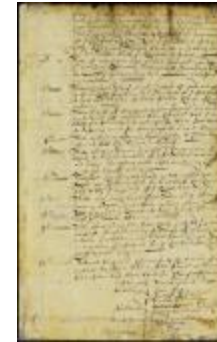
Petition of delegates from the five English towns on Long Island (NYSA_A1881-78_V23_0027)