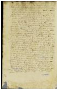
Letter from the governor and general assembly of Connecticut to the Dutch authorities at New Orange (NYSA_A1881-