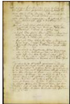
Minute that instructions for the schout and magistrates have been sent to Long Island, the South river, Esopus, and New Jersey