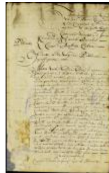
Order for the settlement of the late gov. Lovelace's accounts (NYSA_A1881-78_V23_0035)