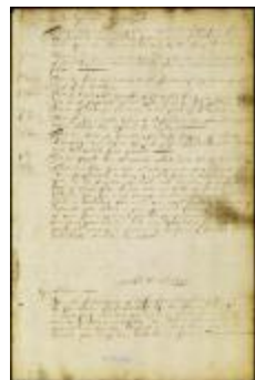
Reasons why the major part of the town of Southold refuse to come under the Dutch (NYSA_A1881-78_V23_0127a)