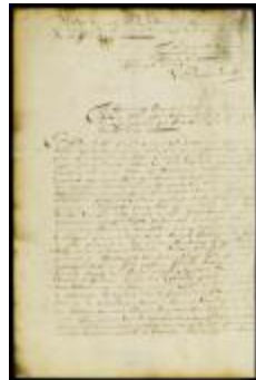
Order confiscating the four New England ships brought in by capt. Ewoutsen (NYSA_A1881-78_V23_0170)