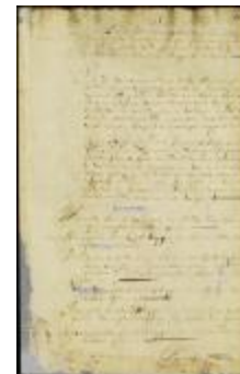
Census of Brooklyn and other towns on the west end of Long Island (NYSA_A1881-78_V23_0051)