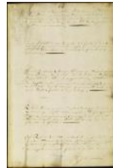
Council minutes (NYSA_A1881-78_V23_0165)