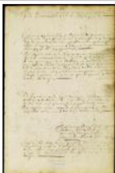
Appointment of Isaac Grevenraet to be schout at Esopus, arrests for sedition, confiscation of furs belonging to Thomas