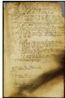
Names of persons whose houses have been removed for the purpose of strengthening Fort Willem Hendrick, with