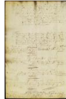
Valuation of the houses near the fort ordered to be demolished and of the lots given in stead (NYSA_A1881-78_V23_0122)