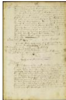
Letter from gov. Colve to the gov. and council of Massachusetts (NYSA_A1881-78_V23_0175b)