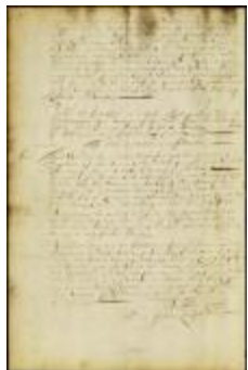
Answer of the town of Southampton, refusing to swear allegiance to the Dutch government (NYSA_A1881-78_V23_0126)