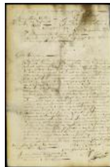
Letter from gov. Colve to the schout and magistrates of Harlem and Fordham (NYSA_A1881-78_V23_0186)