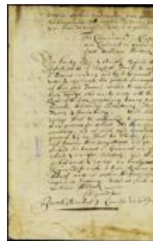
Order to the inhabitants of Elizabethtown and five neighboring towns to nominate magistrates (NYSA_A1881-78_V23_0019)