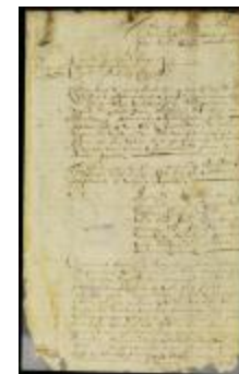
Order for administering the oath of allegiance to the inhabitants of the towns in Achter Col (New Jersey) (NYSA_A1881-