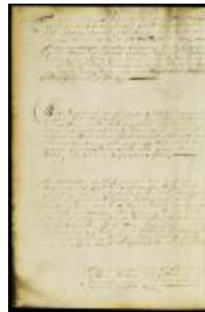
Order defining the jurisdiction of the magistrates of Huntington and Seatacot (NYSA_A1881-78_V23_0164)