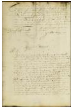
Letter from gov. Colve to gov. Winthrop (NYSA_A1881-78_V23_0162)