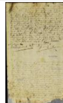
Commission of Nicholas Bayard to be secretary of the province (NYSA_A1881- 78_V23_0077)