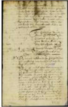
Petition presented by delegates of Oysterbay, with order granting the same (NYSA_A1881-78_V23_0024)