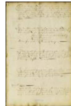
Report of capt. Knyff and the other commissioners sent to administer the oath of allegiance (NYSA_A1881-78_V23_0125c)