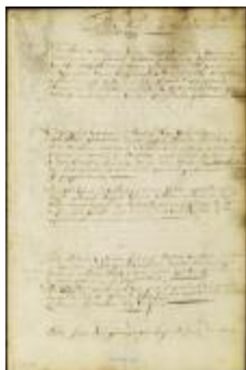
Council minute of approval of some ordinances of the town of Bergen; orders on petitions for lands; Harlem; Esopus