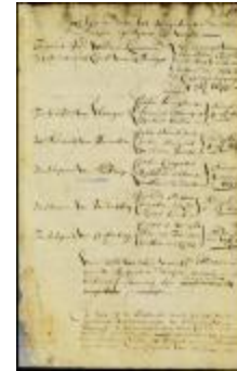
Appointment of magistrates for Flushing and adjoining English towns on Long Island (NYSA_A1881-78_V23_0045)