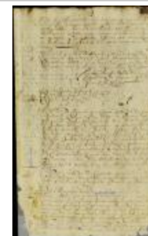
Proclamation against the sojourn of strangers within the city of New Orange (NYSA_A1881-78_V23_0063b)