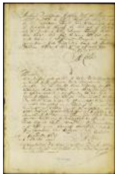
Appointment of magistrates and militia officers for Swaenenburgh (Kingston), Marblatown and Hurley (NYSA_A1881-78_V23_0107)