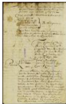
Appointment of magistrates for Bergen, N. J. (NYSA_A1881-78_V23_0018)