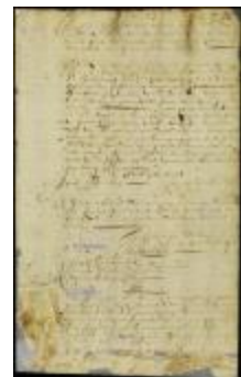
Order continuing to the colonie of Rensselaerwyck privileges for one year (NYSA_A1881-78_V23_0053)