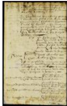
Appointment of magistrates for Elizabethtown, Woodbridge, Shrewsbury and Newark (N. J.) and Mamaroneck