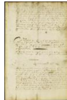
Appointment of Lodewyck Cobbes to be notary public at Willemstadt (NYSA_A1881-78_V23_0147a)