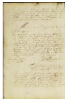
Letter from gov. Colve to the magistrates of Swaenenburgh (NYSA_A1881-78_V23_0112)