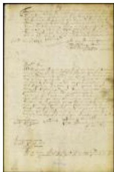
Letter from the town of Seatalcott to the commissioners (NYSA_A1881-78_V23_0129)