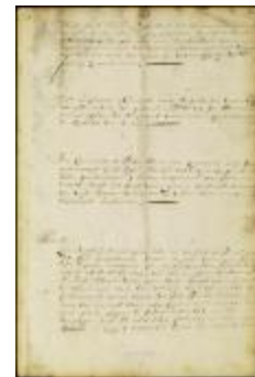
Letter from gov. Winthrop to gov. Colve (NYSA_A1881-78_V23_0161b)