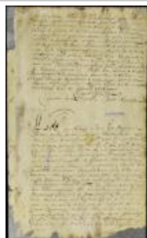
Order fixing Nicholas Bayard's salary (NYSA_A1881-78_V23_0079)