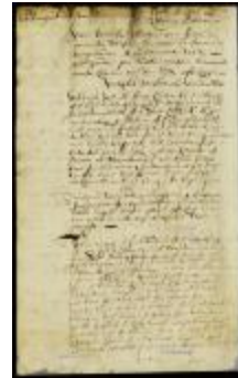
Oath of office of magistrates (NYSA_A1881-78_V23_0026)