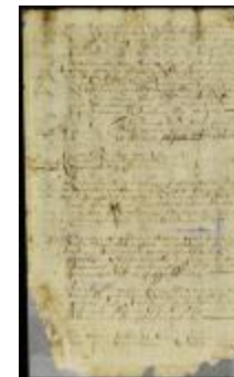
Minute of the departure of Mohawk chiefs from New Orange (NYSA_A1881- 78_V23_0071)