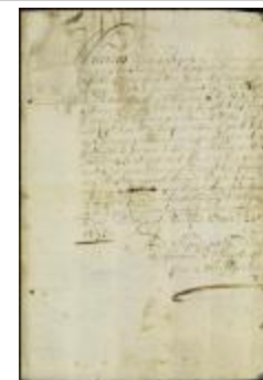
Commission of Samuel Willis and John Winthrop to prevent the Dutch forces using hostility towards the people on the east end