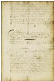
Letter from the general court of Connecticut to governor Colve (NYSA_A1881-78_V23_0147b)