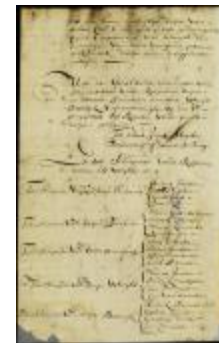
Appointment of magistrates for Brooklyn and adjoining towns (NYSA_A1881-78_V23_0014)