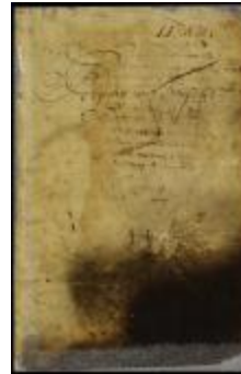
Register of Dutch patents and deeds from 29 November 1673 to 3 November 1674 (NYSA_A1881-78_V23_0433)