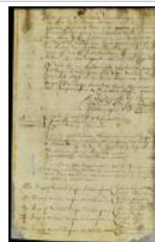
Appointment of magistrates for the towns on the east end of Long Island (NYSA_A1881-78_V23_0059)