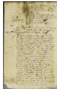
Privileges granted to the several towns in New Jersey (NYSA_A1881-78_V23_0012)