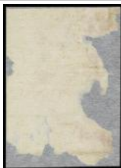
Unidentified fragment (NYSA_A1879- 78_V21_0033a)