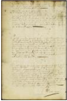
Report of the commissioners sent to the east end of Long Island (NYSA_A1881-78_V23_0152)