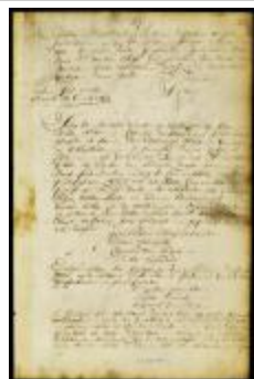
Appointment of magistrates for Willemstadt and Renselaerswyck (NYSA_A1881-78_V23_0107)