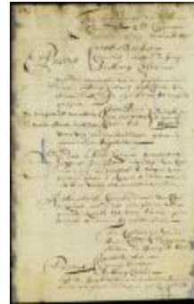
Appointment of magistrates for East and Westchester (NYSA_A1881-78_V23_0044)