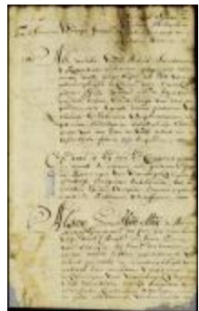
Proclamation seizing all property belonging to the English or French within the province of New Netherland (NYSA_A1881-