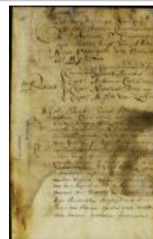
Order allowing Elizabethtown, Newark, Woodbridge and Piscataway, New Jersey to send delegates to surrender to the Dutch