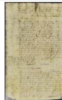
Letter from the commander to the people at the east end of Long Island (NYSA_A1881-78_V23_0060)