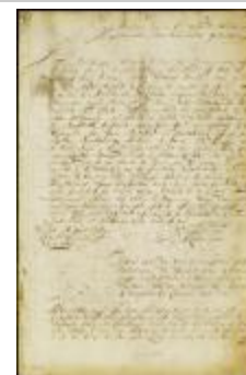
Letter from gov. Colve to the magistrates of Hempstead (NYSA_A1881-78_V23_0085a)