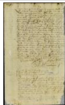
Orders respecting New Jersey and Harlem (NYSA_A1881-78_V23_0062)