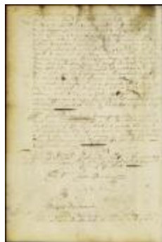
Letter from gov. Colve to gov. Winthrop (NYSA_A1881-78_V23_0148)