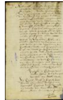
Grant of Shelter Island to Nathaniel Silvester (NYSA_A1881-78_V23_0036)