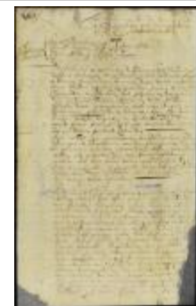
Renewal of the peace with the Indigenous Peoples of Hackensack (NYSA_A1881-78_V23_0068a)