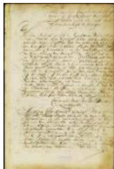
Order to administer the oath of allegiance to the inhabitants of the South river (NYSA_A1881-78_V23_0083a)