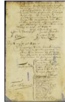
Nomination of burgomasters and schepens (NYSA_A1881-78_V23_0008)