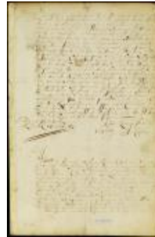
Proclamation ordering the demolition of houses adjoining fort Willem Hendrick (NYSA_A1881-78_V23_0119)