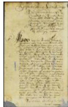
Proclamation altering the form of government of the city of New Orange (NYSA_A1881-78_V23_0010)