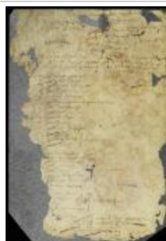
Names of persons who took the oath of allegiance at Harlem (NYSA_A1881- 78_V23_0276)