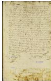
Reply from the commander and council of war to the governor and general assembly of Connecticut (NYSA_A1881-