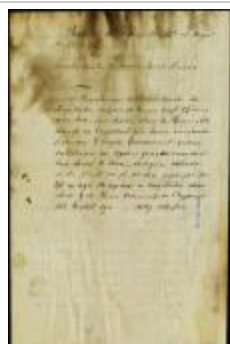
Release of the authorities of the city of New Orange from their oath to the English government (NYSA_A1881-78_V23_0004)