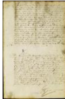
Names of the militia officers of New Orange and their oath (NYSA_A1881-78_V23_0179)