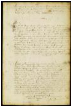
Oath to be administered to the magistrates and militia officers at Esopus (NYSA_A1881-78_V23_0145)