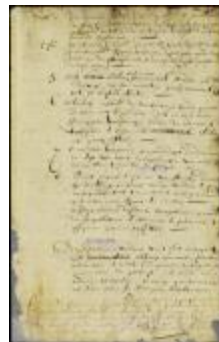
Petition for privileges from Fort Orange (Albany) (NYSA_A1881-78_V23_0047)