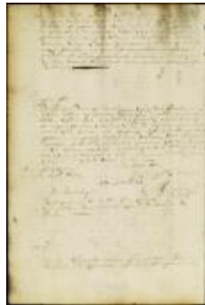
Resolution to detain New England ships and cargoes brought in by captain Ewoutsen (NYSA_A1881-78_V23_0168a)