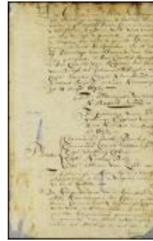
Order for the nomination of burgomasters and schepens for the city of New Orange (NYSA_A1881-78_V23_0007b)