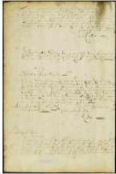
Order to schout Jacob Strycker to call on constables to account for and pay public taxes (NYSA_A1881-78_V23_0118a)