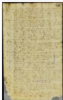
Privileges granted to the inhabitants of the South river (Delaware) (NYSA_A1881-78_V23_0065)