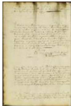
Council minutes (NYSA_A1881-78_V23_0160b)