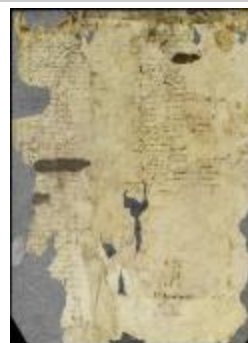
Names of persons who have taken the oath at Elizabethtown, Shrewsbury, Middletown, Piscataway, Newworke, Woodbridge and