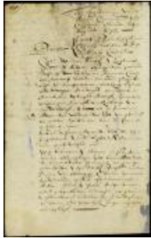
Oath of allegiance and order to administer the oath to the inhabitants of Long Island (NYSA_A1881-78_V23_0040)