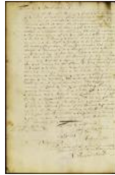
Translation of proclamation for a day of Humiliation and Thanksgiving into English (NYSA_A1881-78_V23_0158)