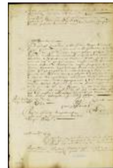
Letter from gov. Colve to the schout and magistrates of Bergen (NYSA_A1881-78_V23_0183)