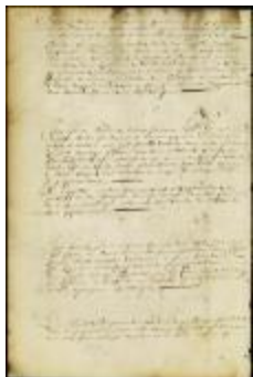
Council minute that all persons are bound to contribute to the support of the precentor and schoolmaster (NYSA_A1881-