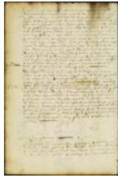
Proclamation for a day of Humiliation and Thanksgiving (NYSA_A1881-78_V23_0156)