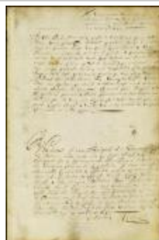
Resolution to send a second embassy to the towns on the east end of Long Island (NYSA_A1881-78_V23_0137a)