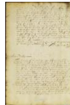
Letter from the recorder and constable complaining of those of Southampton (NYSA_A1881-78_V23_0128)