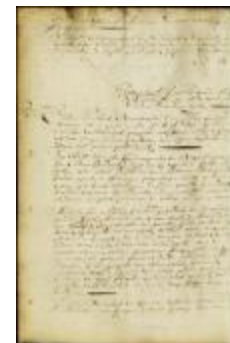
Instructions for the schout and magistrates of Willemstadt and Renselaerswyck (NYSA_A1881-78_V23_0150)