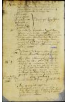
Orders to the burghers of New Orange to send delegates to confer with the Dutch commanders (NYSA_A1881-