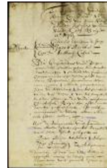
Order to the towns on the east end of Long Island to nominate magistrates; appointment of magistrates for Staten Island