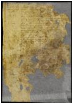
Patent of Nicholas Bayard of a lot in New Orange (NYSA_A1881-78_V23_0433_19)