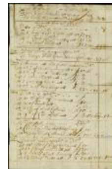
Some leaves of an account book with prices of various articles (NYSA_A1881-78_V23_0295)