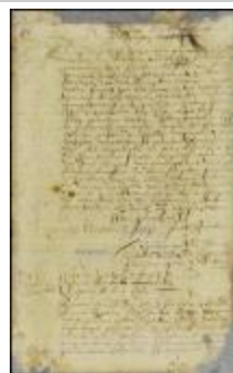
Answer granting petition of the schout, burgomasters and schepens of New Orange (NYSA_A1881-78_V23_0058)