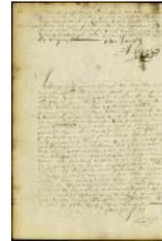
Commission of Isaac Grevenraet to be schout at Esopus (NYSA_A1881-78_V23_0144)