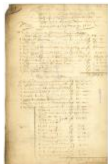
INVOICE of goods sent to New Netherland (NYSA_A1883-78_V17_017)