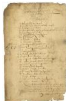
INVENTORY of guns, ammunition and stores on Curaçao (NYSA_A1883-78_V17_018)