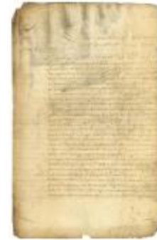
LETTER from Matthias Beck, vice-director of Curaçao to Petrus Stuyvesant (NYSA_A1883-78_V17_023)