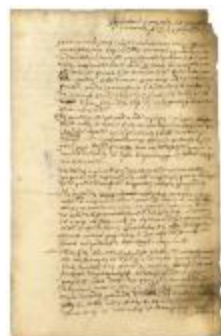
RESOLUTION concerning employment of personnel and increase of salaries (NYSA_A1883-78_V17_010c)