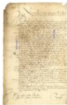
LETTER from Matthias Beck, vice-director of Curaçao to Petrus Stuyvesant (NYSA_A1883-78_V17_039)