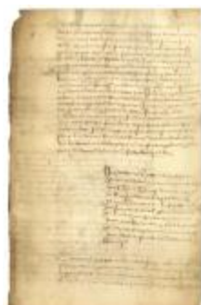
Copy of Documents 11 and 12 (NYSA_A1883-78_V17_013)