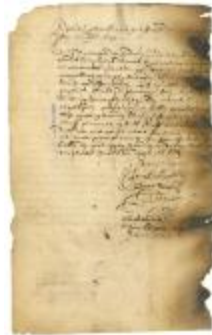
RESOLUTION against plundering gardens belonging to Blacks and indigenous peoples (NYSA_A1883-78_V17_002d)