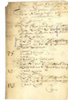
MANIFEST of animals and provisions loaded at Curaçao for New Netherland (NYSA_A1883-78_V17_062)