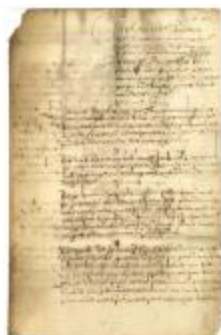
FREEDOMS AND EXEMPTIONS granted to Joseph Nunes de Fonseca's colony on Curaçao (NYSA_A1883-78_V17_012)