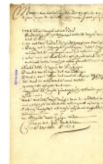
MEMORANDUM of necessities for Curaçao (NYSA_A1883-78_V17_034)