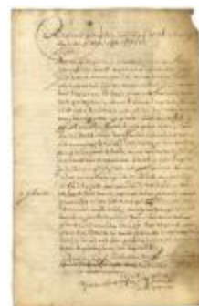
RESOLUTION to seek a harbor in Ireland for Stuyvesant's ship during his return to the fatherland (NYSA_A1883-78_V17_010d)