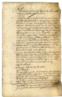
RESOLUTION to return Company servants and soldiers to the fatherland (NYSA_A1883-78_V17_010b)