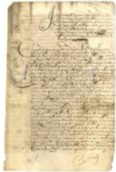
DEPOSITIONS relating to the seizure by pirates of enslaved individuals aboard the wrecked slaver St. Jan (NYSA_A1883-