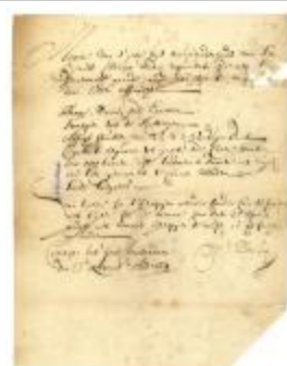
MEMORANDUM of necessities for Curaçao (NYSA_A1883-78_V17_098)