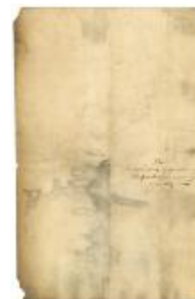
INSTRUCTIONS given by Petrus Stuyvesant to Matthias Beck, vice-director of Curaçao (NYSA_A1883-78_V17_019)